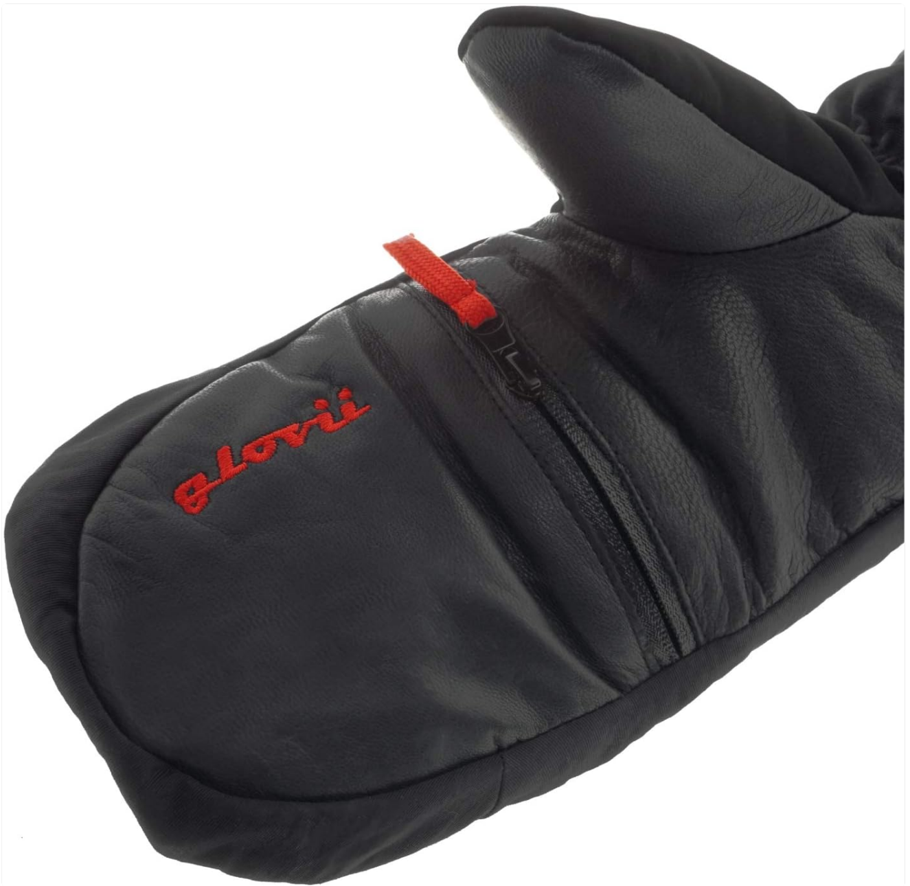
Image: The control button for powering on/off and adjusting heat settings.