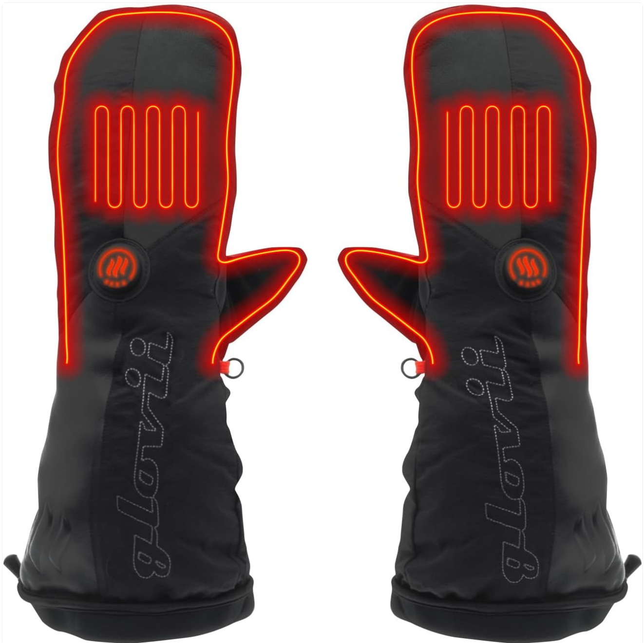
Image: The mittens with the heating elements visibly active.