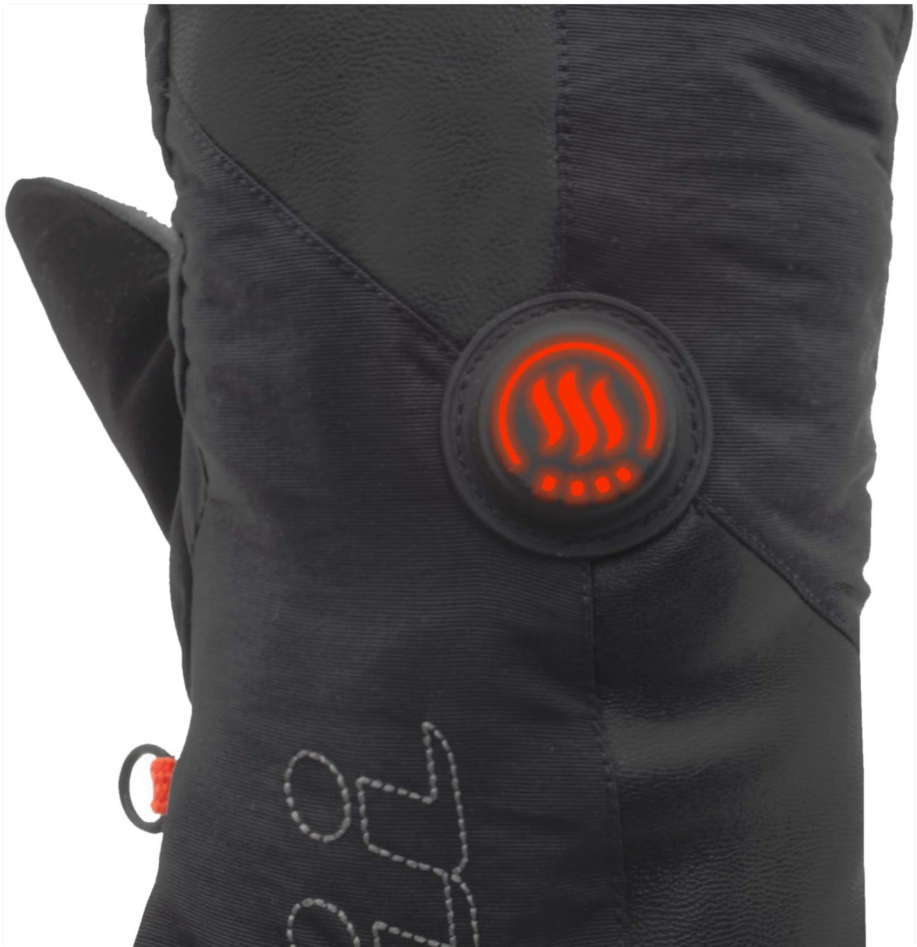
Image: The zippered pocket on the mitten where the battery is stored.