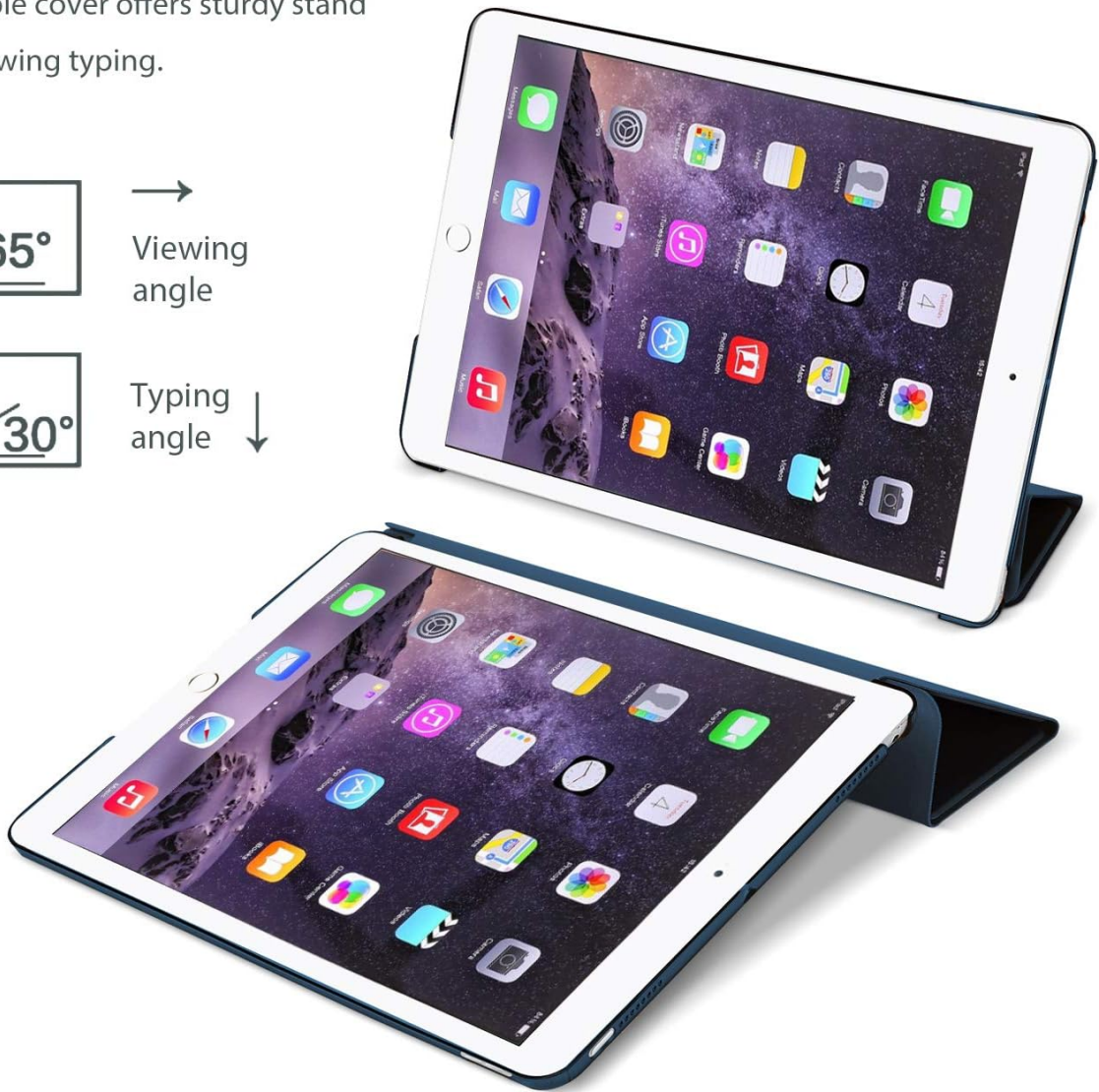
Image: Visual guide demonstrating how to fold the case cover to achieve both the 65-degree viewing angle and the 30-degree typing angle for the iPad.

Your browser does not support the video tag.