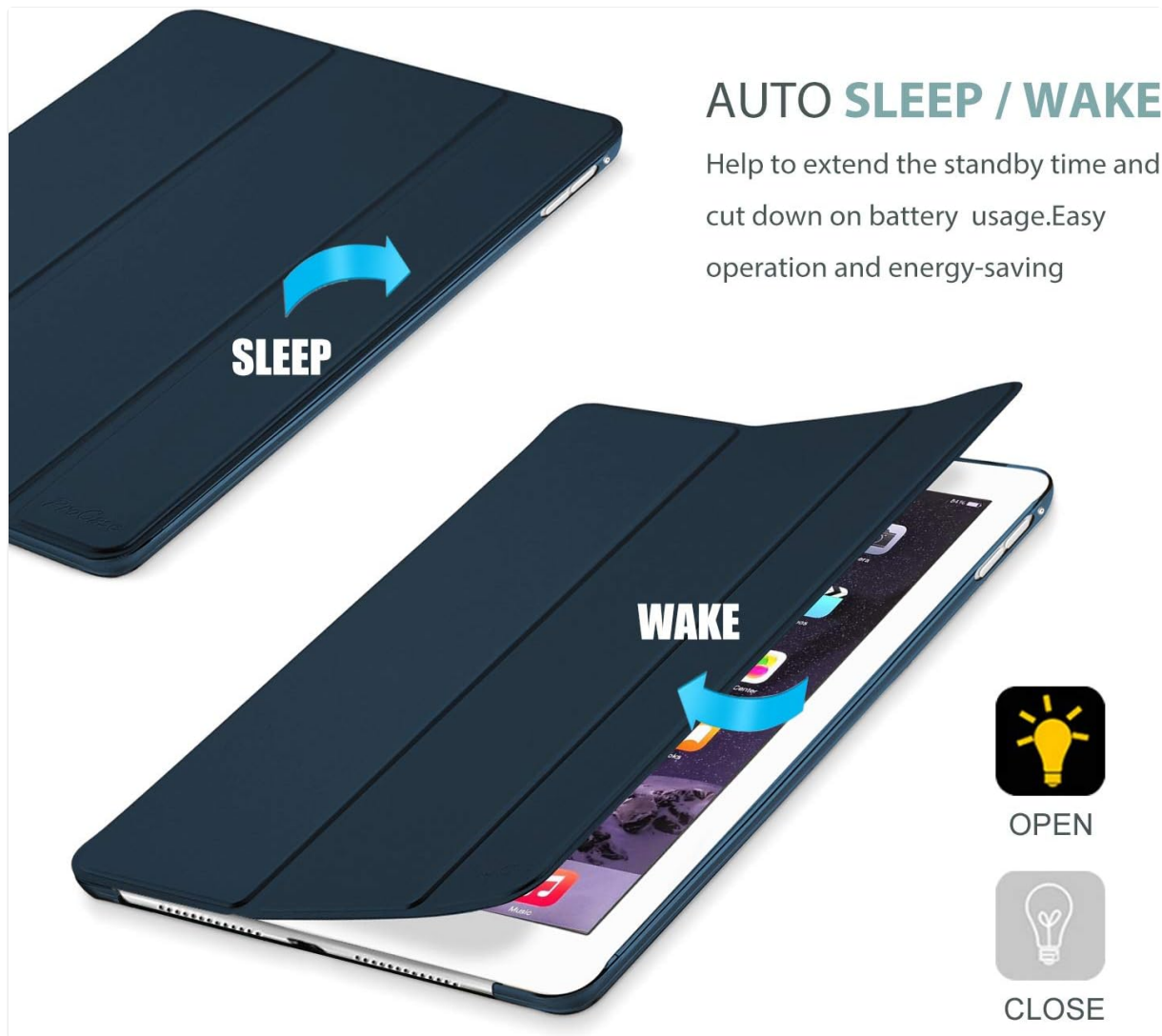
Image: Visual demonstration of the auto sleep/wake feature, with arrows indicating the iPad screen's response to opening and closing the case cover.