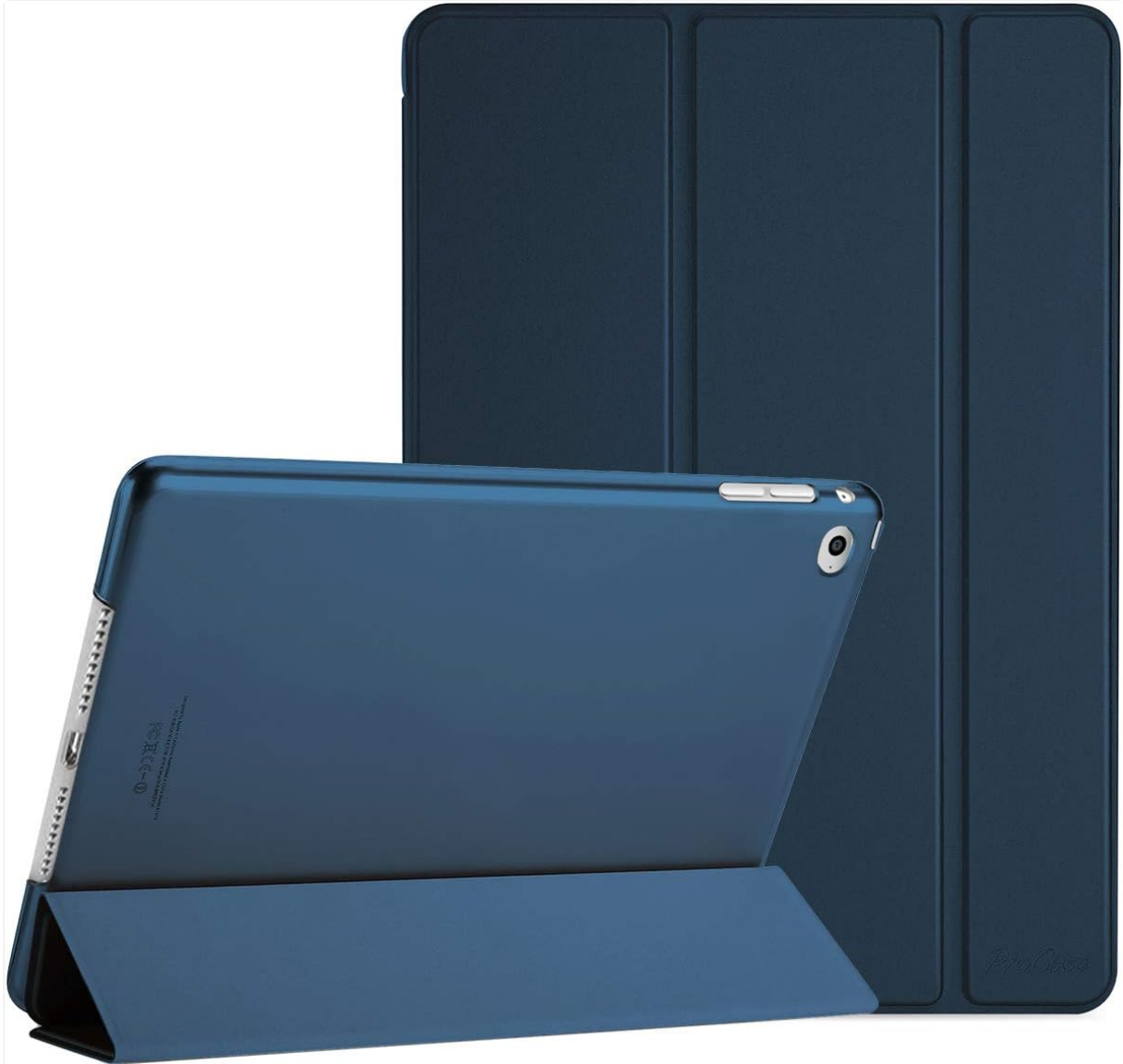
Image: A navy ProCase Smart Case with an iPad Air 2 securely installed, showcasing the precise fit.

Gently align your iPad Air 2 with the hard back shell of the ProCase Smart Case. Press firmly around the edges until the iPad snaps securely into place. Ensure all corners are properly seated within the case for maximum protection.