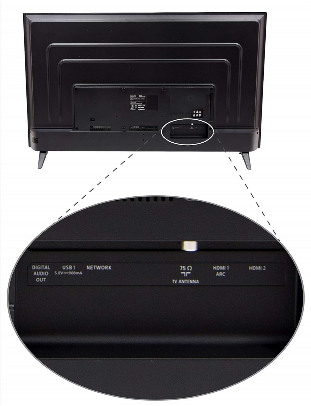
Image: Detailed view of bottom-facing rear ports.