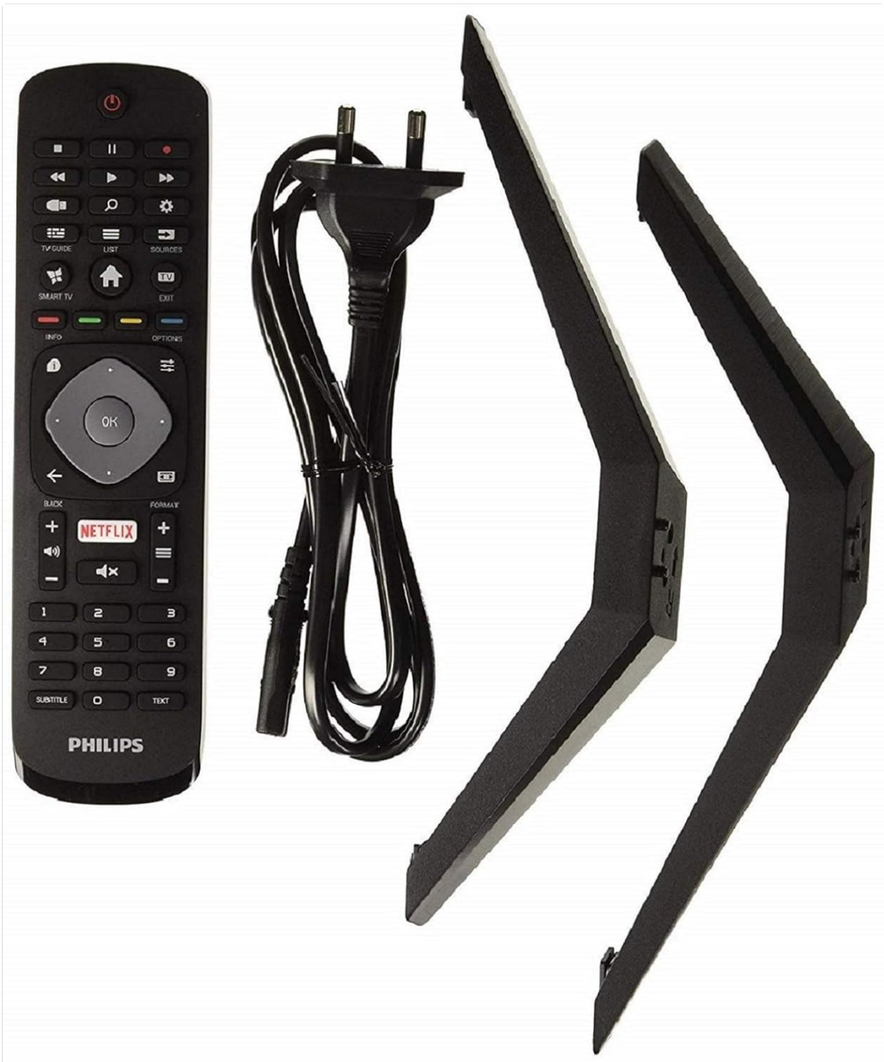
Image: Contents of the Philips 55PUT6103S/94 TV package.