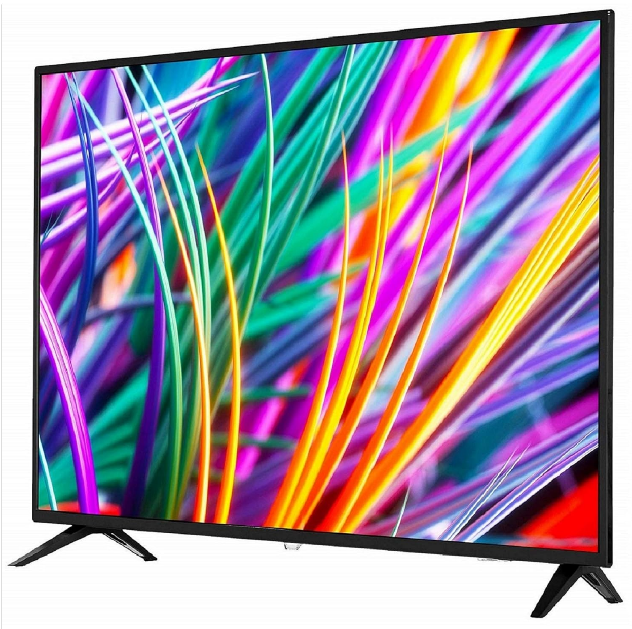
Image: Angled view highlighting the TV's slim profile and vibrant display.