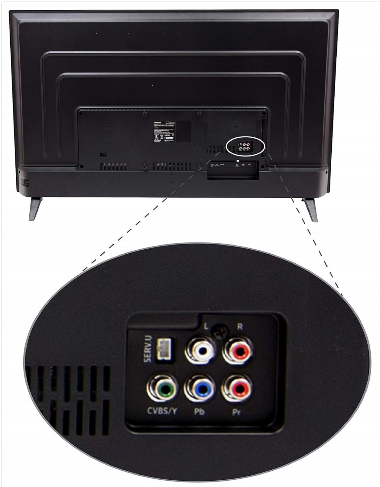
Image: Detailed view of analog component video and audio inputs.