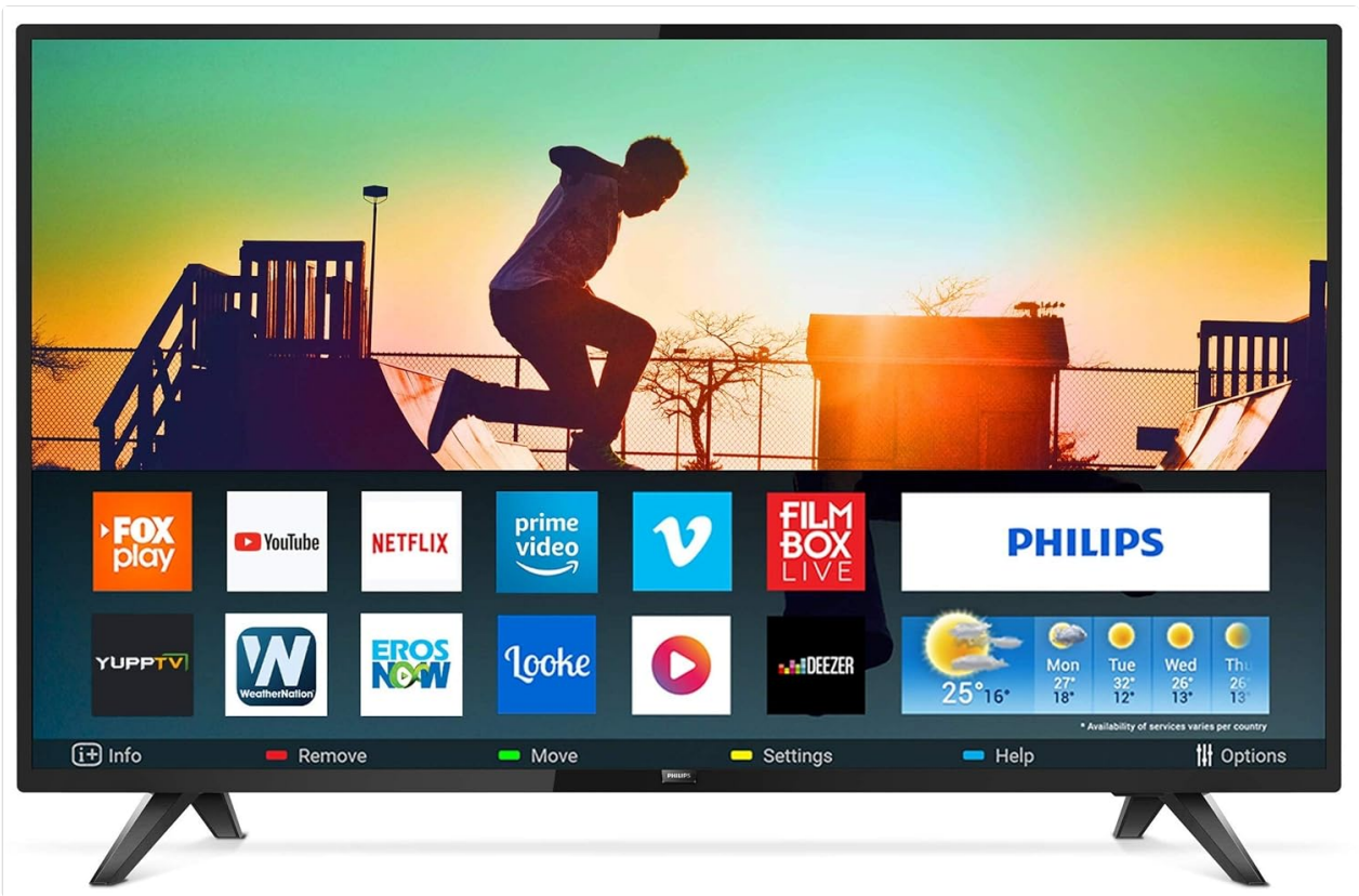
Image: Front view of the Philips Smart TV with its user interface.