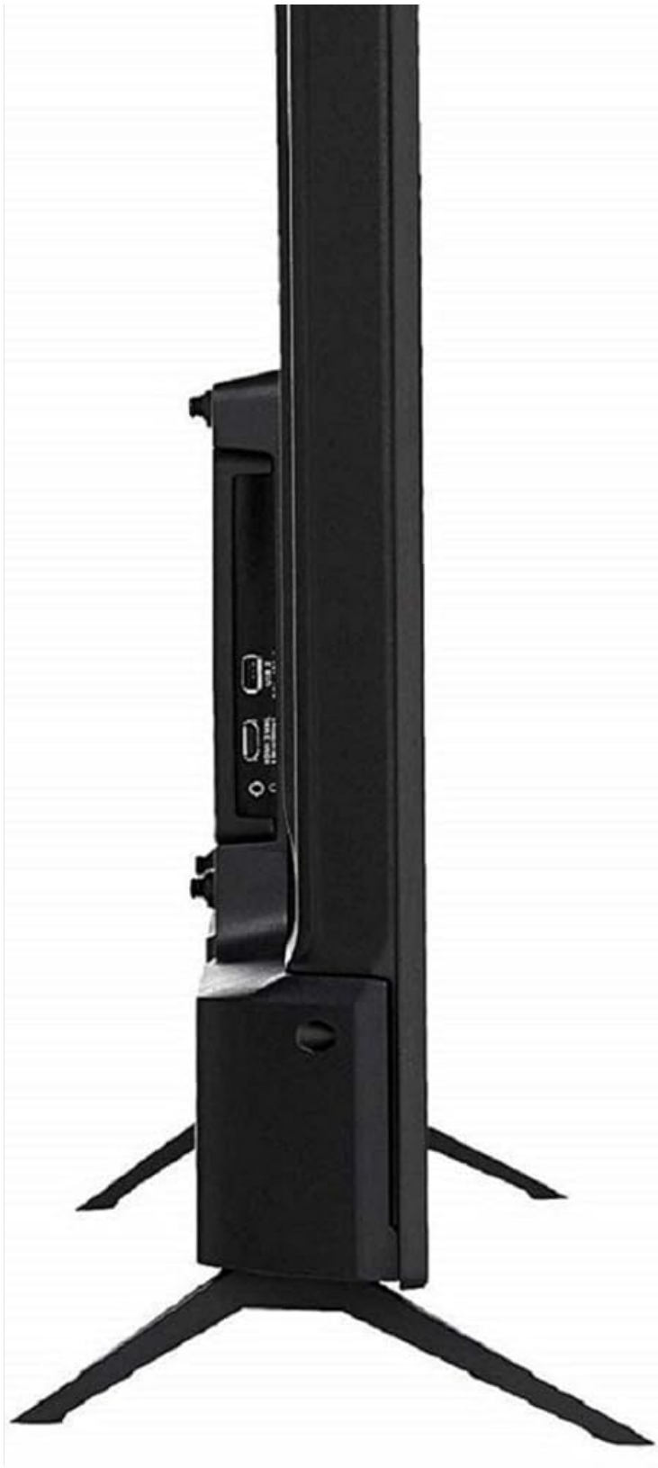
Image: Side view of the TV.