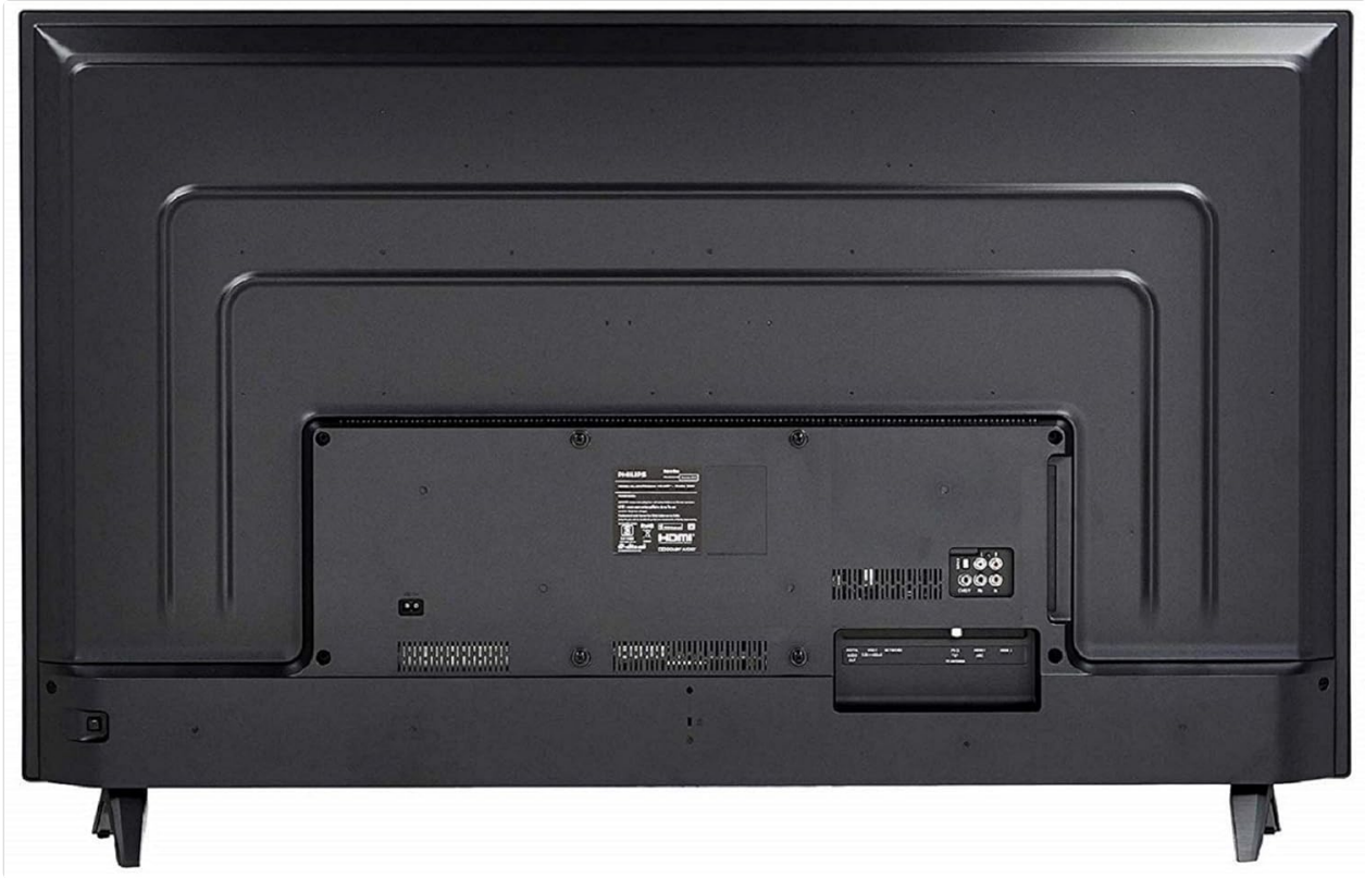
Image: Rear view of the TV, showing the back panel and port areas.