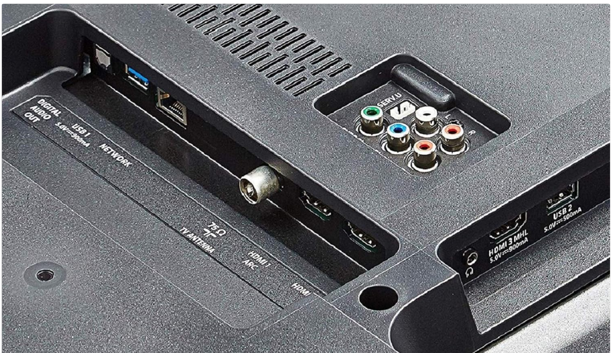
Image: Close-up of the main rear connectivity panel.

The TV is equipped with multiple input and output ports to connect various external devices.