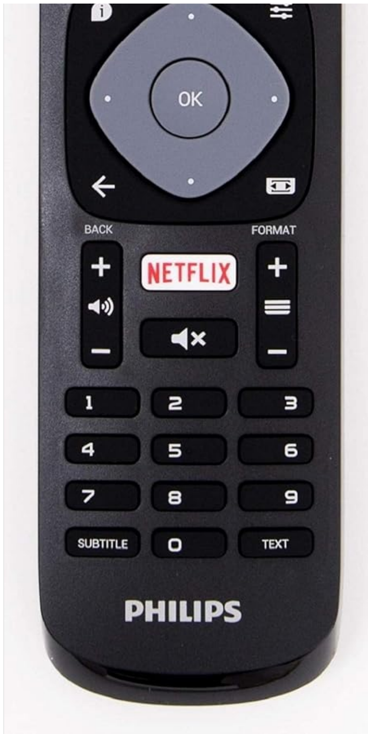
Image: Philips Smart TV remote control.