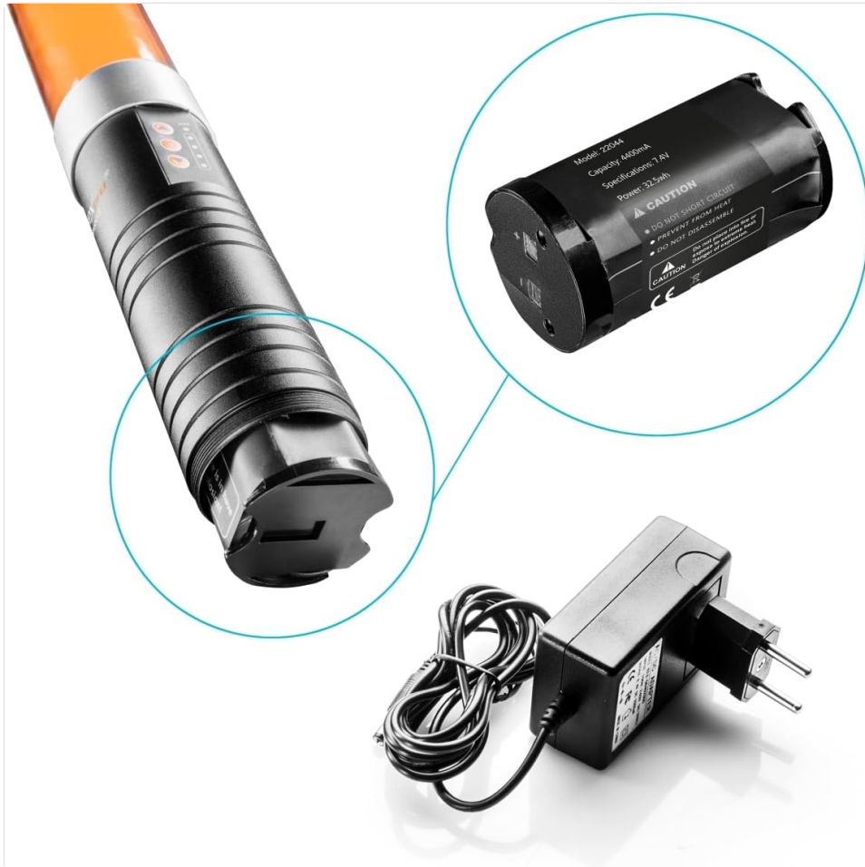
Figure 5.1: Battery and Charger

The image illustrates the removable battery and the included battery charger, essential for powering the device.