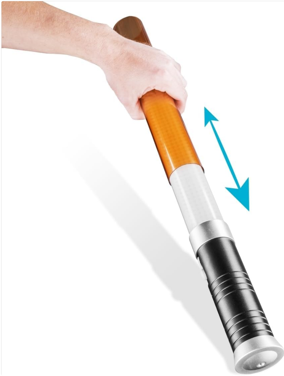
Figure 9.2: Splash-Proof Design

The image demonstrates the light bar's resistance to water splashes, making it suitable for outdoor use.