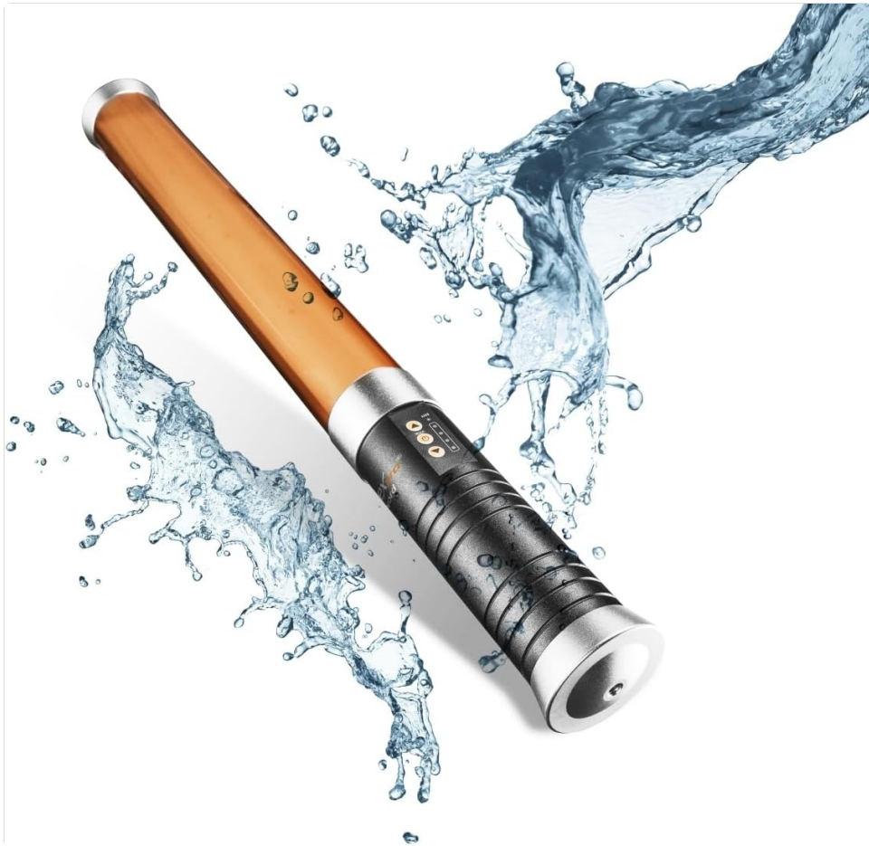
Figure 6.2: Handheld Use

The light bar's design facilitates easy and comfortable handheld operation for flexible lighting.