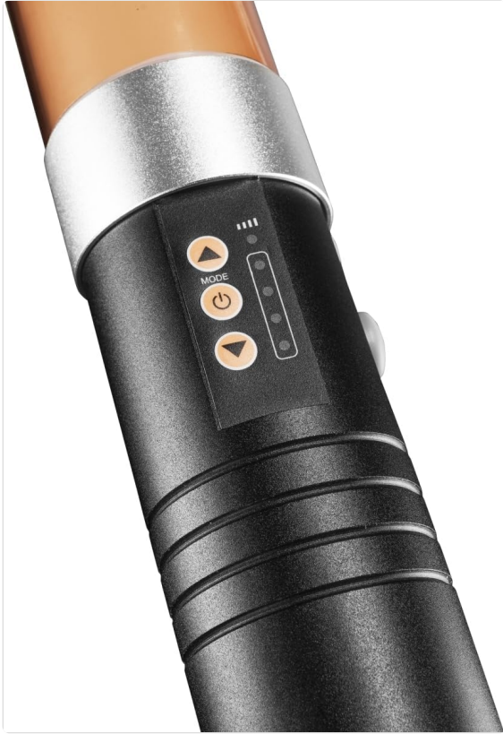
Figure 4.1: Control Panel

Familiarize yourself with the main components and controls of your Ice Sword 300 Plus LED light bar.