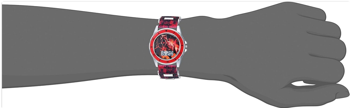
Image 2: The Accutime JRW4026 watch displayed on a wrist, showing its fit and digital time display.