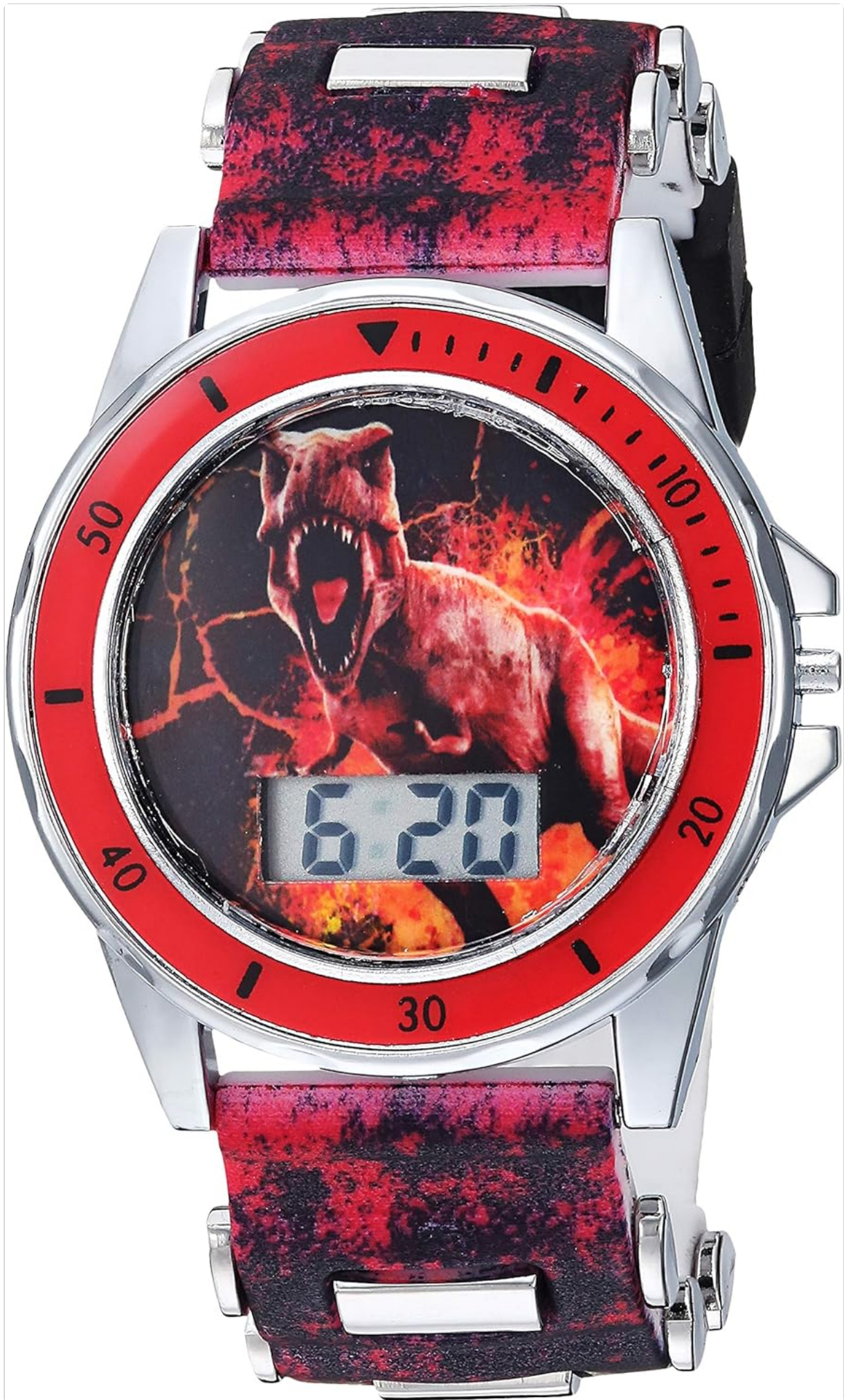
Image 1: Front view of the Accutime JRW4026 Quartz Digital Watch, showcasing the T-Rex face and digital time display.