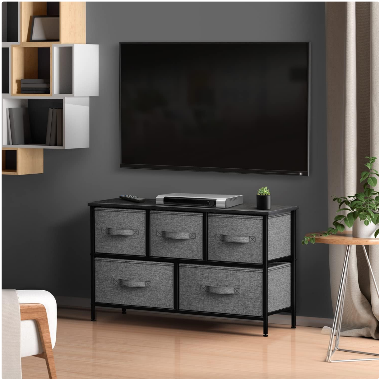
Image 1: The Sorbus 5-Drawer Dresser in a typical home environment.