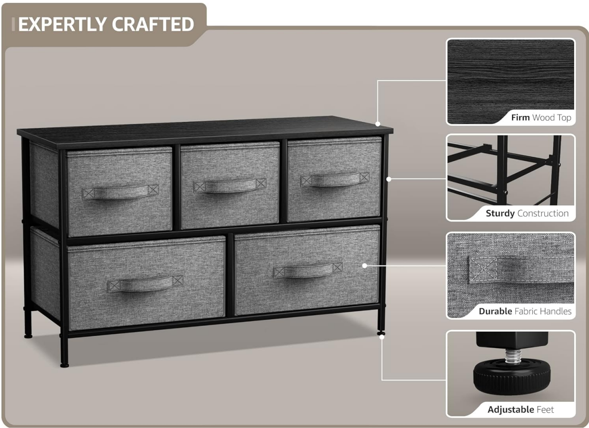
Image 4: Detailed view of the dresser's construction and features.