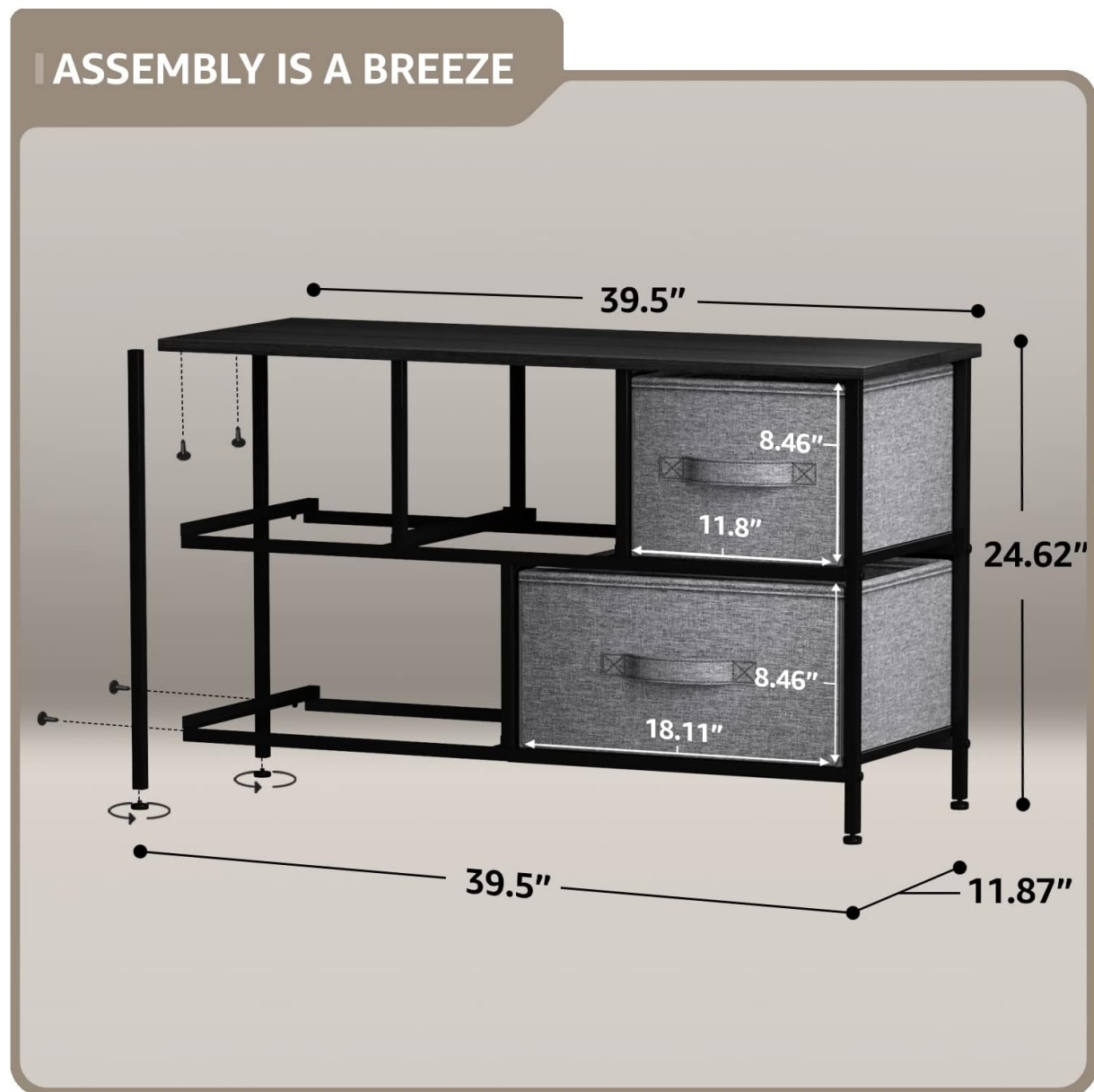
Image 2: Assembly diagram with key dimensions (39.5"W x 11.87"D x 24.62"H).