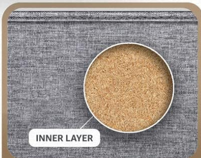
DURABLE MDF WOOD CORE