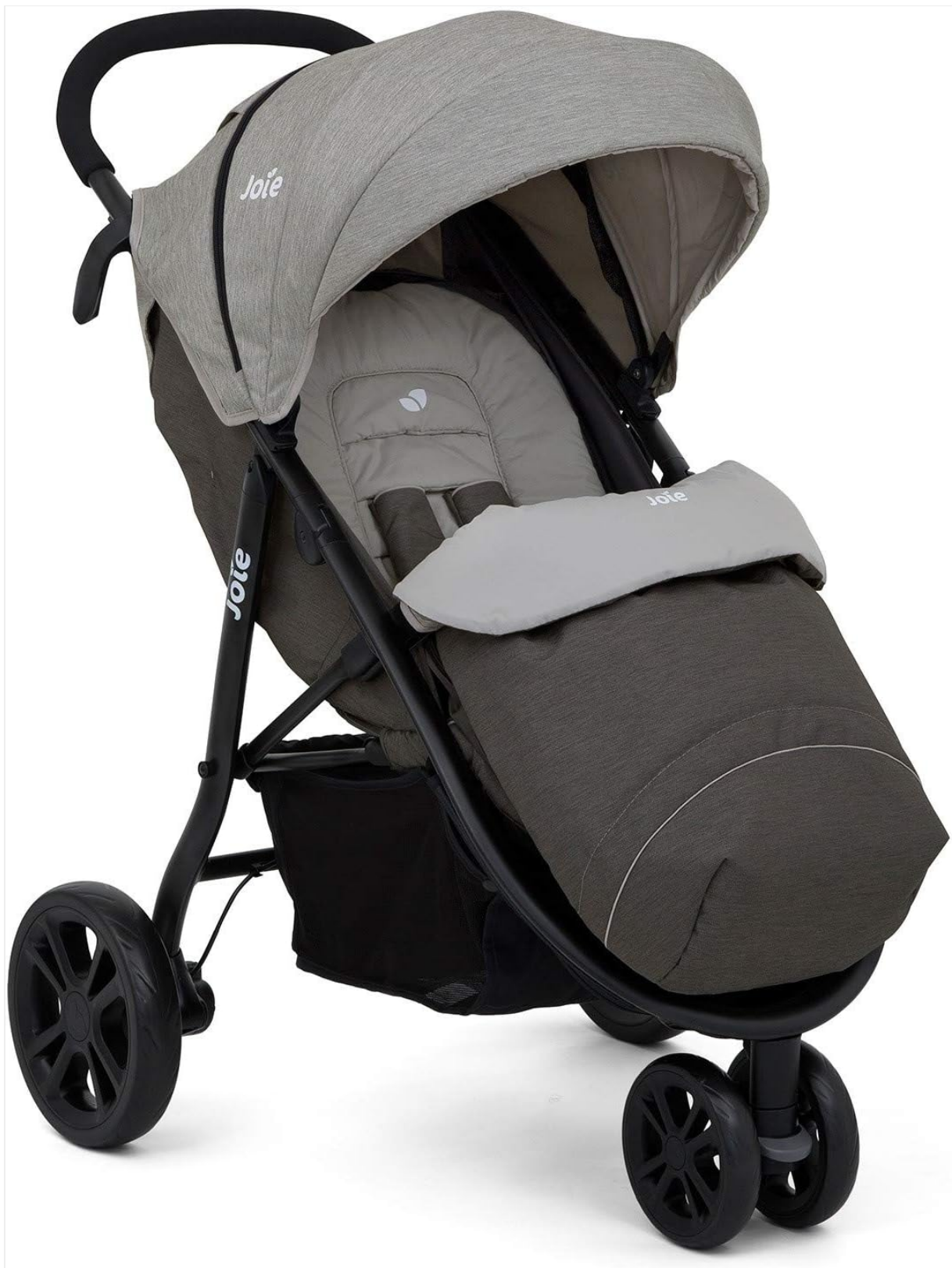
Image Description: A side view of the Joie Litetrax 3 Stroller in dark pewter and grey, featuring a footmuff for added warmth. The stroller has a large canopy, a sturdy black frame, and three wheels (two rear, one double front).