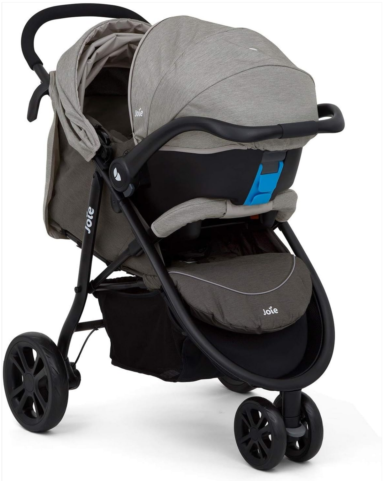
Image Description: A Joie Litetrax 3 Travel System Stroller in dark pewter and grey, shown with a matching Joie Gemm infant car seat securely attached to the stroller frame. The stroller features a black frame, large wheels, and a storage basket underneath.