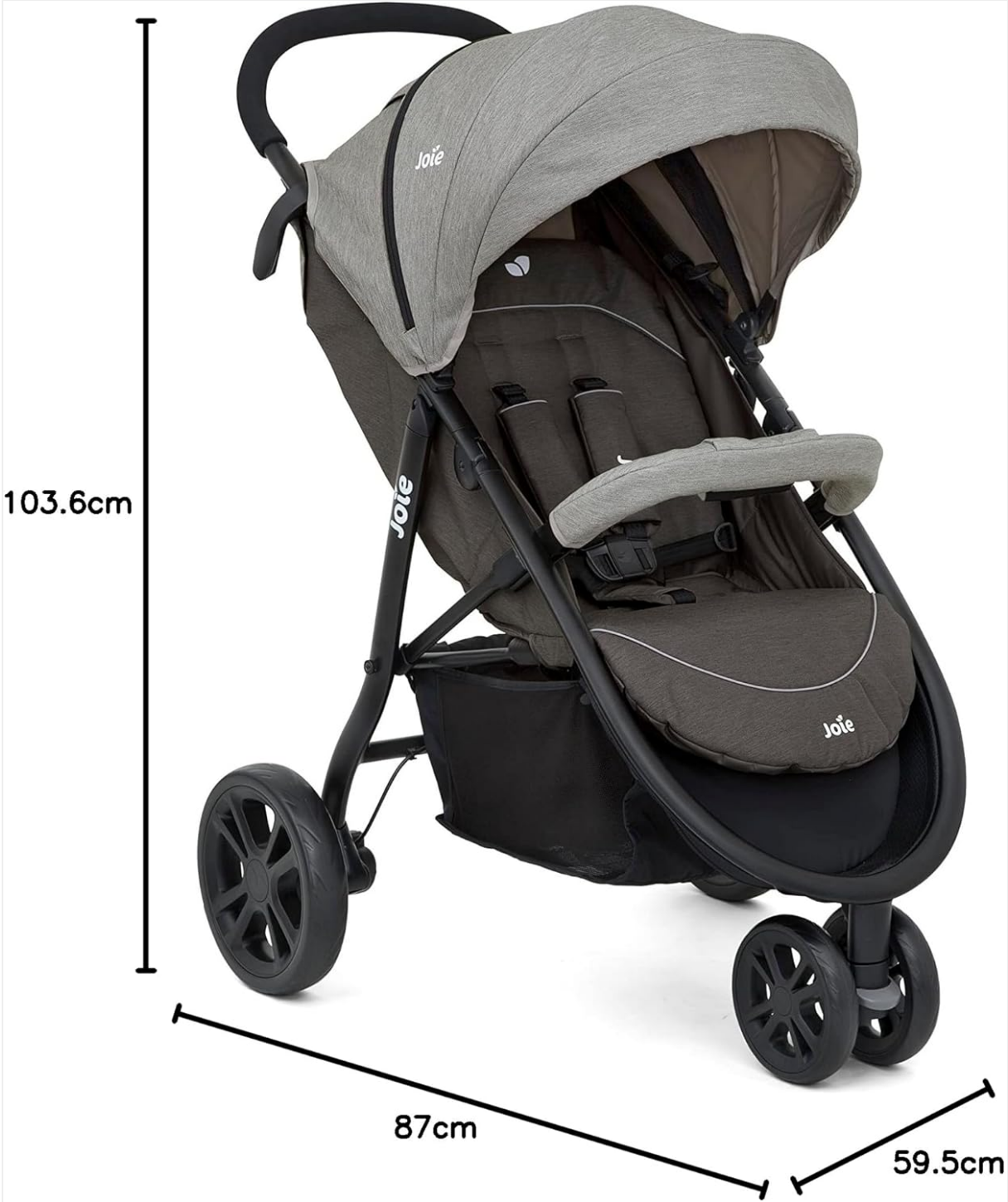
Image Description: A front-side view of the Joie Litetrax 3 Stroller with key dimensions overlaid. The height is labeled as 103.6cm, the length as 87cm, and the width as 59.5cm.