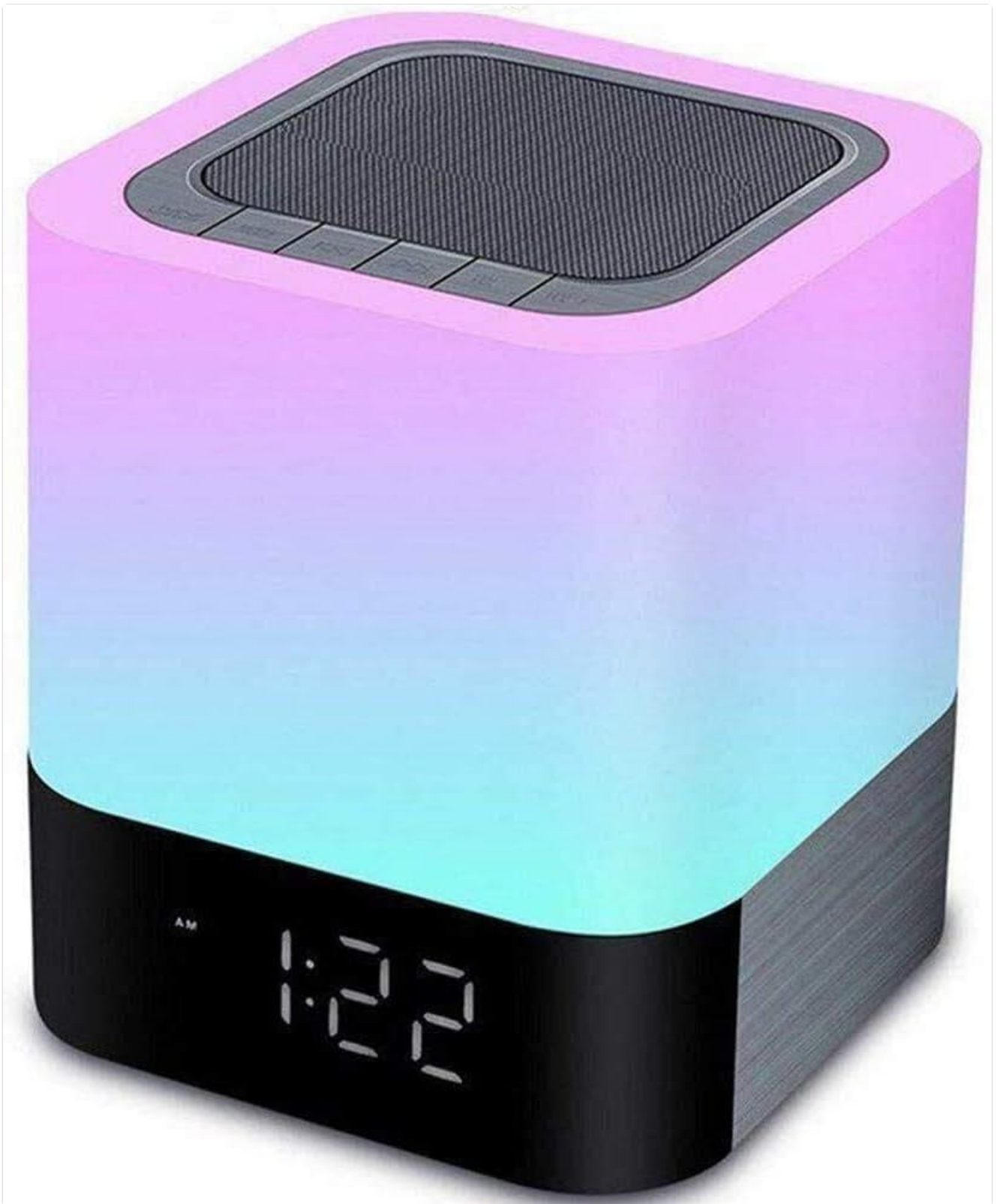
Figure 1: Front view of the Aisuo Night Light, highlighting its compact design and integrated clock display.