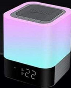
Figure 4: The night light showcasing its diverse color palette, suitable for various settings.