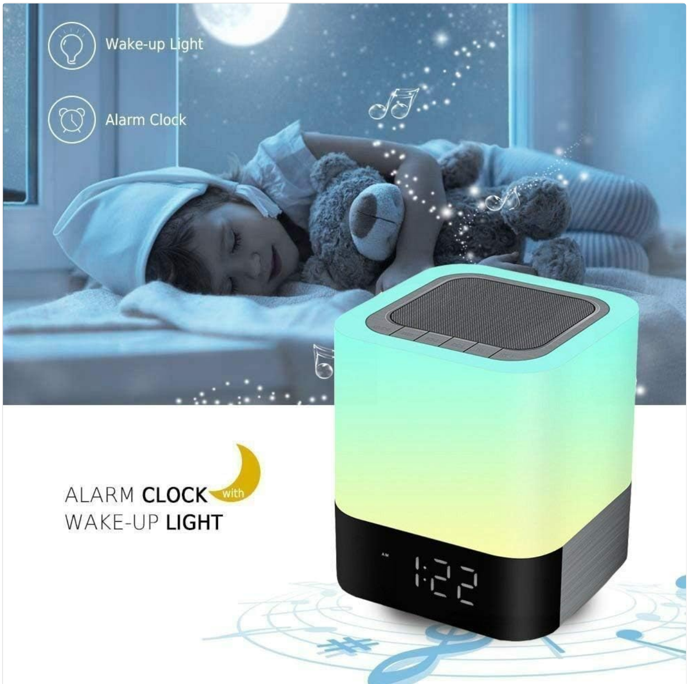
Figure 7: The device functioning as an alarm clock with a gentle wake-up light feature.