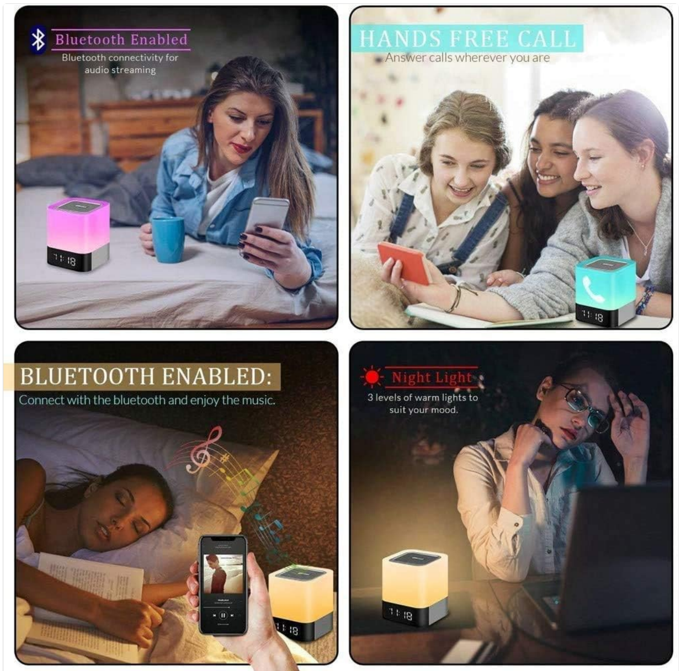
Figure 6: Various usage scenarios, including Bluetooth connectivity for audio streaming and hands-free communication.