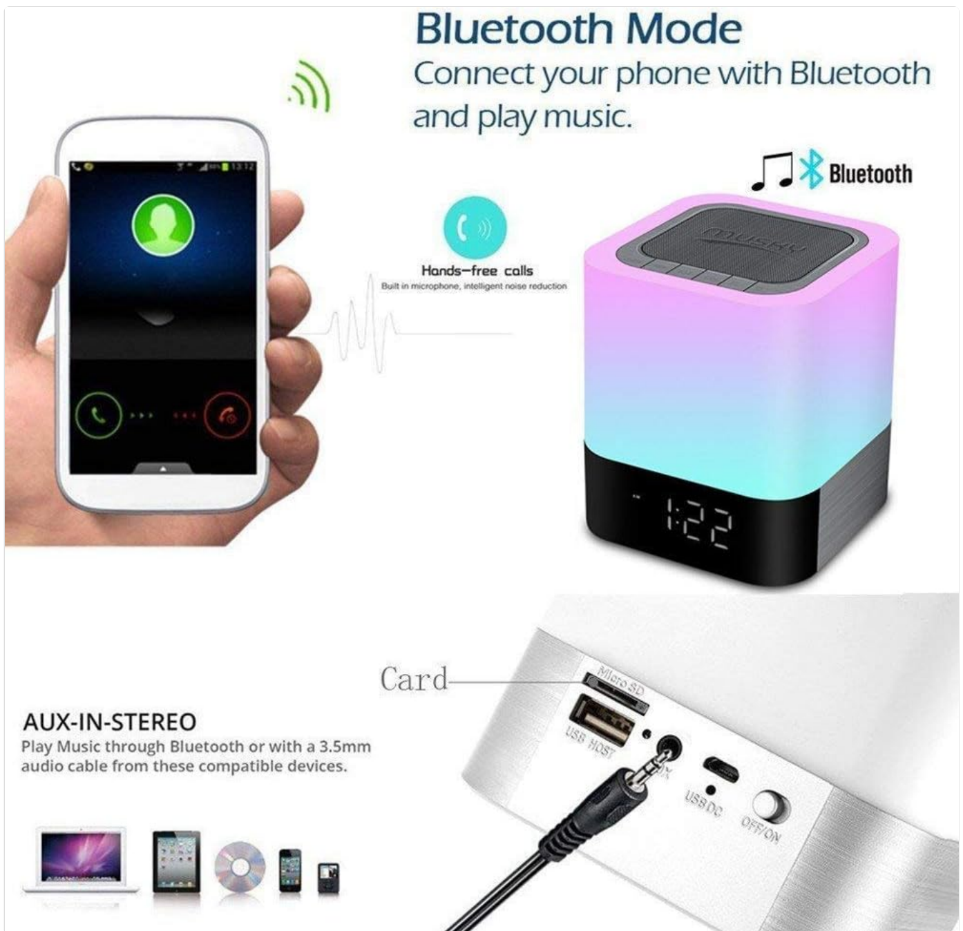
Figure 3: Rear view of the device, illustrating the various input and output ports for connectivity.