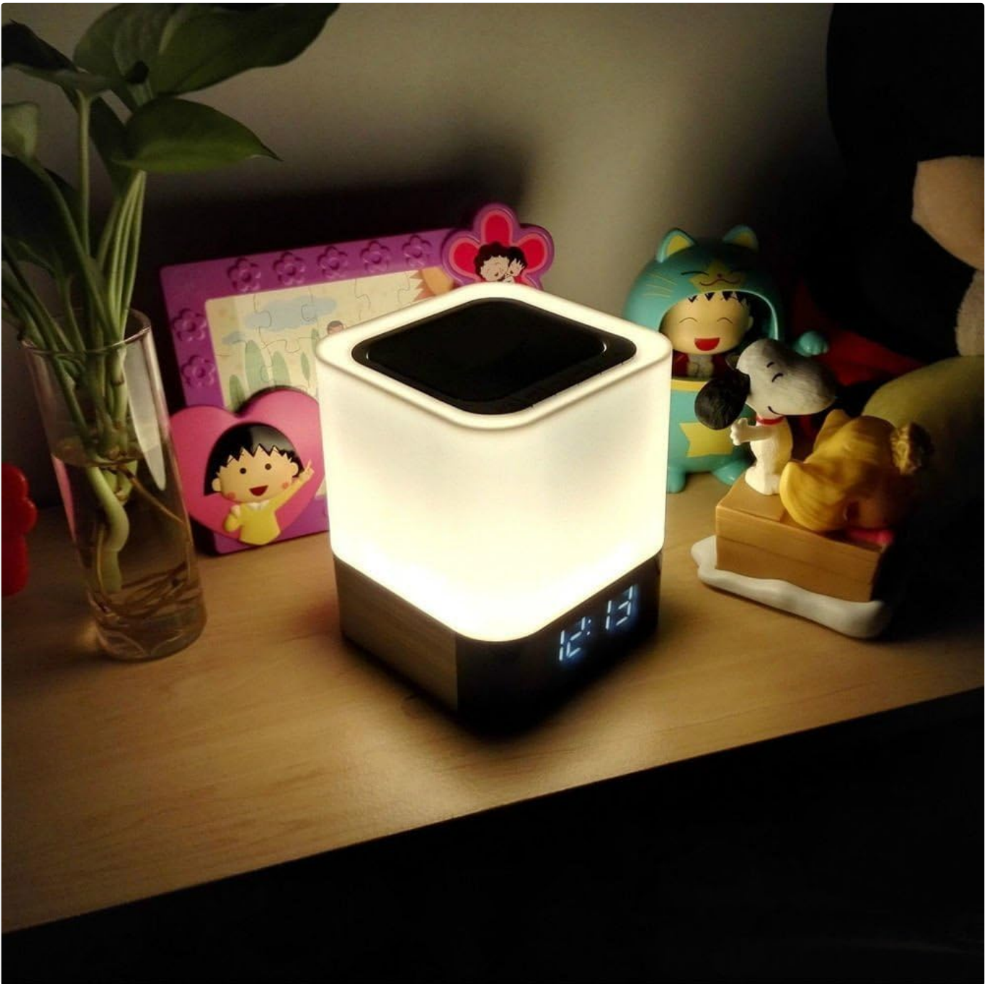
Figure 5: The device providing warm ambient lighting, ideal for a bedroom setting.