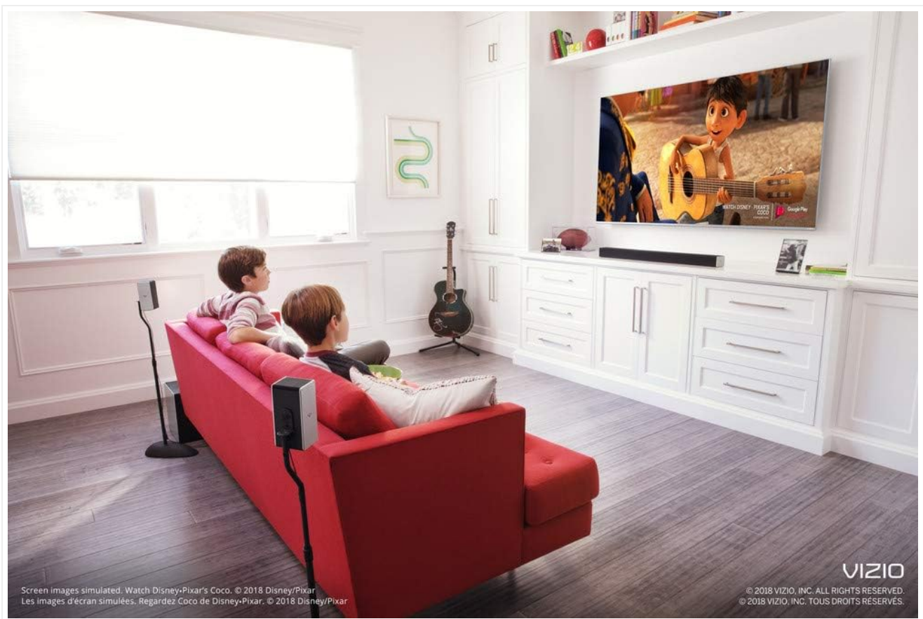
Figure 2: Example setup of the VIZIO sound bar system in a living room, demonstrating speaker placement for an immersive experience.