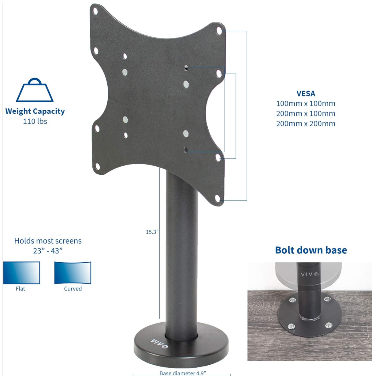
Figure 2: VESA compatibility, weight capacity, and key dimensions of the stand.