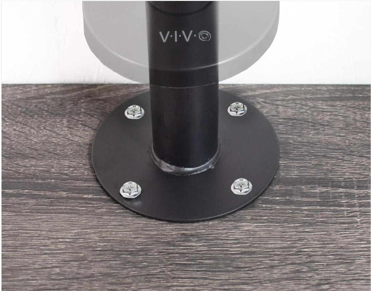
Figure 3: The bolt-down base provides enhanced stability when secured to a surface.