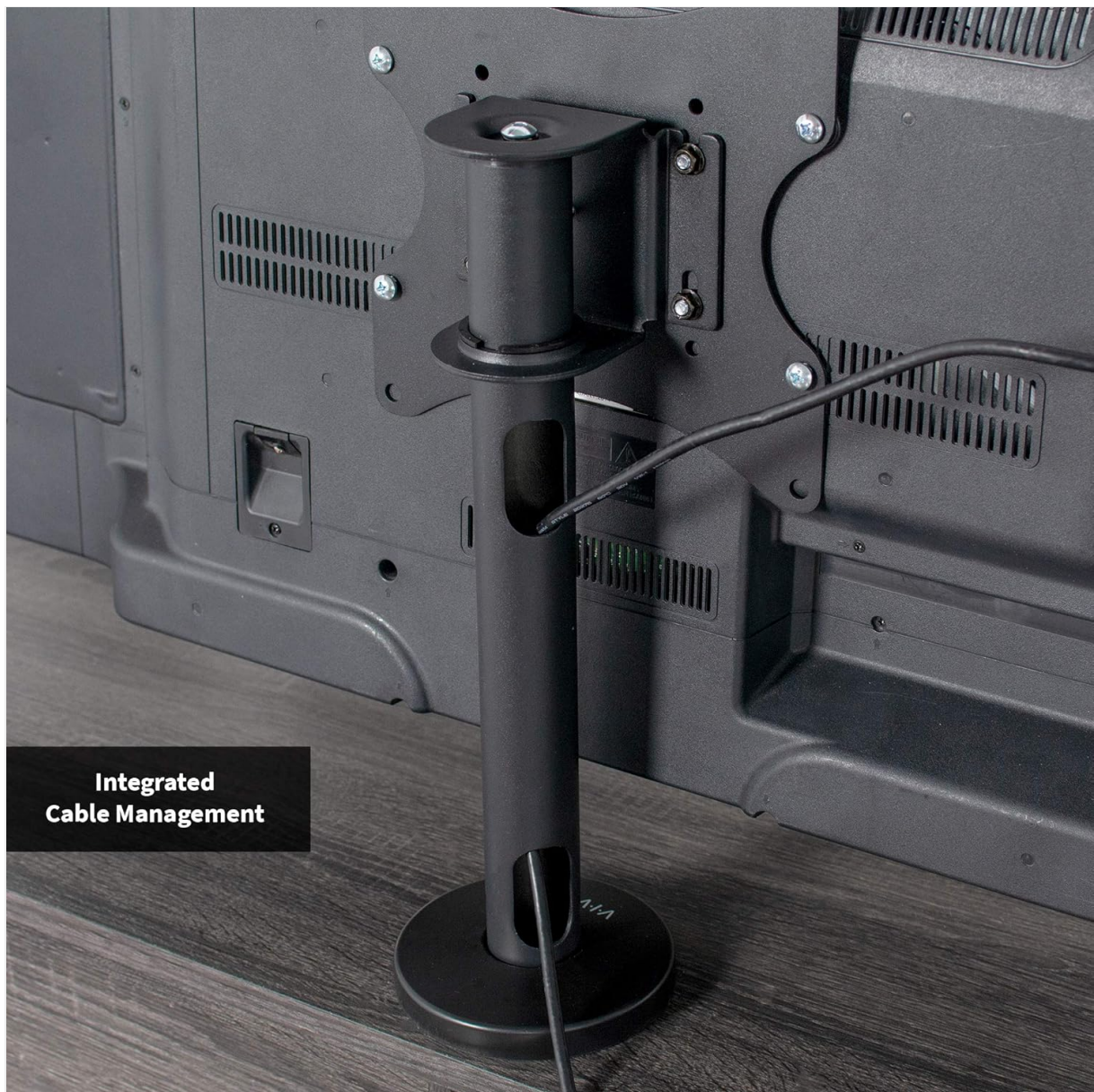
Figure 6: Cables can be routed through the support pole for a clean setup.