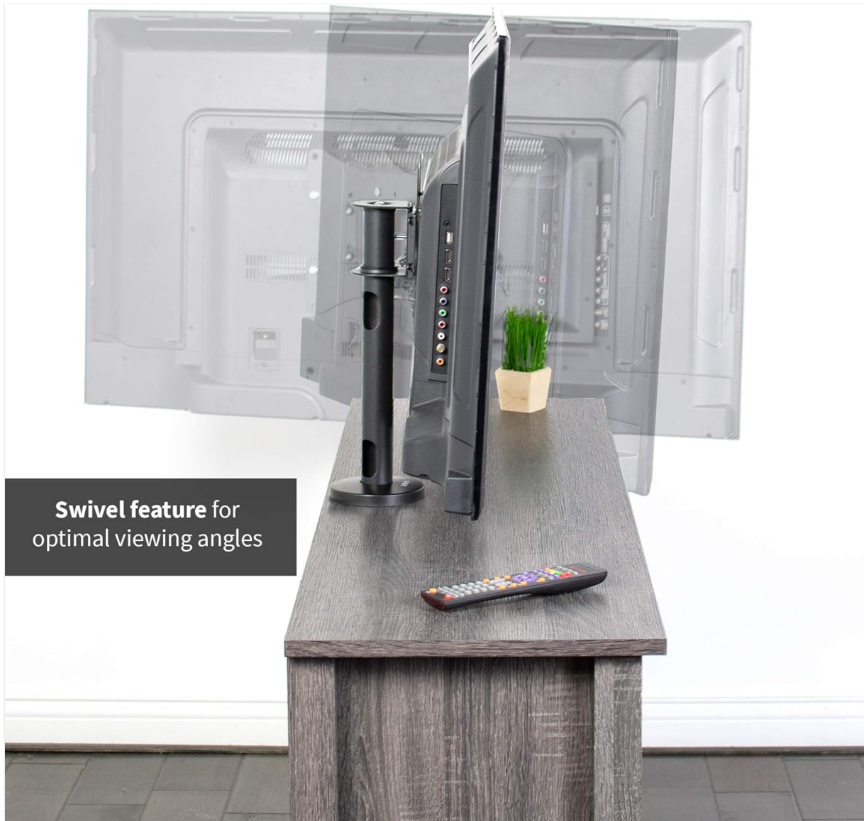
Figure 5: The swivel feature allows for optimal viewing angles.