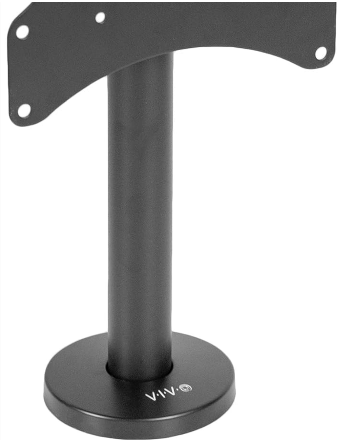
Figure 1: VIVO Swivel Bolt-Down TV Stand with a television mounted.