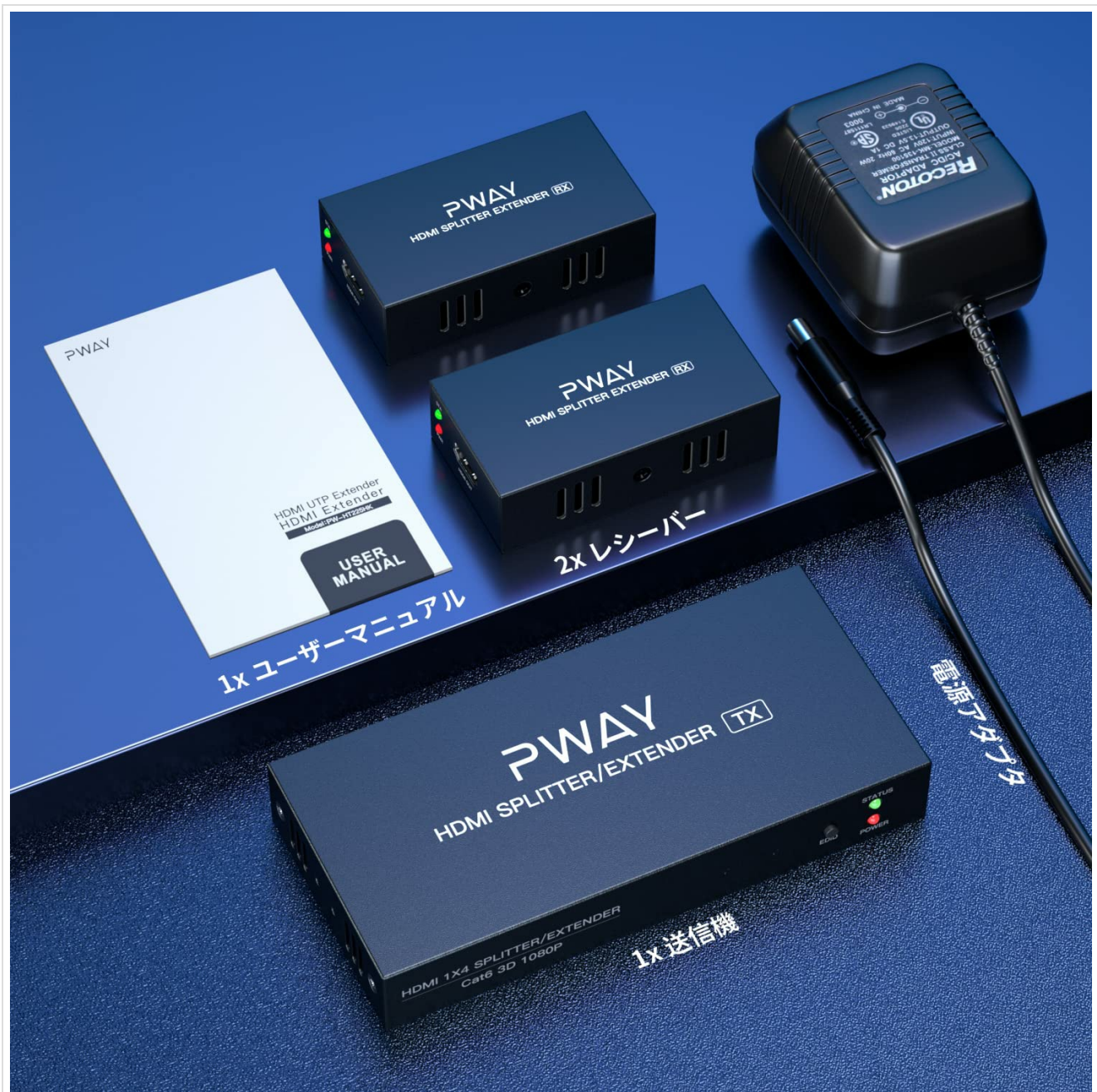
Image: Contents of the PWAY PW-HTS0102 package, including the transmitter, two receivers, power adapter, and user manual.