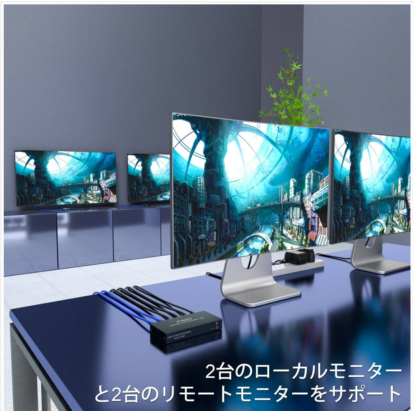
Image: An example setup showing multiple displays connected to the PWAY HDMI Extender Splitter, demonstrating its capability to distribute video to several screens.