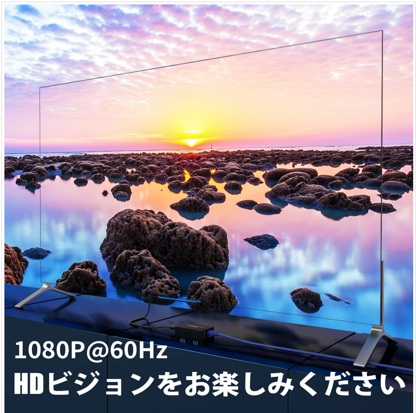
Image: A display showing a high-definition image, illustrating the 1080P@60Hz capability of the PWAY HDMI Extender Splitter.