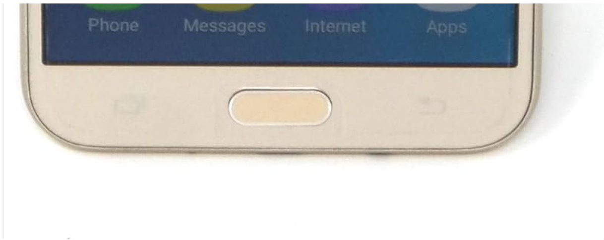
Figure 3: The Samsung Galaxy J7 Prime's home screen, showing various app icons like Phone, Messages, Internet, Camera, and Google search bar.