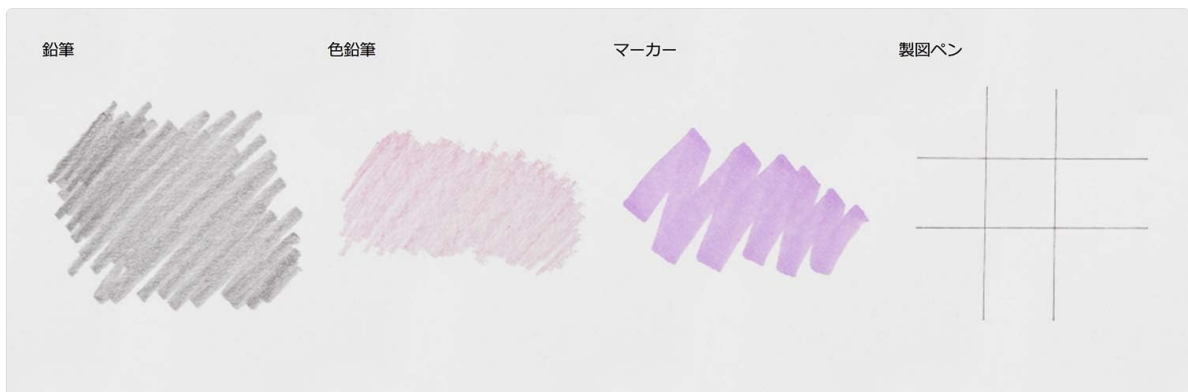
Figure 2: Demonstrations of various art media on Muse Kent paper. Swatches show applications of pencil, colored pencil, marker, and technical pen, highlighting the paper's versatility.