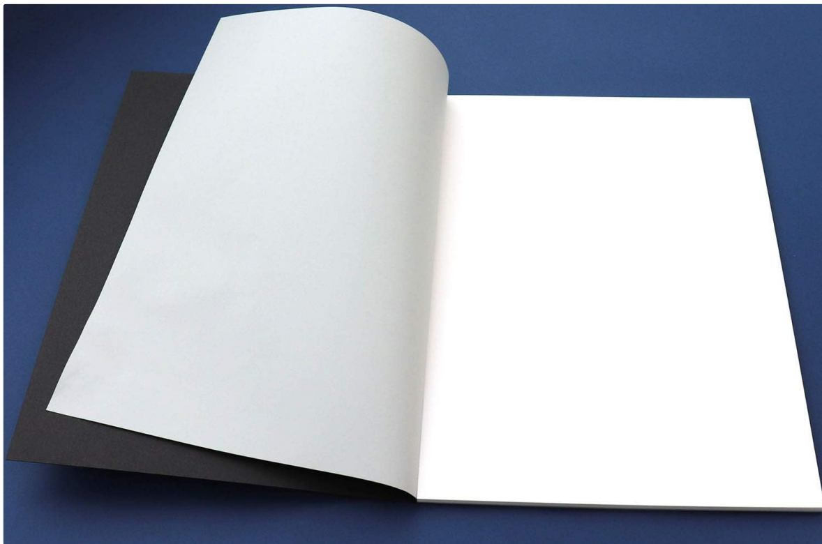
Figure 1: Muse Kent Block A4 Large #200 paper block. The block is shown open, revealing multiple blank sheets of paper ready for use. The binding is on the left side.

The Muse Kent Block A4 Large #200 (Model KL-6744) is a premium drawing paper block designed for artists. It features 15 sheets of high-quality Kent paper, ideal for a variety of dry and wet media. The paper's smooth, uncoated finish provides an excellent surface for detailed work and vibrant color application.