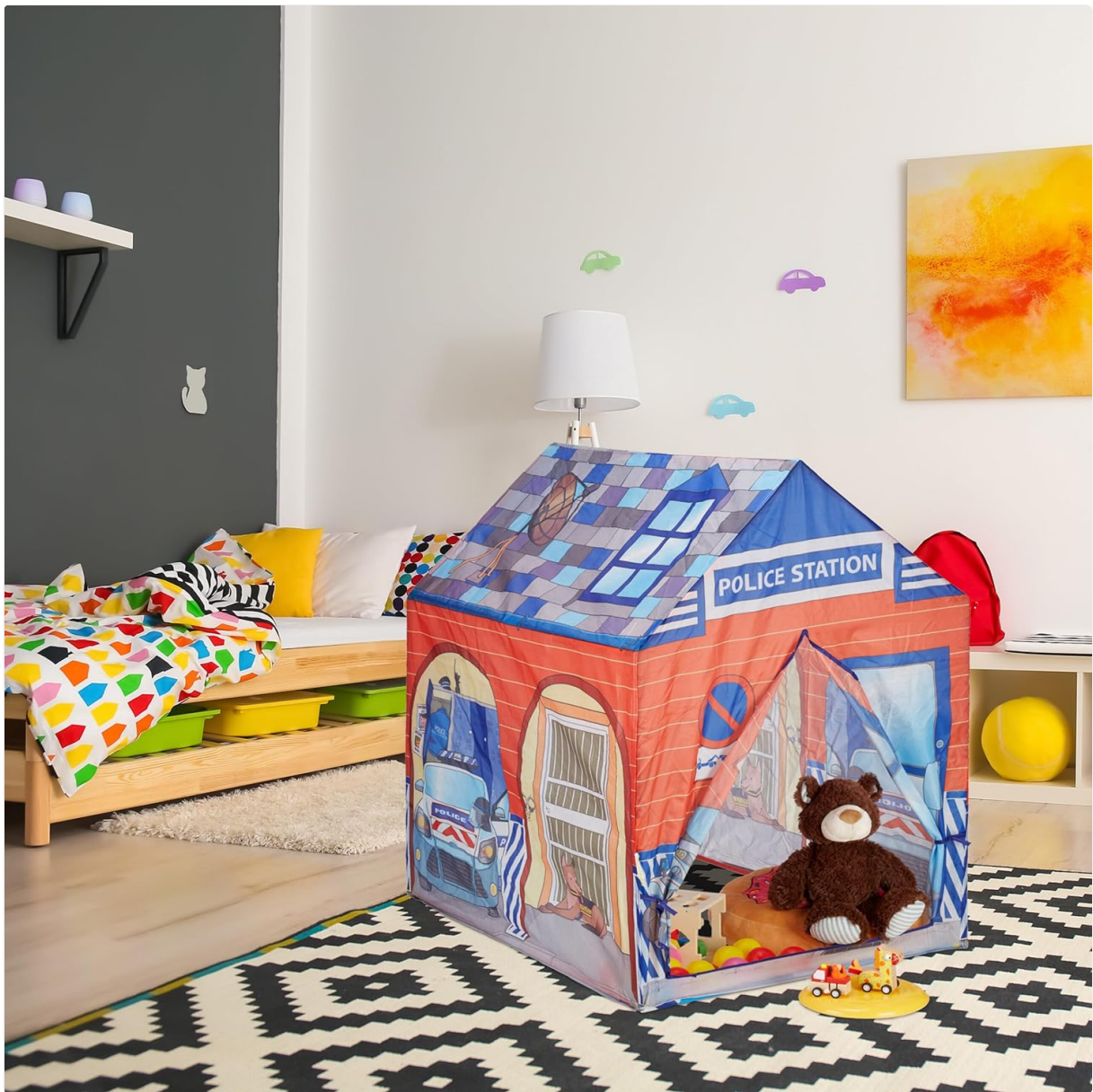
Image: The Police Station Play Tent positioned in a child's bedroom, demonstrating its suitability for indoor play environments.