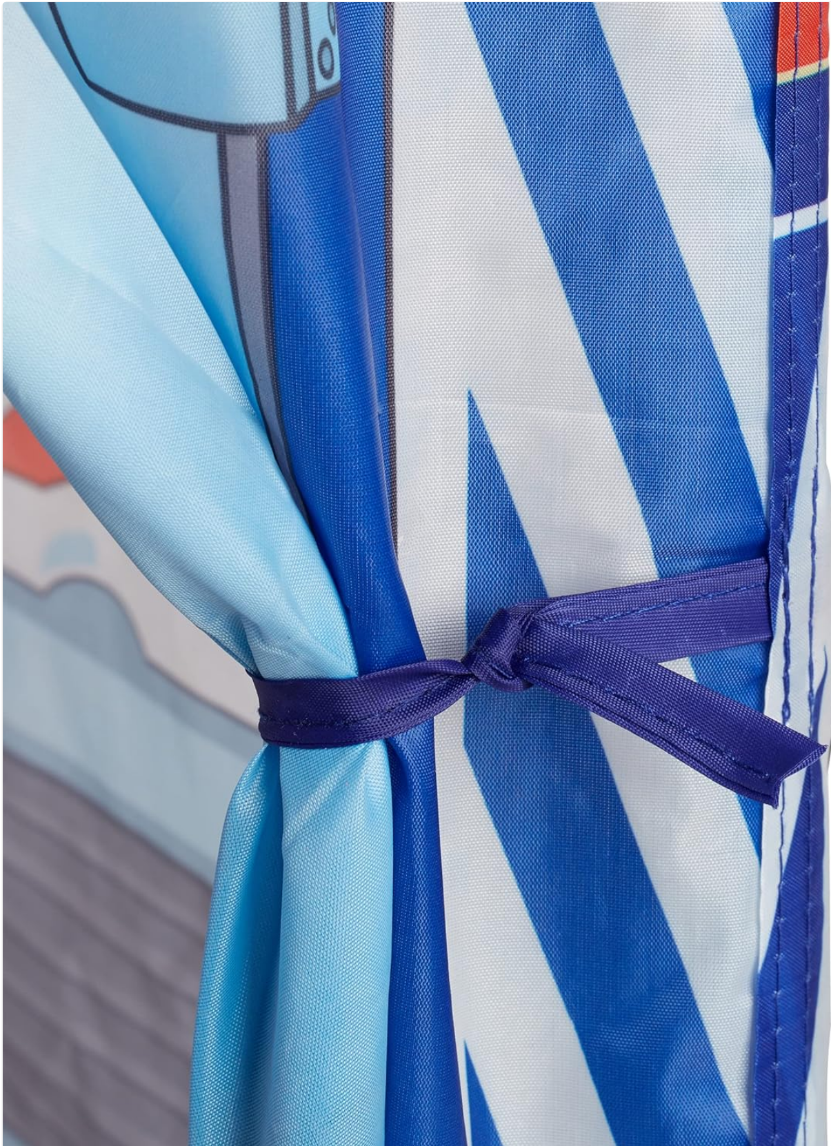
Image: A close-up view of the blue ribbon tie-back, used to secure the tent's entrance flap in an open position.