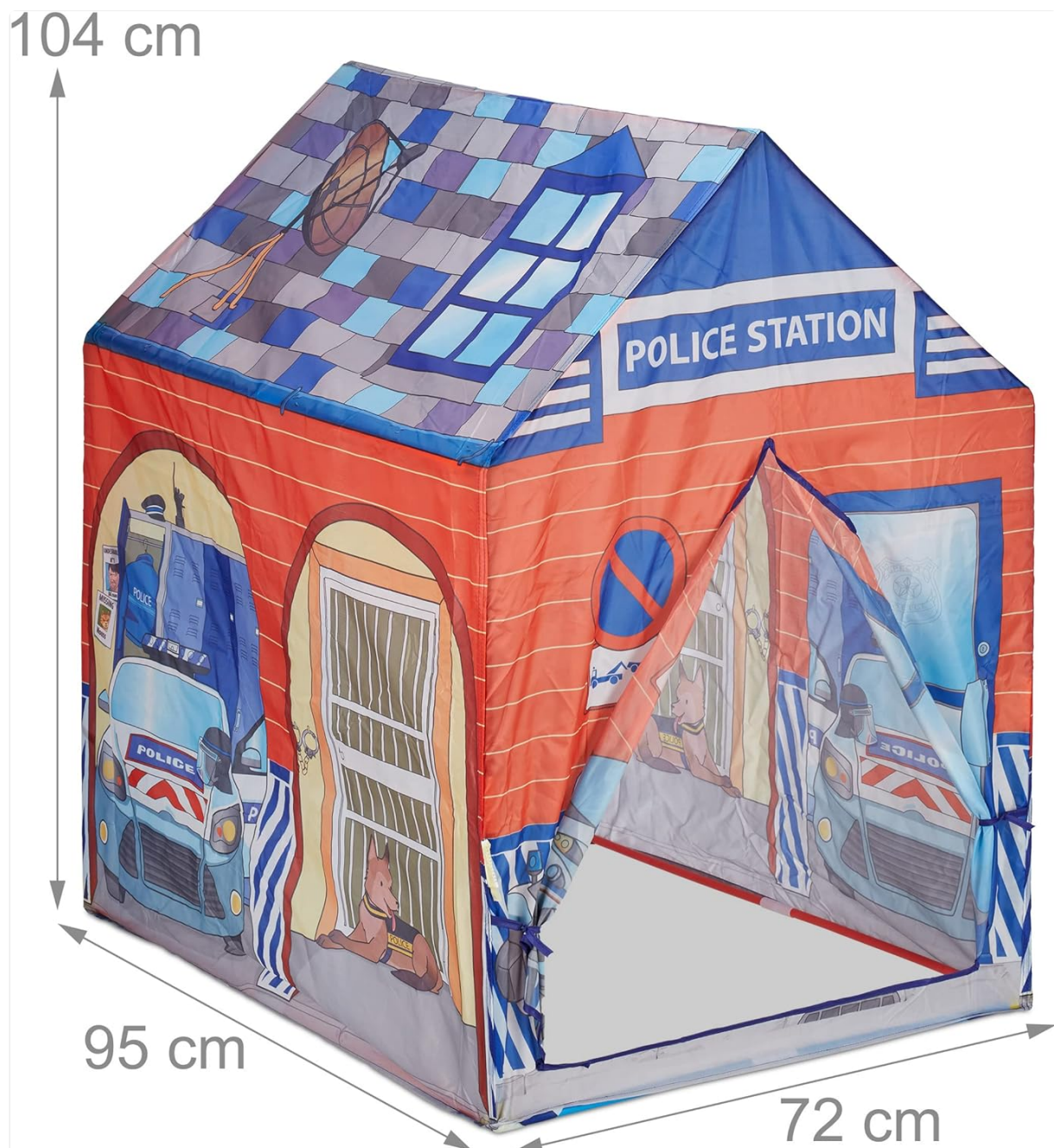
Image: The Police Station Play Tent with its key dimensions (height, width, depth) clearly indicated for reference.