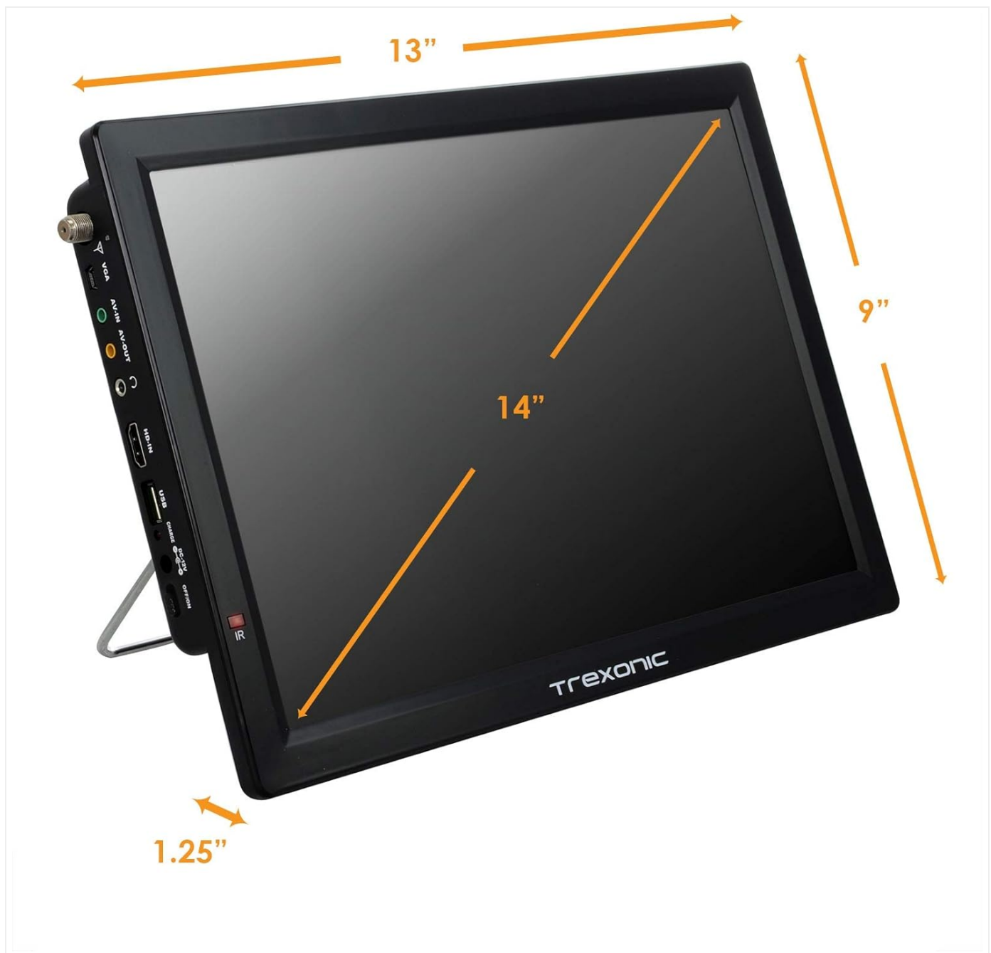
Figure 5: Product dimensions: 13 inches width, 9 inches height, 1.25 inches depth, with a 14-inch diagonal screen size.