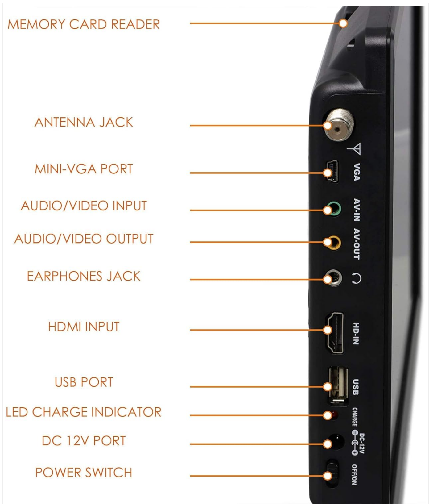
Figure 2: Side panel connections including Antenna Jack, Mini-VGA Port, Audio/Video Input/Output, Earphones Jack, HDMI Input, USB Port, LED Charge Indicator, DC 12V Port, and Power Switch.