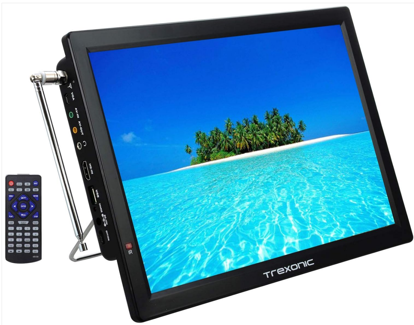
Figure 1: Front view of the Trexonic Portable LED TV with included remote control.