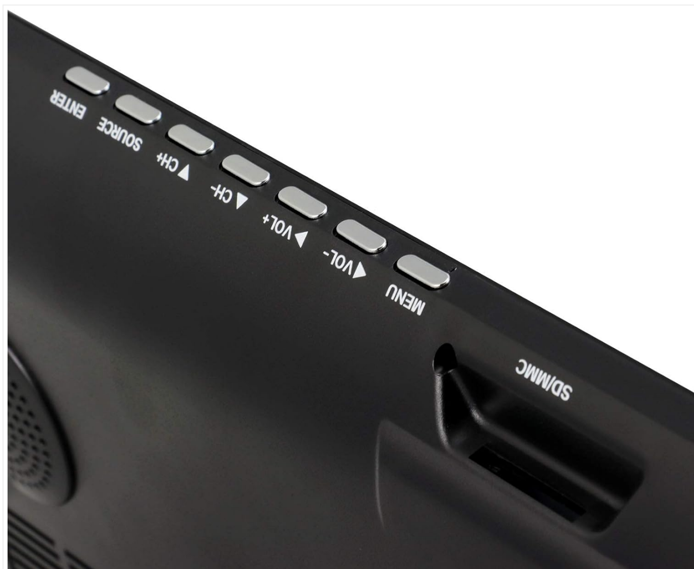
Figure 3: Top panel control buttons including SD/MMC card slot, Menu, Volume, Channel, Source, and Enter.