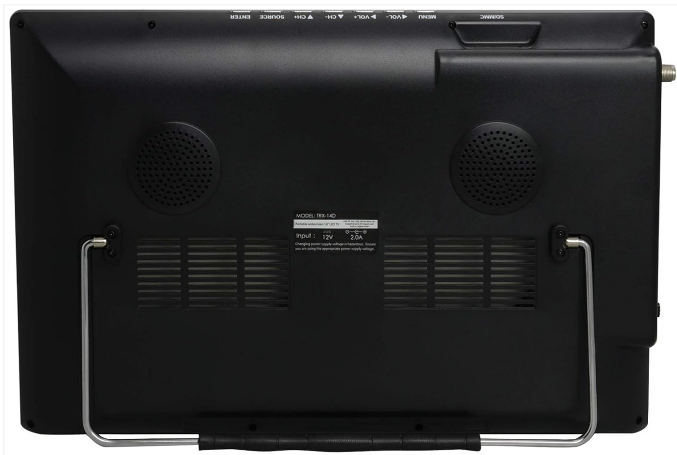
Figure 4: Rear view of the Trexonic Portable LED TV, highlighting the built-in speakers and adjustable stand.