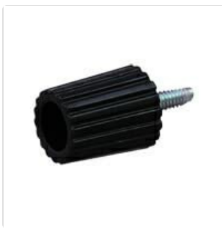
Figure 3.1: The Rinnai 501-877-000 Cosmetic Screw. This image shows the black, knurled head of the screw with the threaded shaft extending from one end.