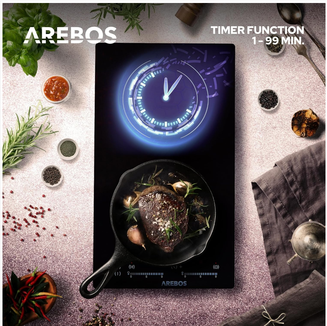
Image 5.2: Visual representation of the hob's timer function, which can be set for up to 99 minutes.