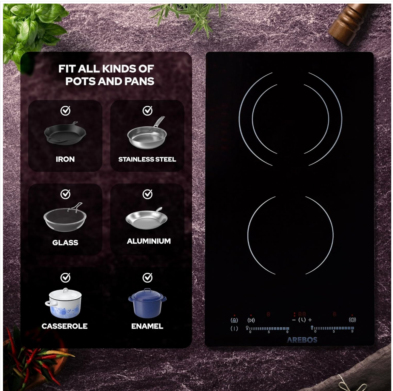
Image 5.3: Examples of cookware materials compatible with the ceramic hob.