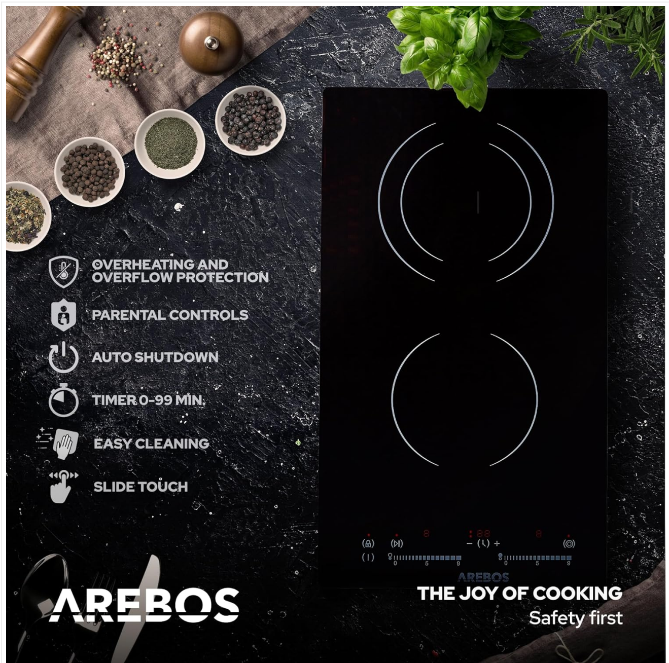
Image 3.1: Overview of the hob's key features, including safety and convenience functions.