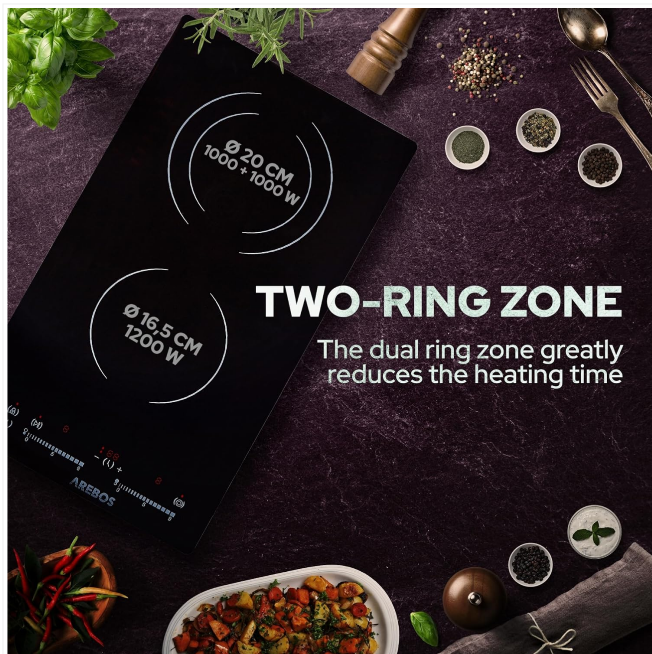
Image 3.2: Detailed view of the two cooking zones, highlighting their sizes and power capabilities.