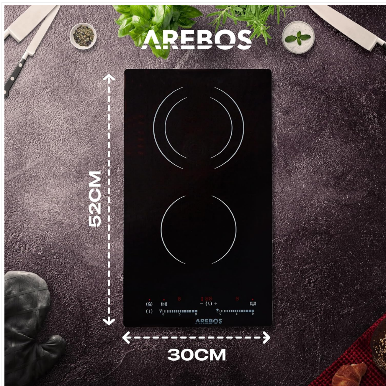
Image 4.1: Diagram showing the approximate dimensions of the ceramic hob for installation planning.