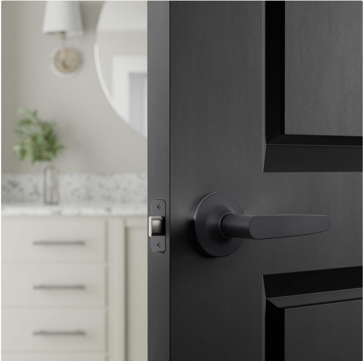
Image 3.2: The Amazon Basics Straight Door Lever fully installed on a door, demonstrating its appearance and fit.