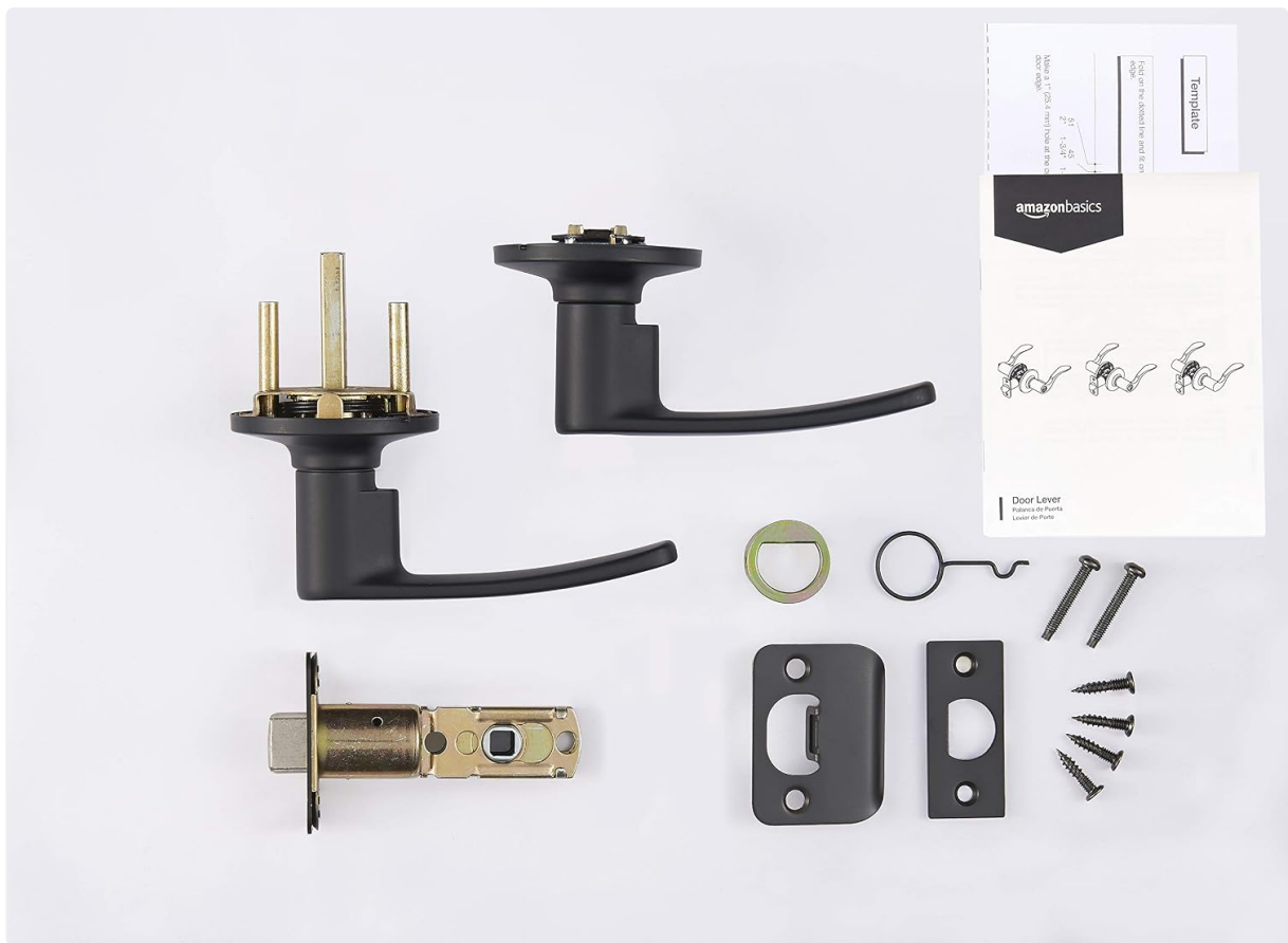
Image 2.1: All components included in the Amazon Basics Straight Door Lever package. This includes the interior and exterior levers, latch mechanism, strike plate, mounting screws, and installation template.