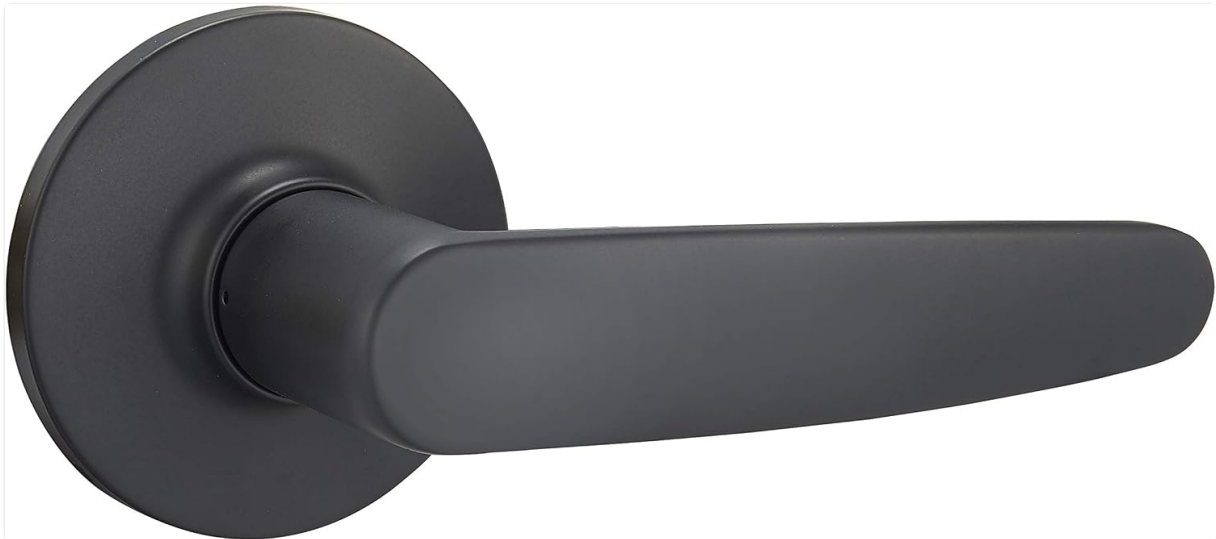
Image 1.1: The Amazon Basics Straight Door Lever, showcasing its matte black finish and modern design.

The Amazon Basics Straight Door Lever is designed for passage doors, offering a sleek matte black finish and reliable functionality. This lever is ideal for hallways, closets, and other rooms where a locking mechanism is not required. It features a reversible design for both right-handed and left-handed doors and is built for easy installation.