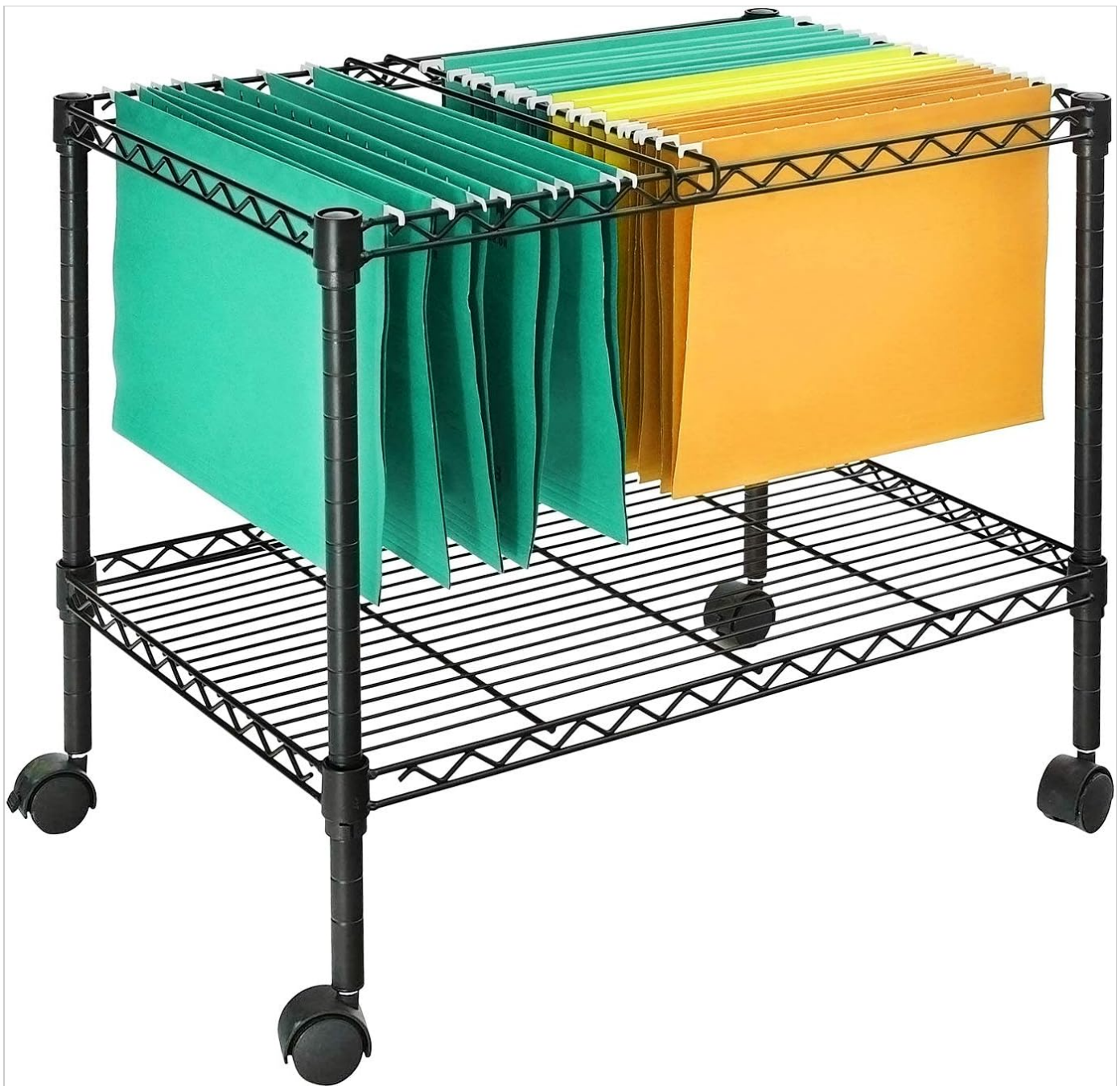
Figure 3: The SortWise Wire Shelf Rack fully loaded with hanging file folders, illustrating its primary function as a file cart.