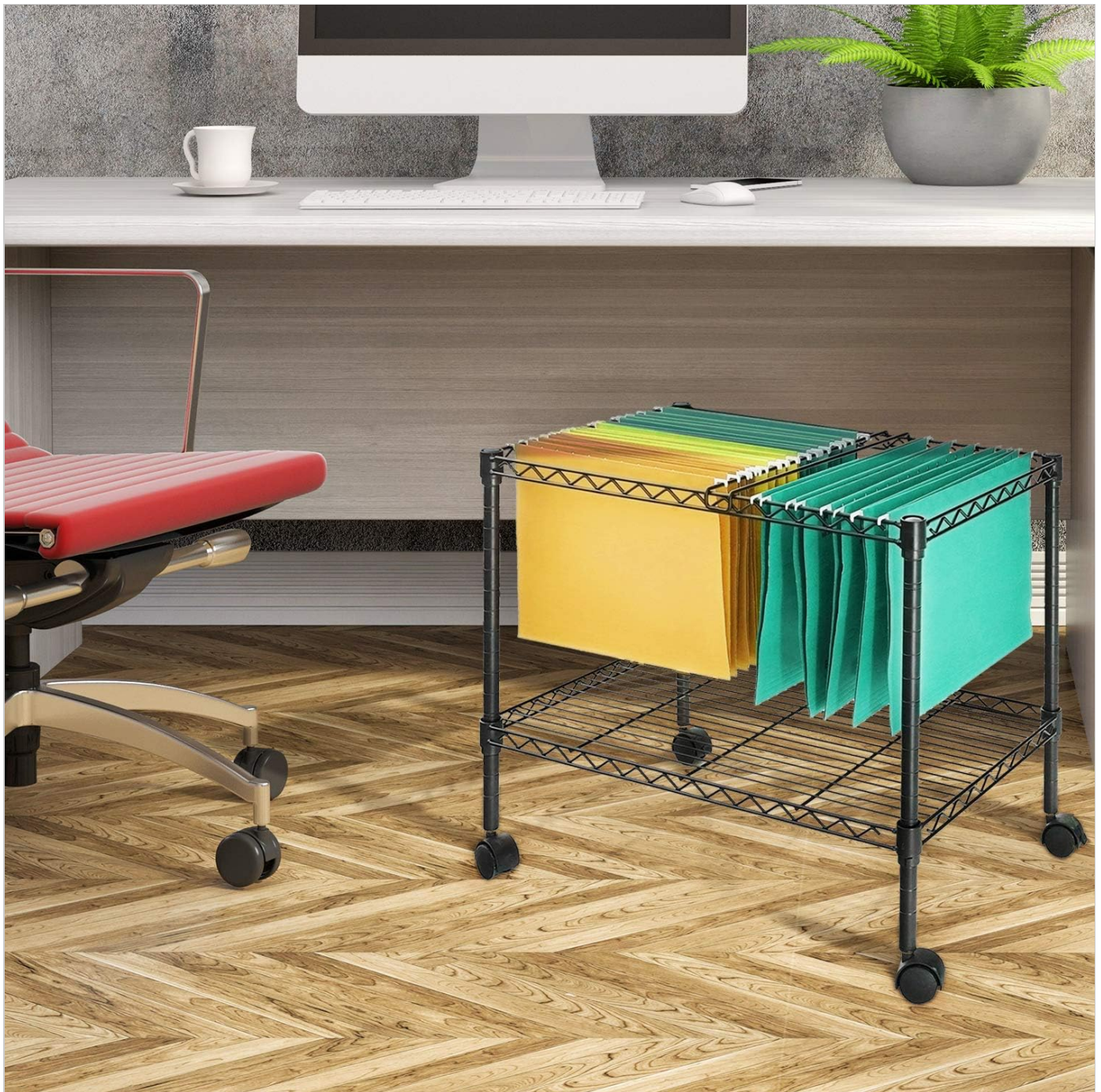
Figure 2: The SortWise Wire Shelf Rack positioned under an office desk, demonstrating its compact size and utility for storing hanging files.