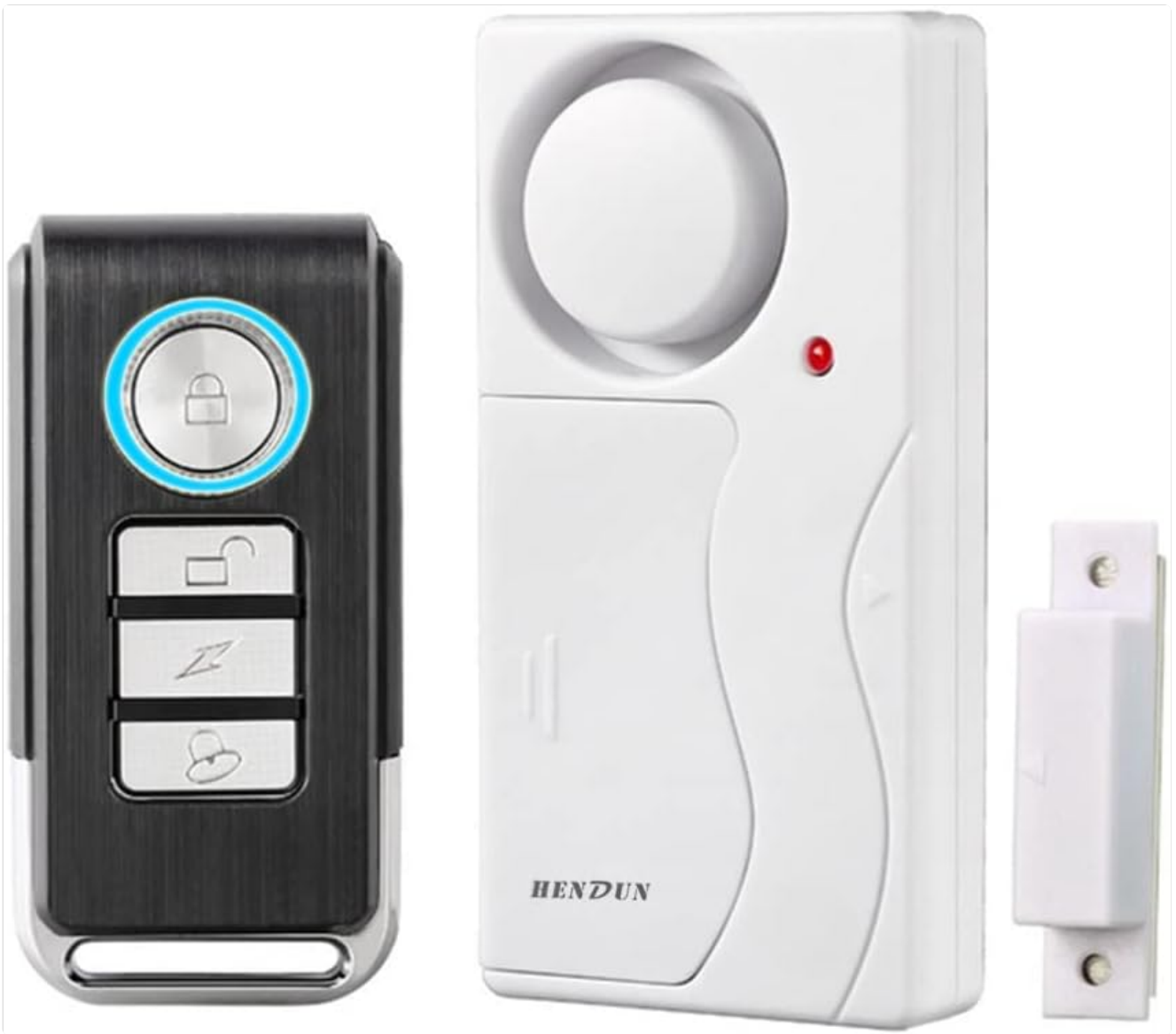
Figure 3.1: Main components of the HENDUN Wireless Remote Door Alarm system.