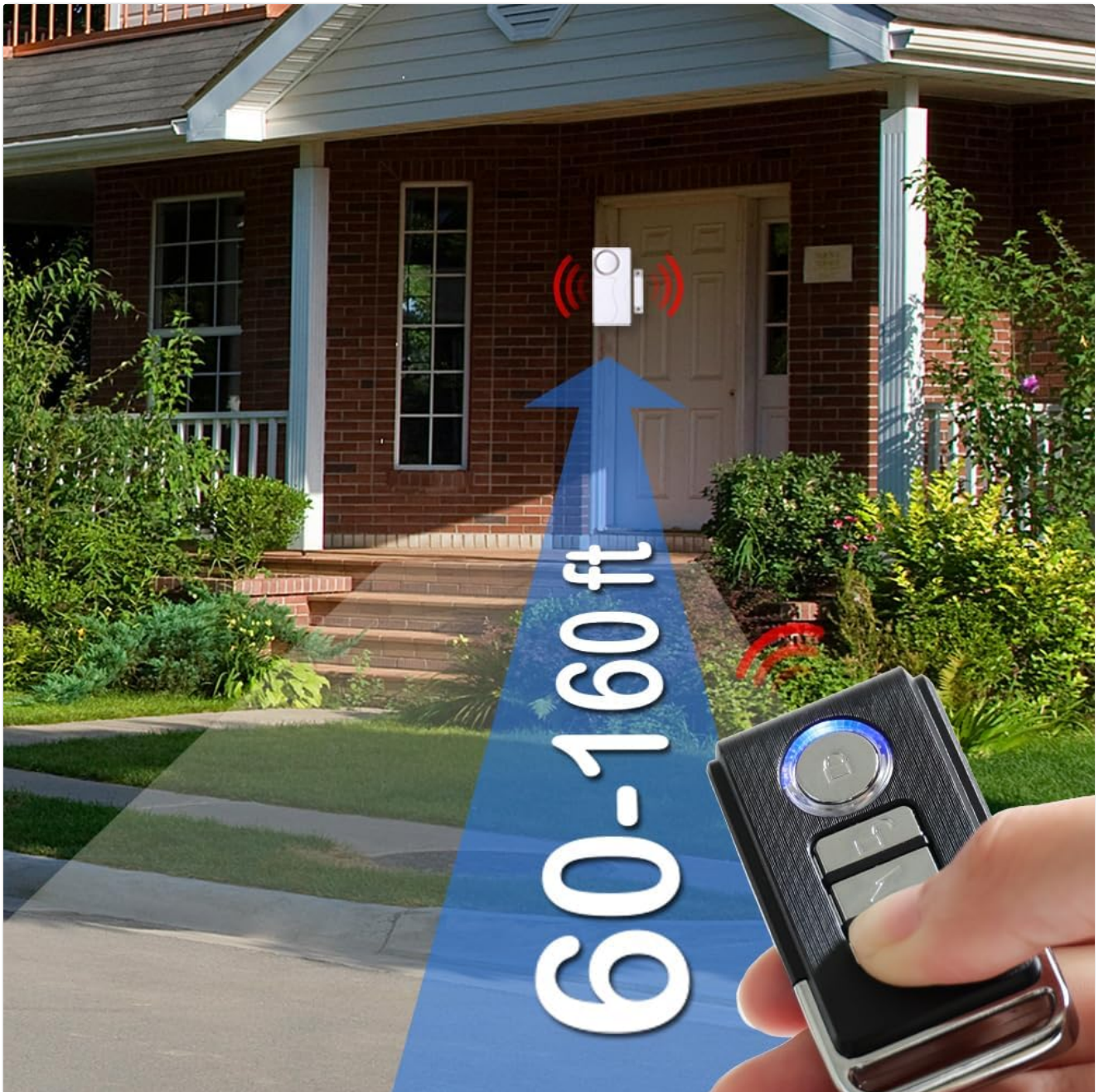
Figure 5.1: Remote control operating range (60-160 feet).

The HENDUN alarm system offers three main modes: Alarm, Chime, and Disarmed (Off).