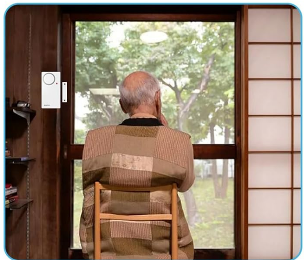
Figure 4.2: Applicable scenarios for the HENDUN alarm system.