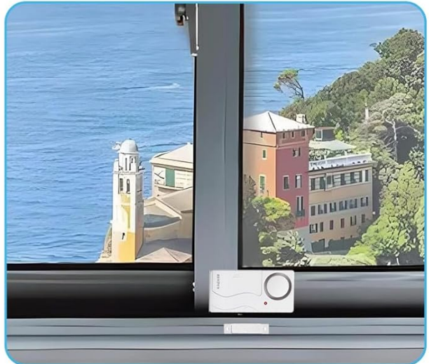
Figure 4.1: Various installation locations for the alarm system.