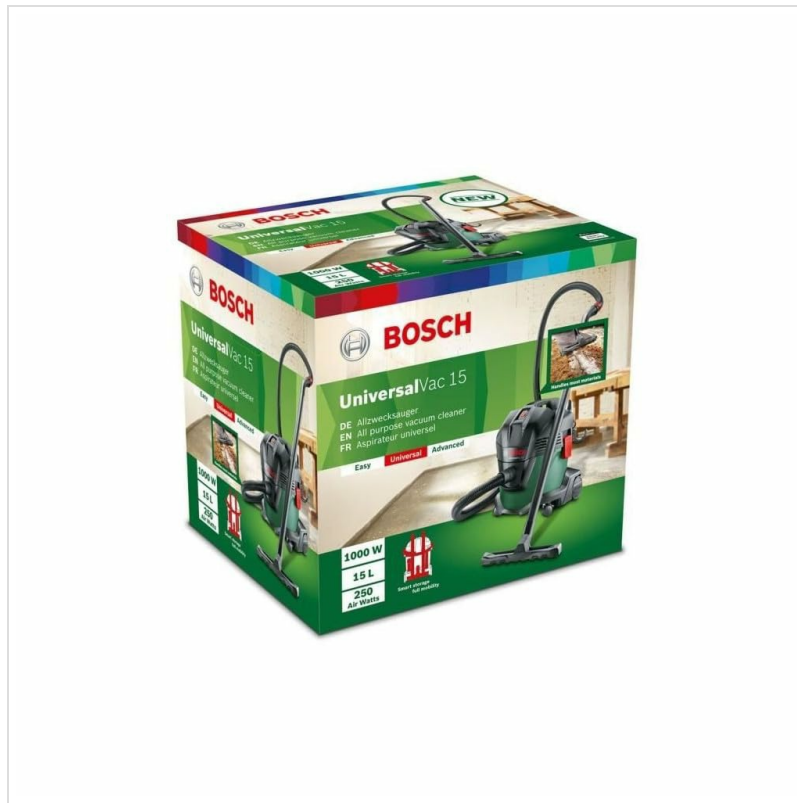
Image: The retail packaging box for the Bosch UniversalVac 15, displaying product features and branding.