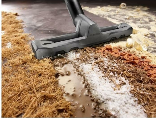
Image: The floor nozzle of the Bosch UniversalVac 15 cleaning a mixture of wet and dry debris on a hard surface, highlighting its versatility.