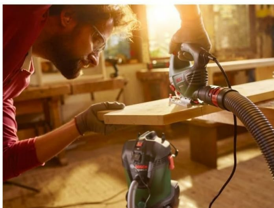
Image: The Bosch UniversalVac 15 connected via its universal adapter to a Bosch power tool, demonstrating its use for dust extraction during woodworking.