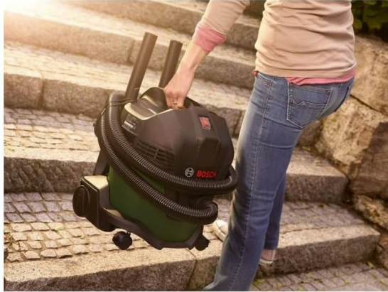
Image: A person carrying the Bosch UniversalVac 15 by its integrated handle, demonstrating its portability.