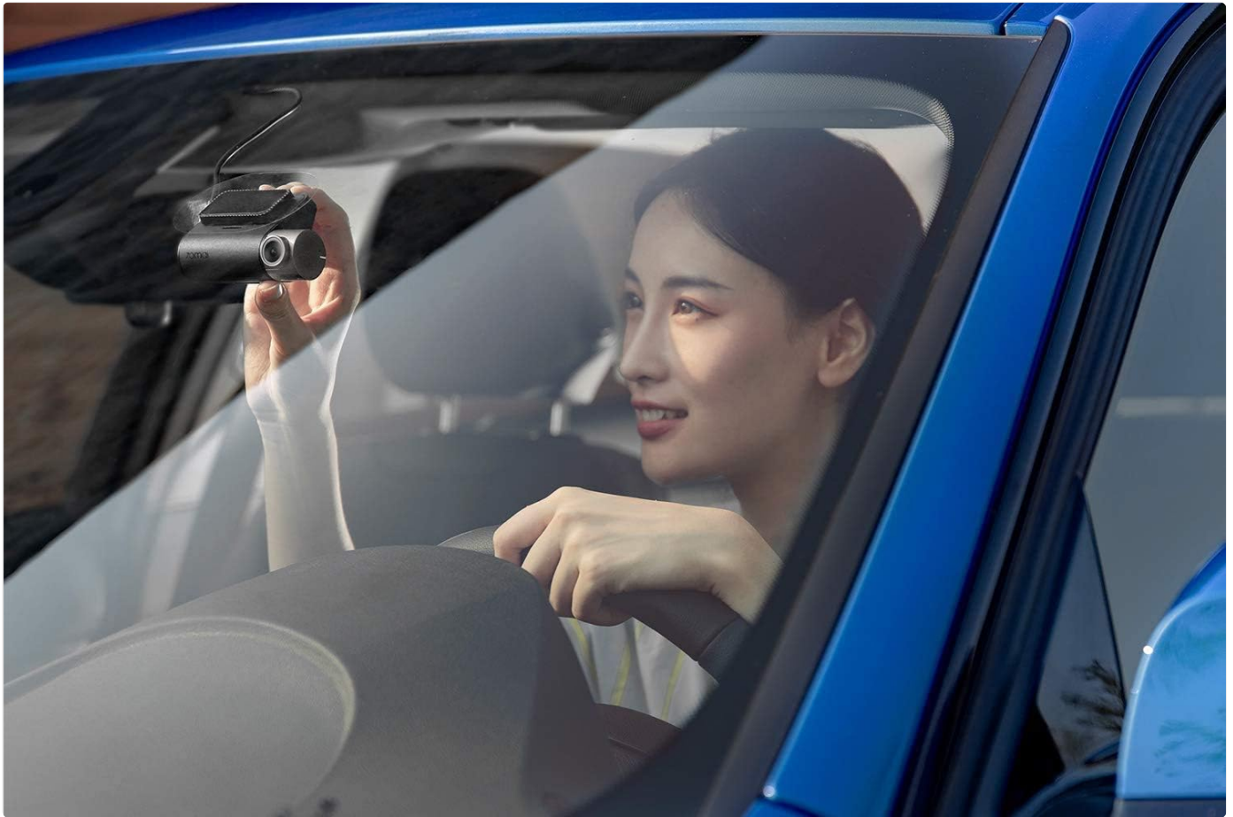
Image: A person carefully positioning the 70mai dash camera on the car's windshield, ensuring a clear view.

view of the road and does not obstruct your driving vision.