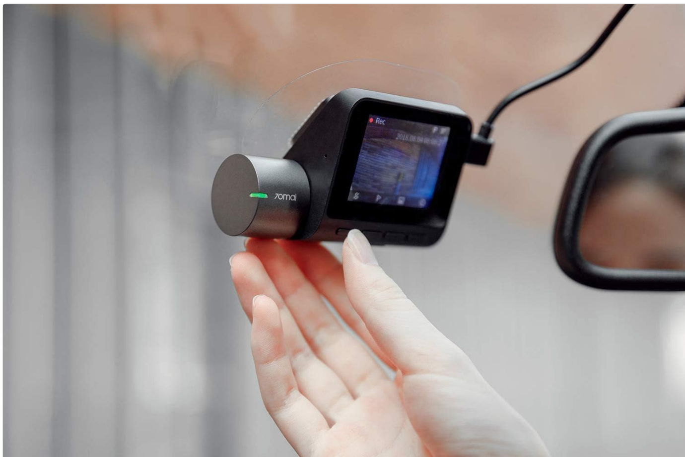
Image: A hand making final adjustments to the angle of the 70mai dash camera after it has been mounted on the windshield.