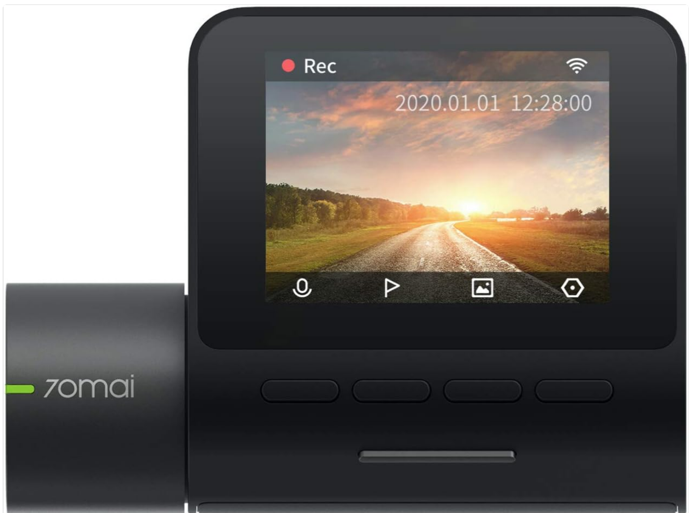
Image: The 70mai dash camera displaying its live recording view on the screen, showing a road scene.