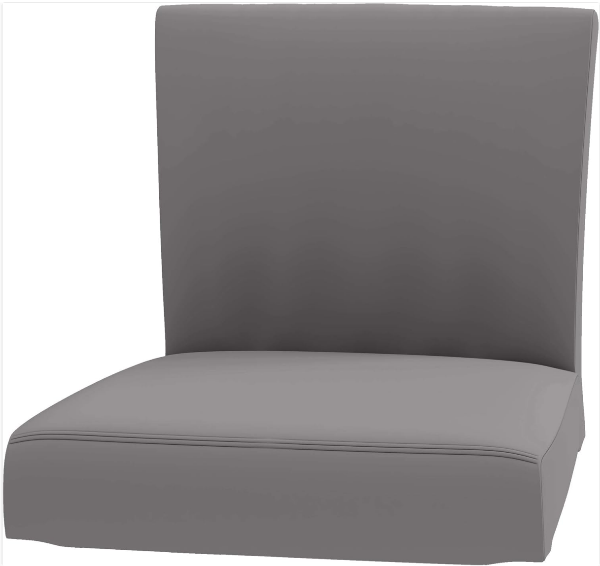
Image: The Henriksdal Bar Stool Cover Replacement in Lighter Gray, shown folded.