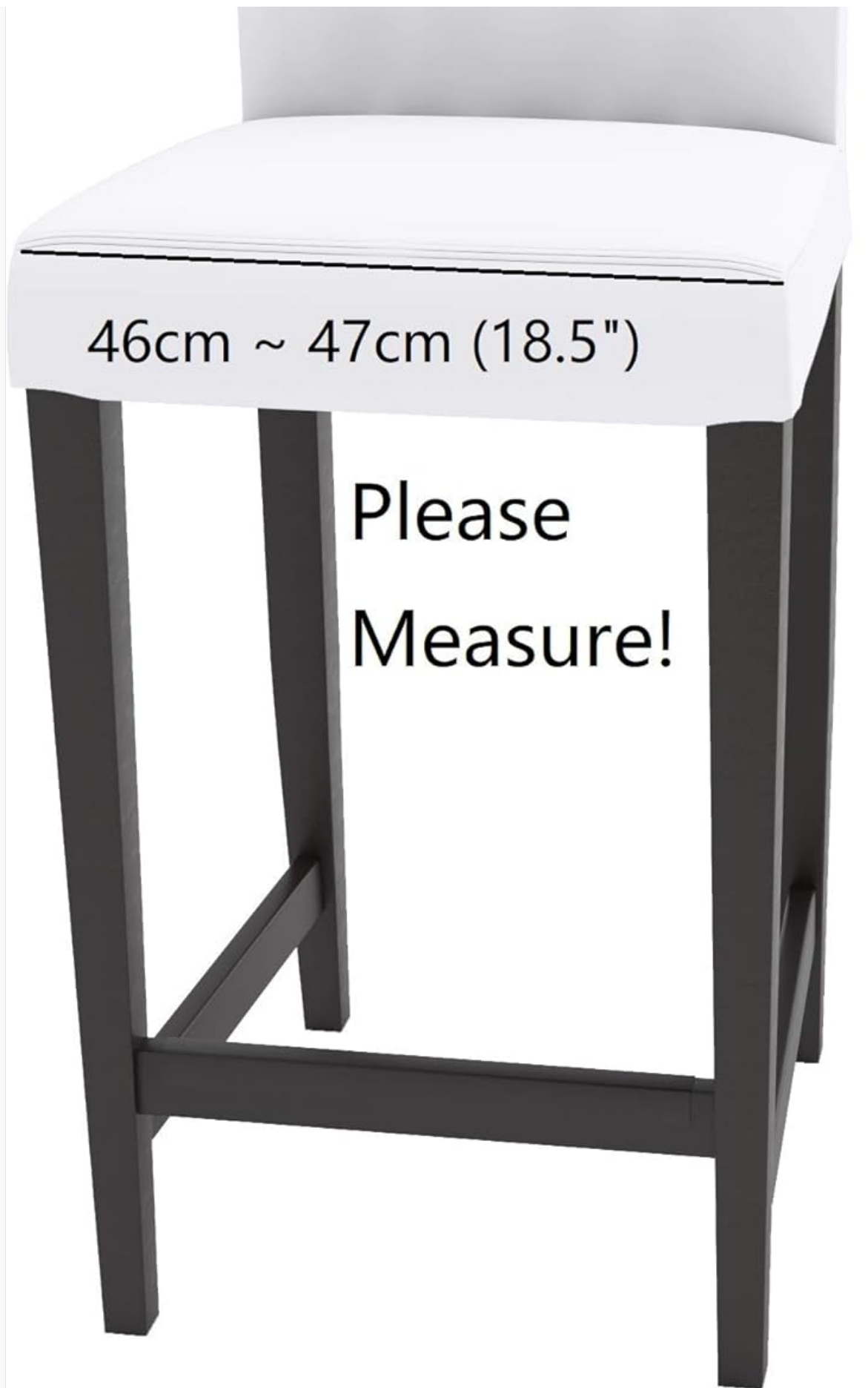
Image: A Henriksdal bar stool with a measurement overlay indicating a seat width of 46cm to 47cm (18.5 inches). Please measure your stool to ensure compatibility.