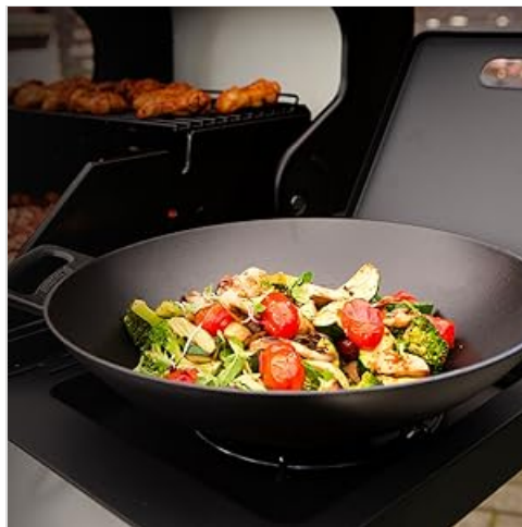
Image: A wok accessory in use, filled with stir-fried ingredients, demonstrating its versatility.