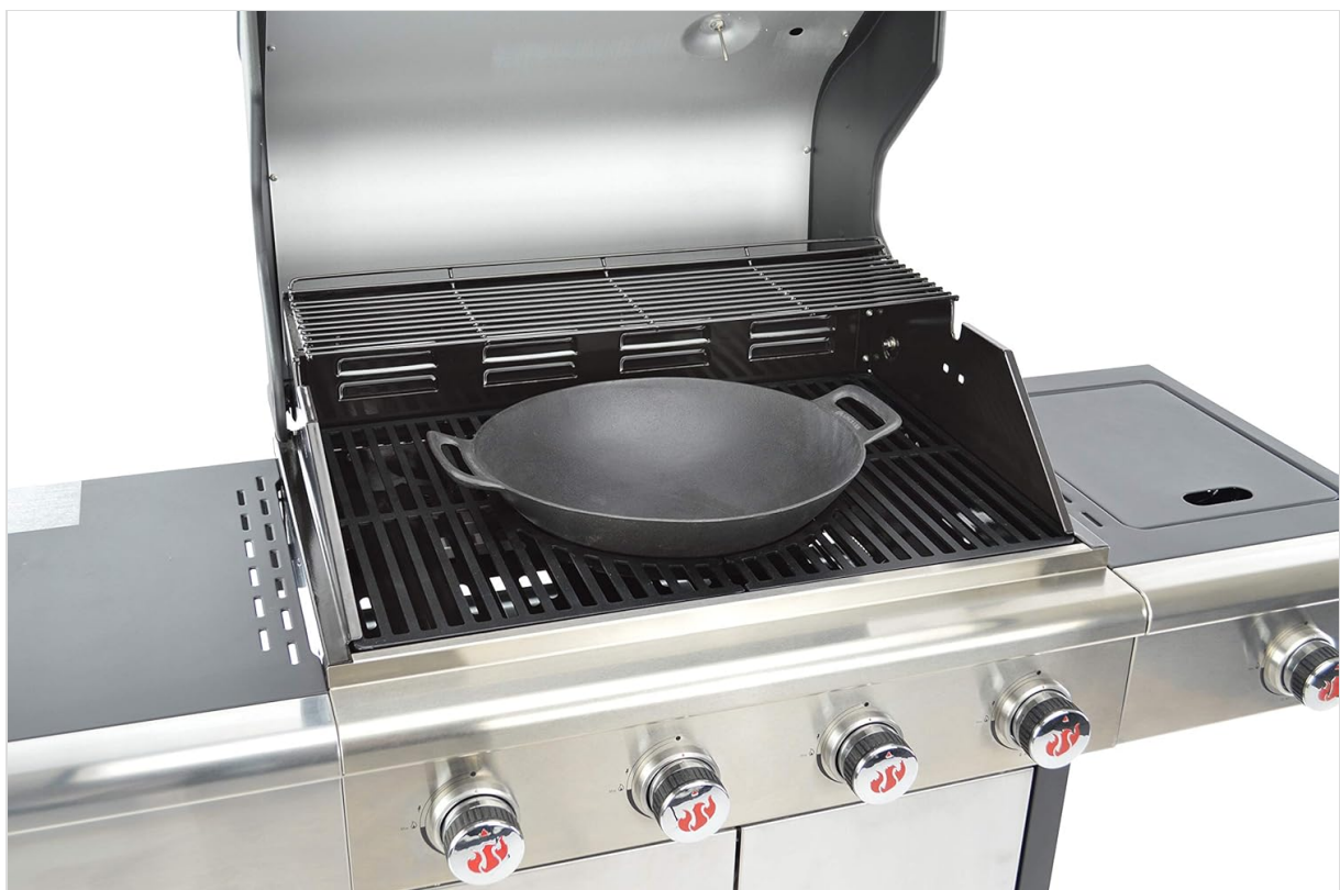
Image: A wok accessory correctly placed within the central opening of the Modulus grill system.