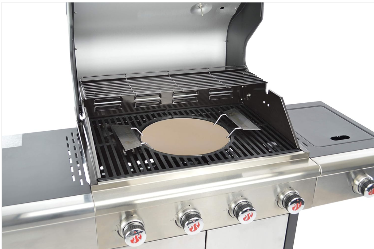
Image: A pizza stone accessory correctly placed within the central opening of the Modulus grill system.