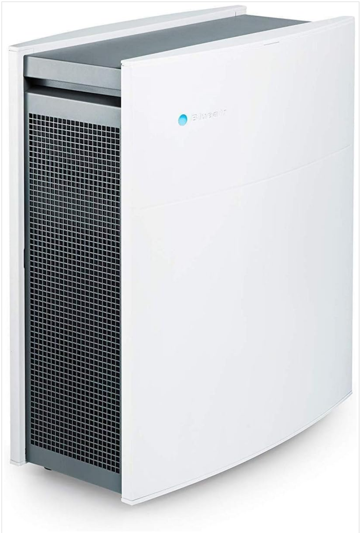
Figure 1: Front view of the Blueair Classic 480i Air Purifier. The unit is white with a blue indicator light and a dark gray top panel.