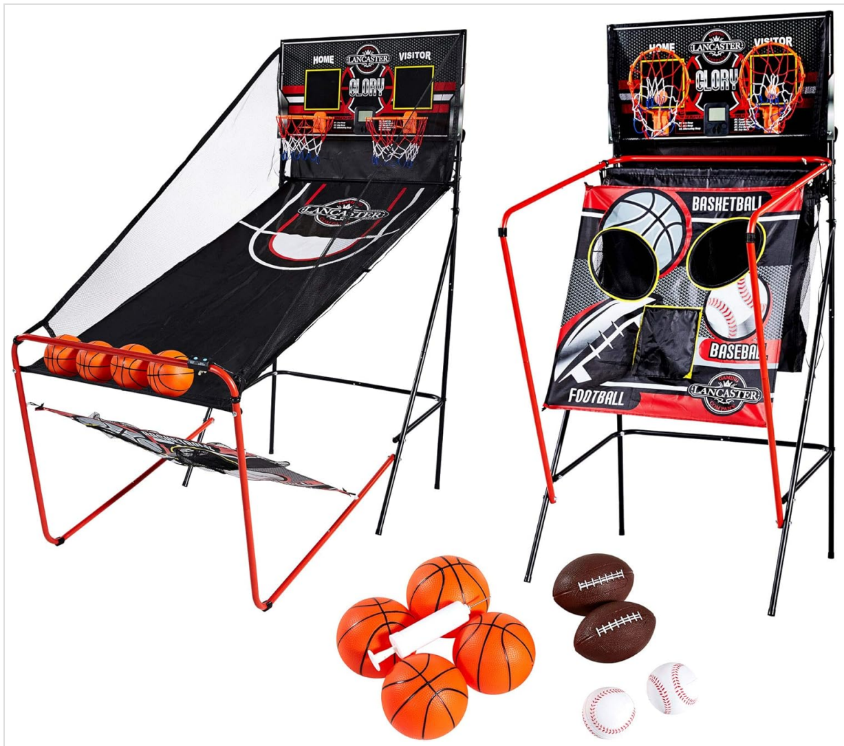
Figure 1: The Lancaster 2 Player Electronic Arcade 3-in-1 Game in both basketball and football/baseball configurations.