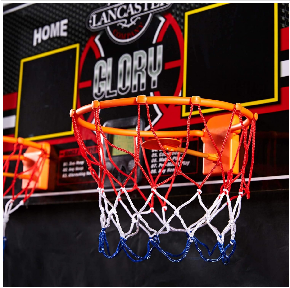
Figure 4: Detail of the electronic scorekeeper.

The integrated LED scorekeeper tracks scores and time. It typically requires 3x AA batteries (not included).