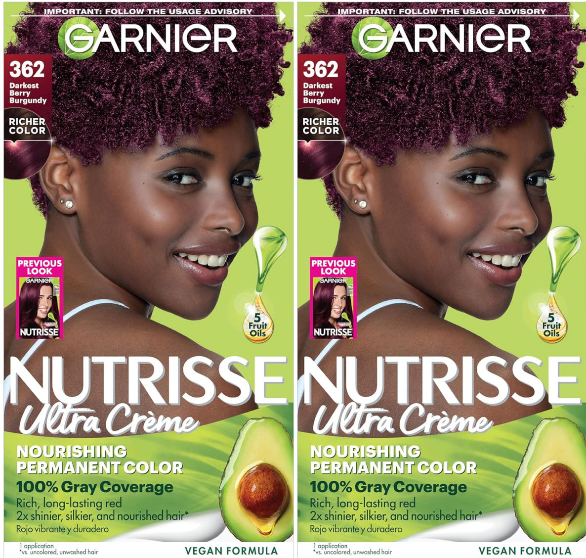
Image 1.1: Front packaging of Garnier Nutrisse Nourishing Creme Permanent Hair Color, shade 362 Darkest Berry Burgundy.