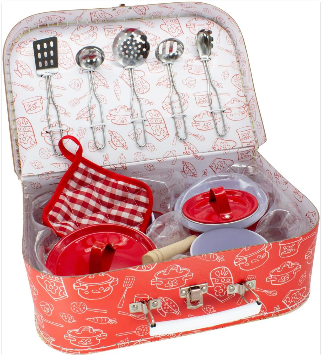
Figure 2: The GICO 12-Piece Children's Kitchen Cookware Set neatly stored within its red cardboard suitcase, demonstrating its portability and ease of storage.