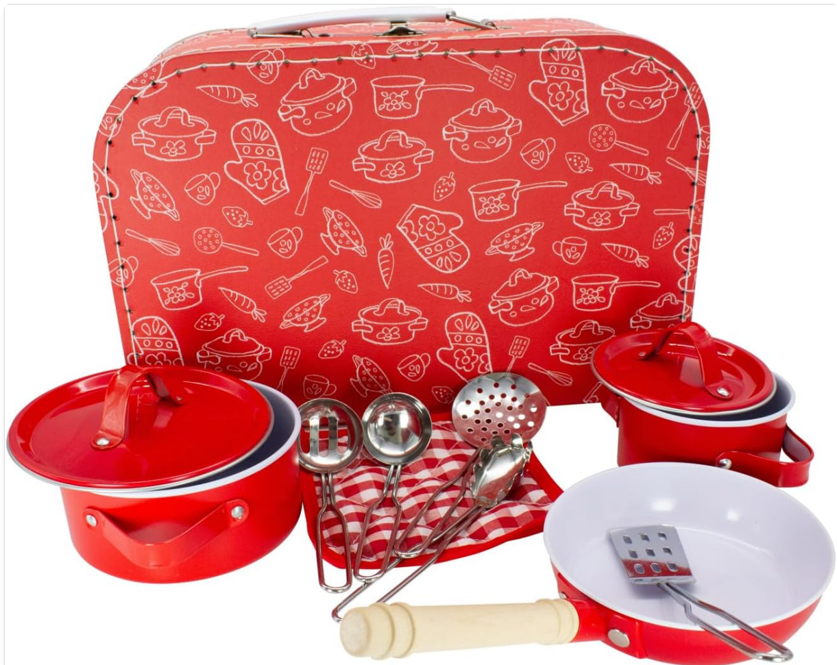
Figure 1: The GICO 12-Piece Children's Kitchen Cookware Set, including pots, pan, pot holders, and metal cutlery, displayed outside its red cardboard suitcase.

The GICO 12-Piece Children's Kitchen Cookware Set is a comprehensive play set designed to inspire imaginative role-playing for young chefs. Contained within a durable red cardboard suitcase, this set includes a variety of metal cookware and utensils, providing a realistic and engaging play experience. It is not only a fun toy but also a valuable educational tool that fosters creativity and imagination.