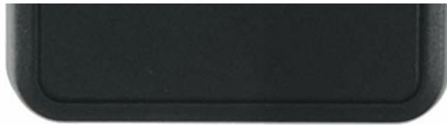
Image 1: Front view of the VINABTY CT-8069 replacement remote control, showing all buttons and its ergonomic design.

This remote is compatible with a wide range of Toshiba Smart Full HD LED TV models, including but not limited to: 32L3753DB, 43L3653DB, 43U6763DB, 49U6663DB, 49U6763DB, 55U6663DB, 55L3753DB, 43L3753DB, 32D3753DB, 32W3753DB, 65U6663DB, 55U5766DB, 24D3753DB, 32D3653DB, 32W3753DG, 43U5766DB, 43U6663DB, 43V6763DB, 49L3653DB, 49L3658DB, 49L3753DB, 49U5663DB, 49U5766DB, 49U6663DB, 49U6763DB, 49U7763DB, 49V6763DB, 55L3763DG, 55U6763DB, 55U7763DB, 65U6763DB, 75U6763DB.