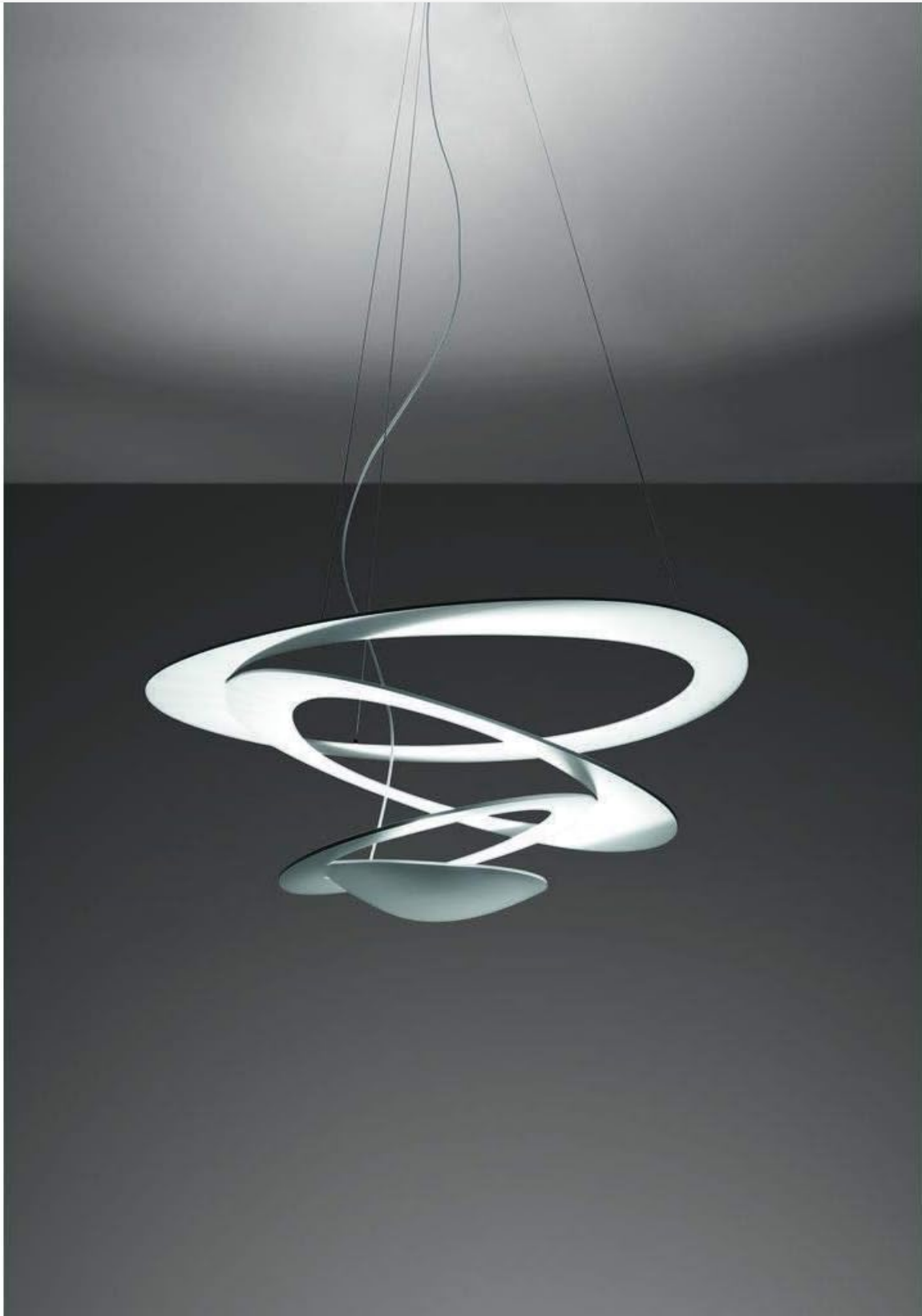
Figure 1: The Artemide Pirce LED Suspension Lamp in its standard white finish, showcasing its unique, sculptural design with concentric rings.