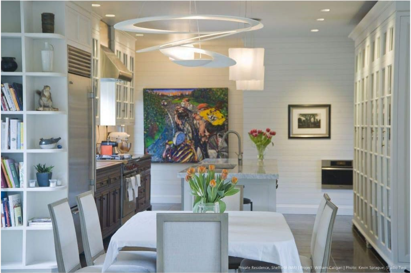
Figure 4: The Pirce lamp elegantly suspended above a dining table in a contemporary kitchen setting, illustrating its versatility in various home environments.

Artemide Official Website: www.artemide.com (Please note: This is a placeholder URL as no specific support link was provided.)