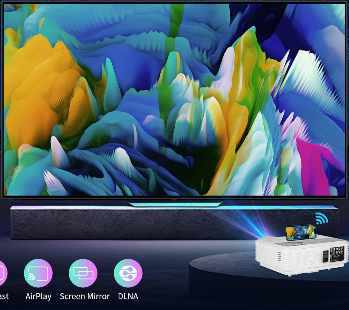
Figure 6: Effortlessly Share Your Screen

With wifi mirroring, you can easily and quickly share your screen on a larger display without cables or complicated setups.