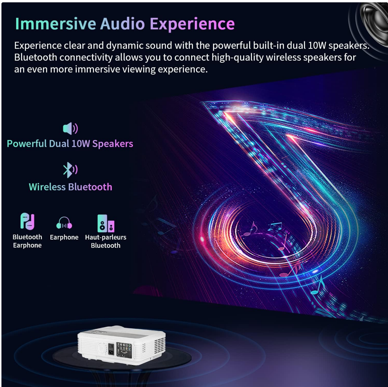
Figure 3: Immersive Audio Experience with Bluetooth Connectivity

This image highlights the projector's dual 10W built-in speakers and its wireless Bluetooth connectivity, allowing users to connect external Bluetooth speakers or headphones for an enhanced audio experience. The visual depicts sound waves emanating from the projector and connecting to external audio devices.