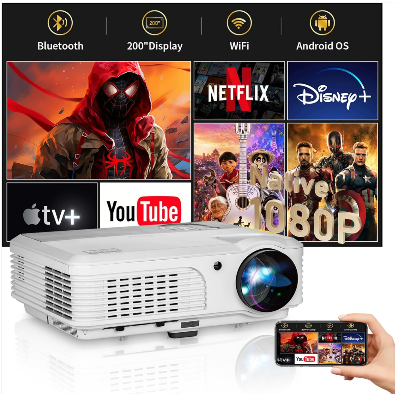
Figure 1: EUG Native 1080P Full HD Projector (Model SP-05)

The image displays the EUG Native 1080P Full HD Projector, a white rectangular device with a prominent lens on the front. Icons above it indicate Bluetooth, 200" Display, WiFi, and Android OS capabilities. Various streaming service logos (Netflix, Disney+, Apple TV+, YouTube) are shown projected, along with a smartphone mirroring its screen to the projector.