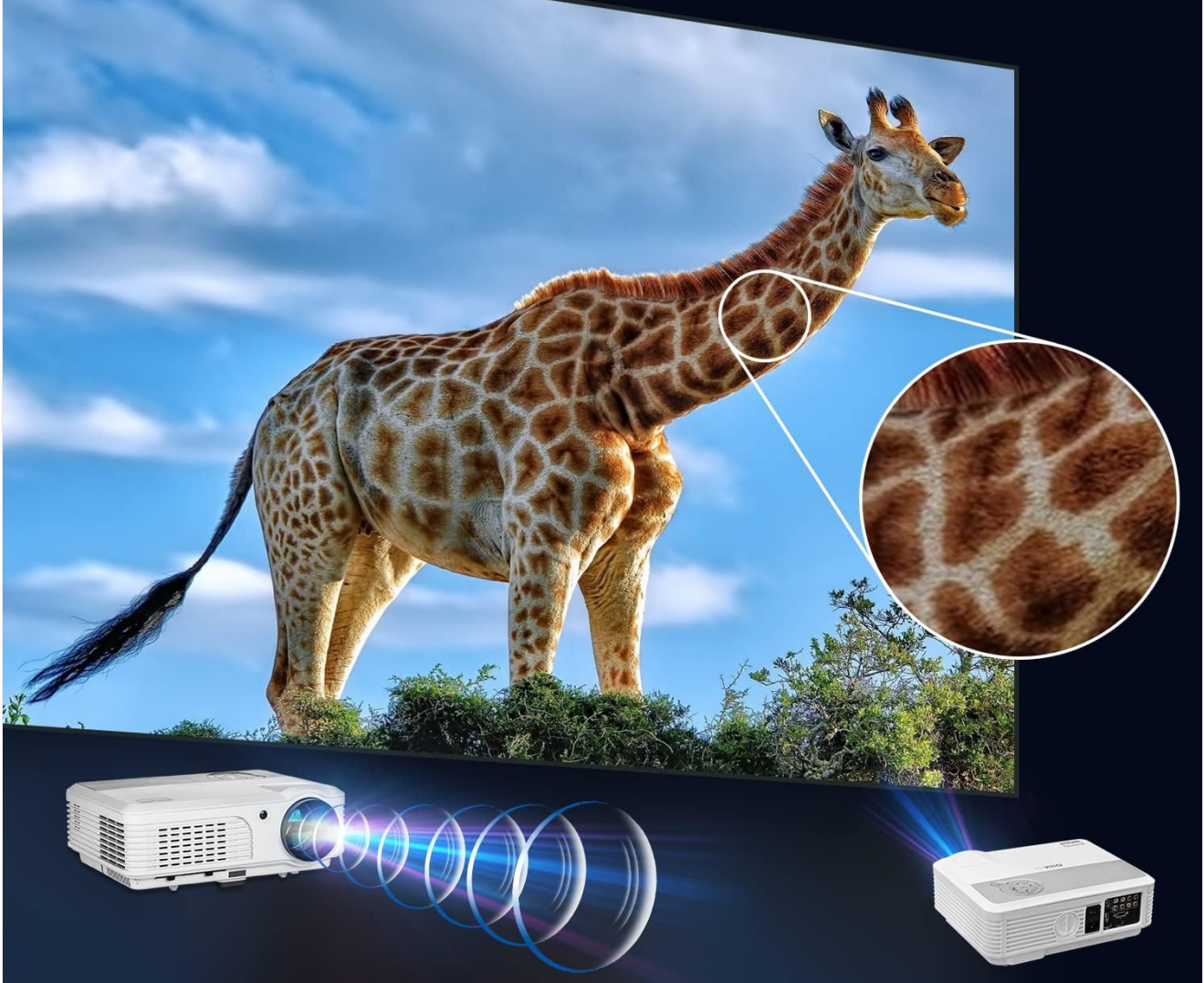
Figure 7: Every Detail Comes to Life

Adopt the State-of-the-Art lens technology, even the edges of 120" screen are razor sharp, transporting you to a whole new level of immersive entertainment.