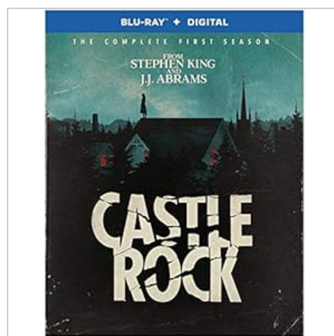
Image: A promotional image related to Castle Rock, possibly a logo or key art.