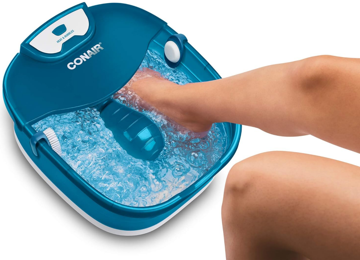
Image: A person's feet are submerged in the blue foot spa, which is filled with bubbling water, illustrating the comfort and invigorating experience.