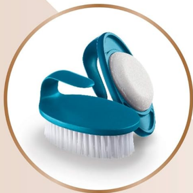
BONUS Pumice & Nail Brush Accessories