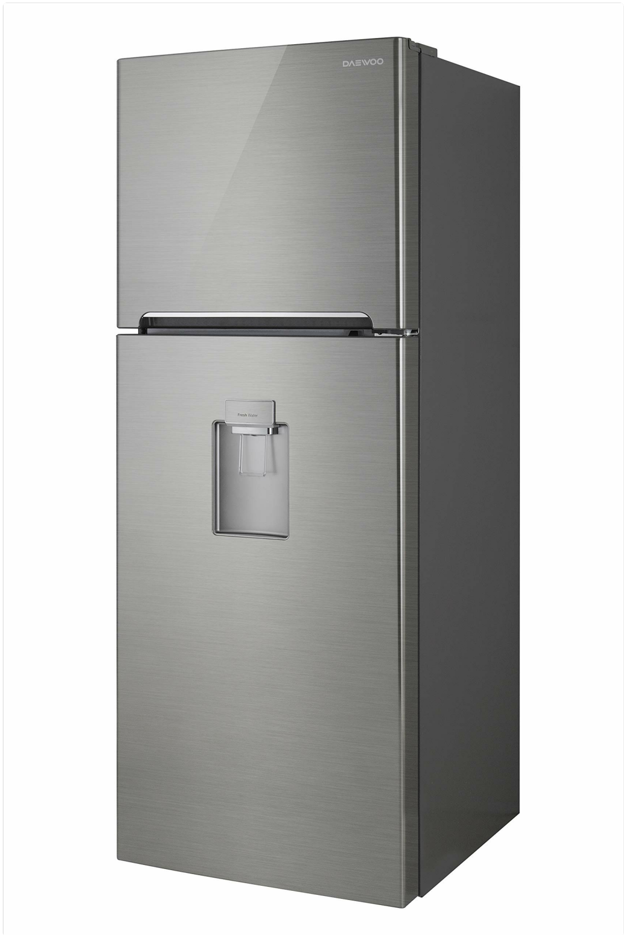
Figure 3.1: Front view of the Winia DFR-40515GGDX refrigerator, showcasing its silver finish and integrated water dispenser.