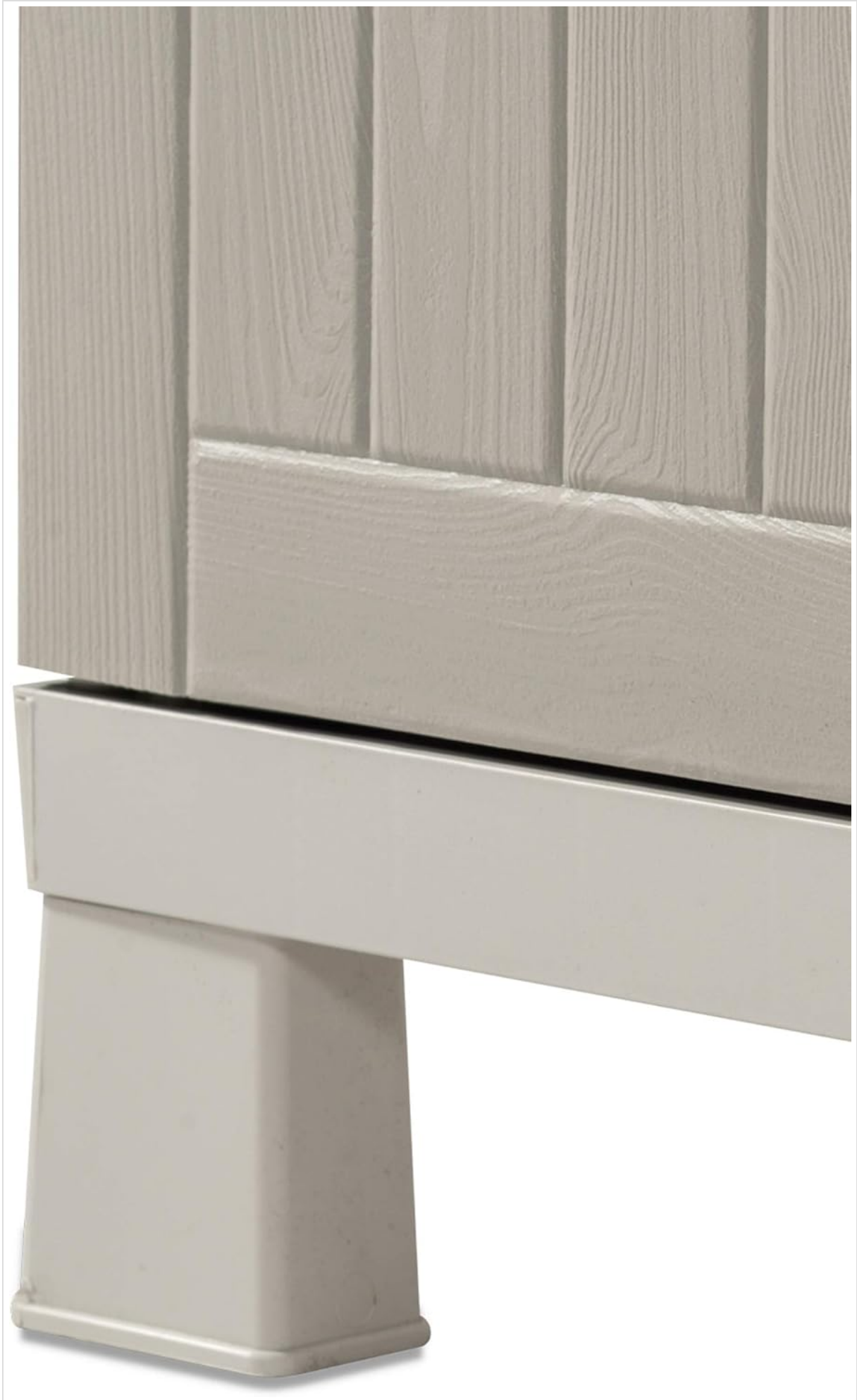
Adjustable feet for enhanced stability.