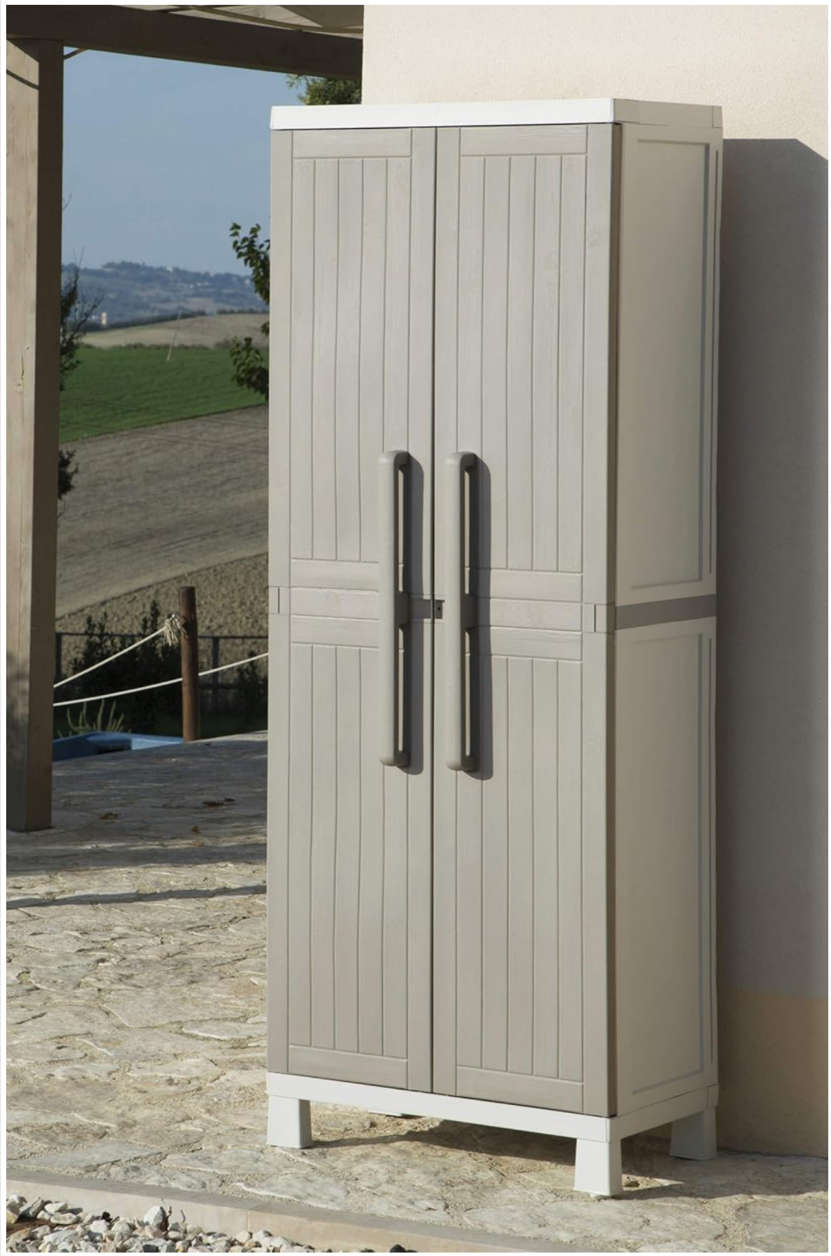
The Toomax Wood Midi Broom Cabinet provides versatile storage for various environments.