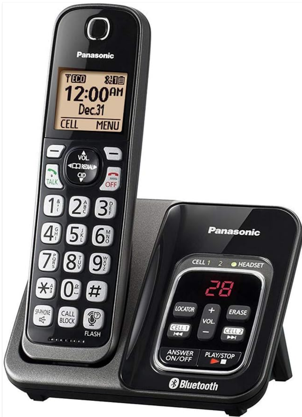
Image: The Panasonic KX-TG833SK cordless phone system, showing one handset docked in its base unit.