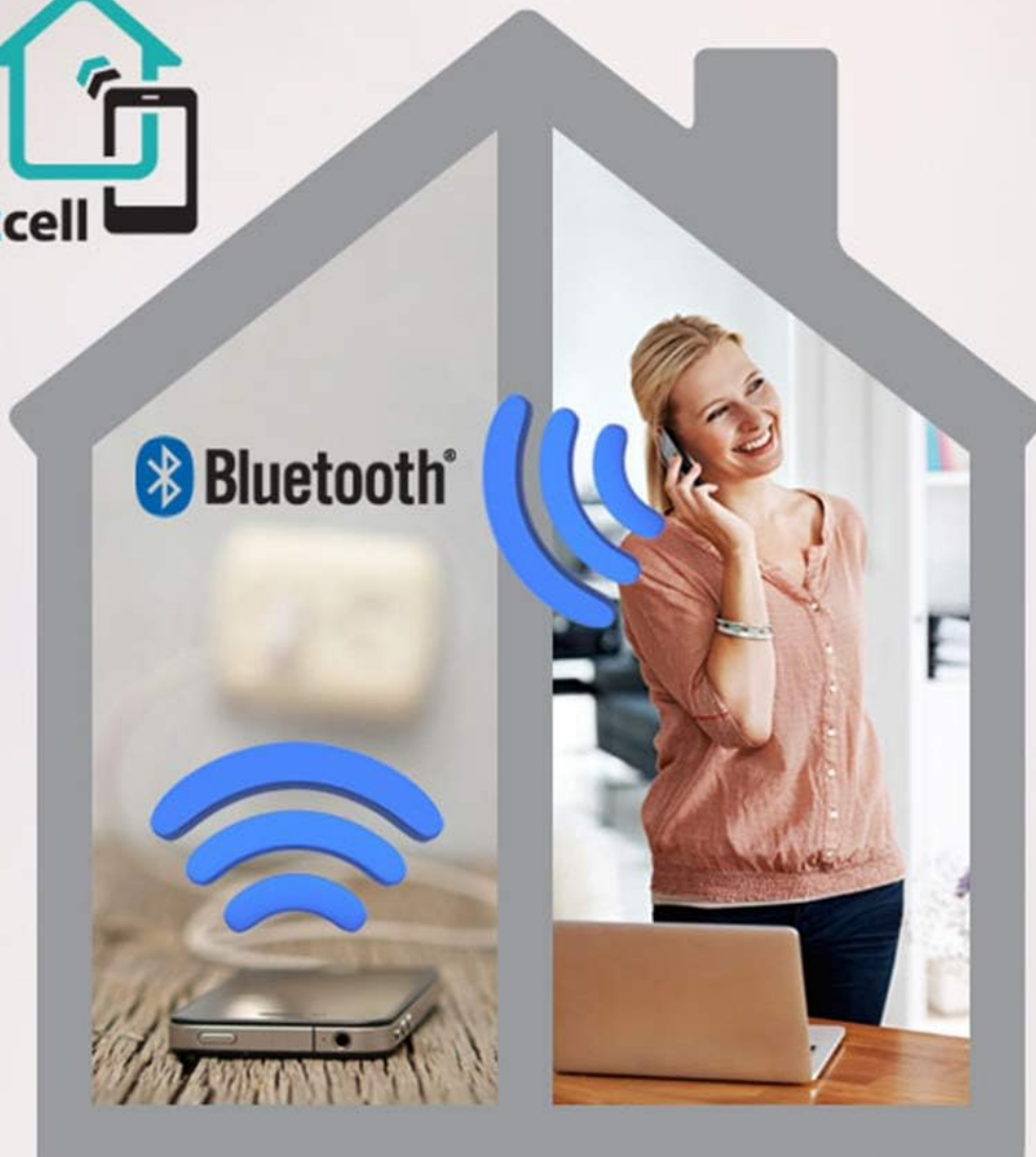
Image: A graphic depicting the Link2Cell feature, showing a cell phone connecting via Bluetooth to the Panasonic phone system inside a house.