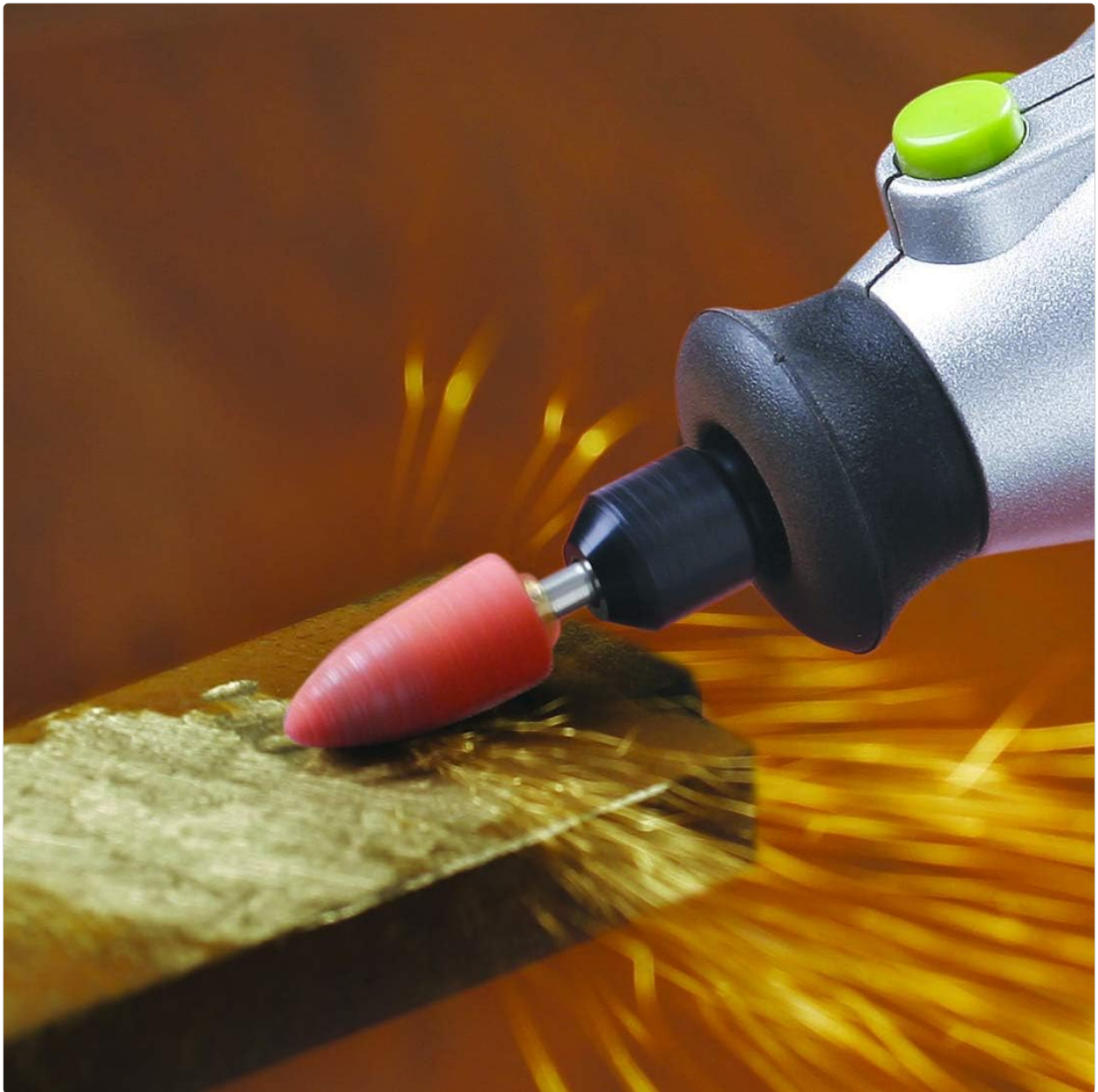
Image: A polishing felt wheel accessory attached to a rotary tool, polishing a metallic surface, highlighting its use for finishing.