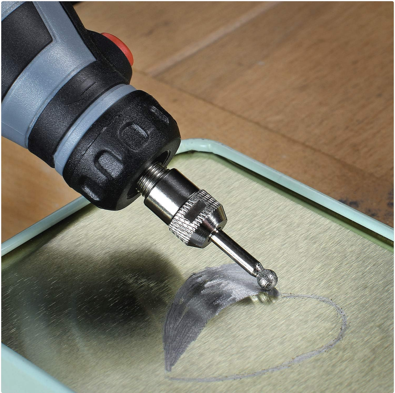
Image: A grinding stone accessory attached to a rotary tool, grinding a metal workpiece, showing spark generation.