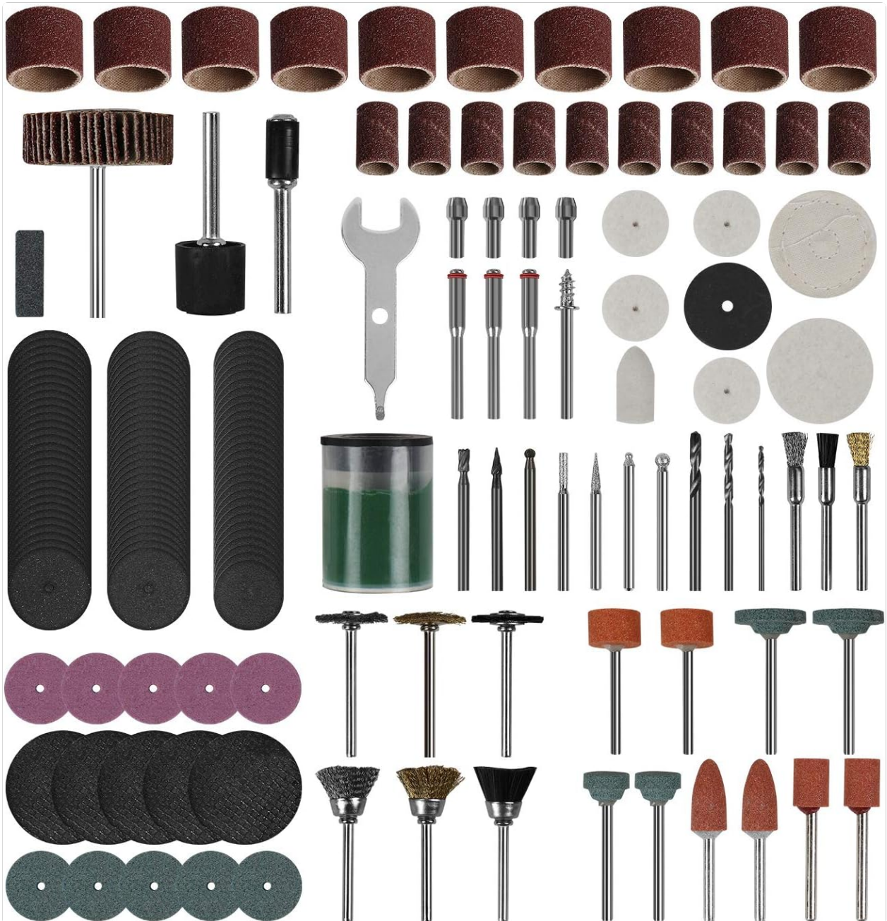
Image: All 208 individual accessories from the WORKPRO set laid out, showcasing the variety of bits, wheels, and brushes.