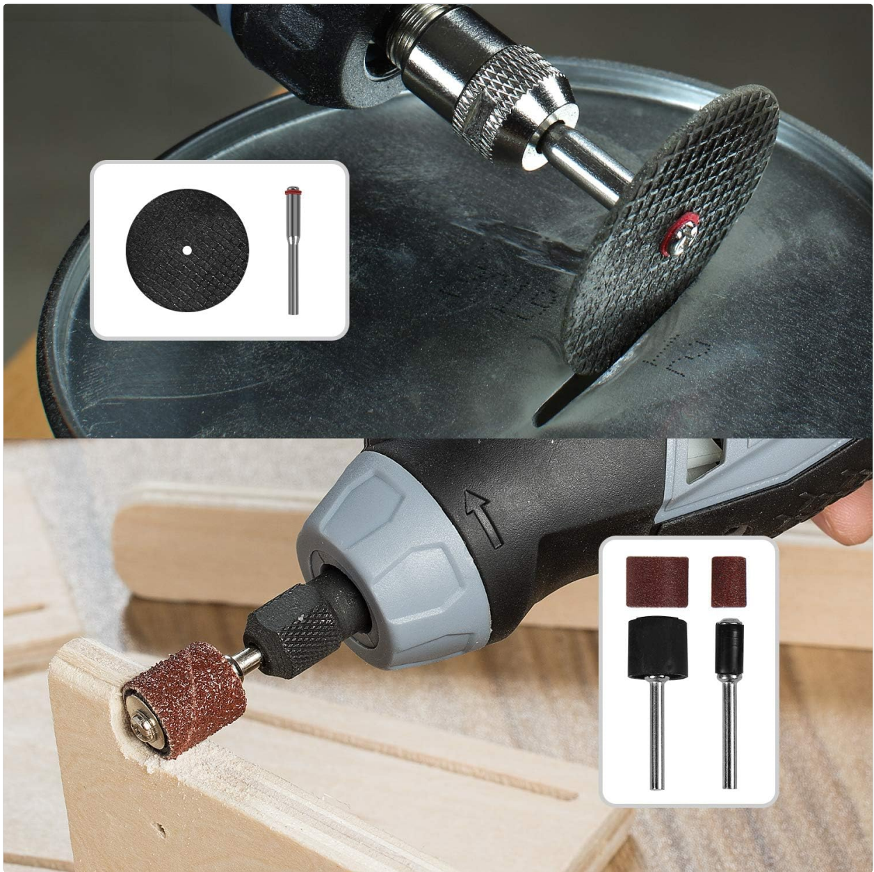
Image: A cutting disc accessory attached to a rotary tool, actively cutting a metal piece, demonstrating its application.