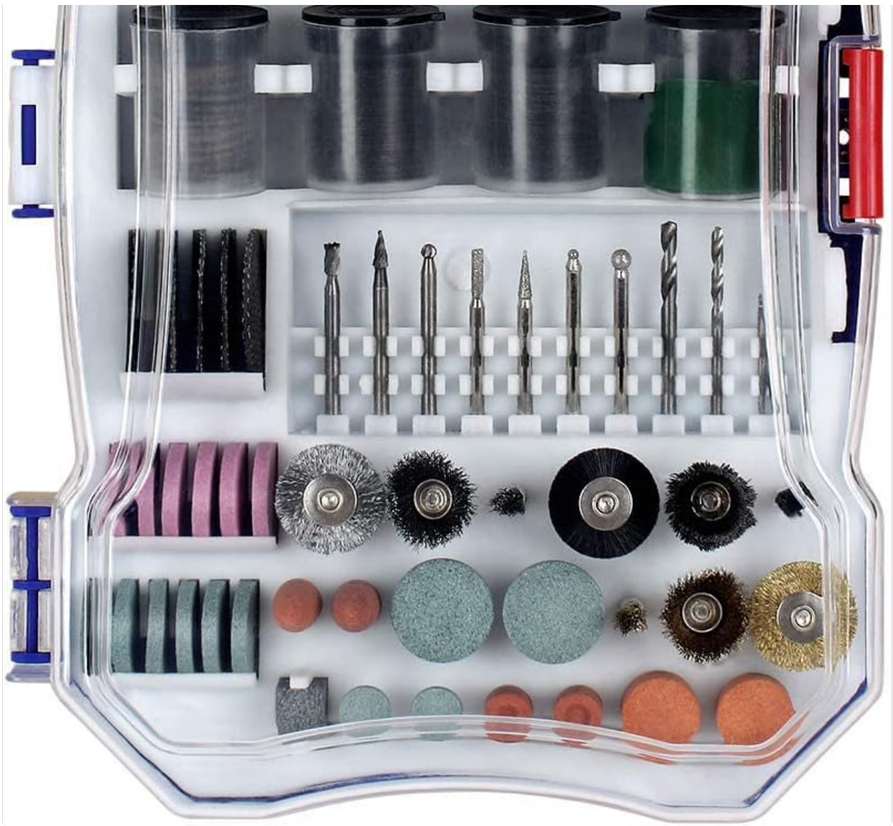
Image: The WORKPRO 208-Piece Rotary Tool Accessory Set in its clear, organized storage case, closed.