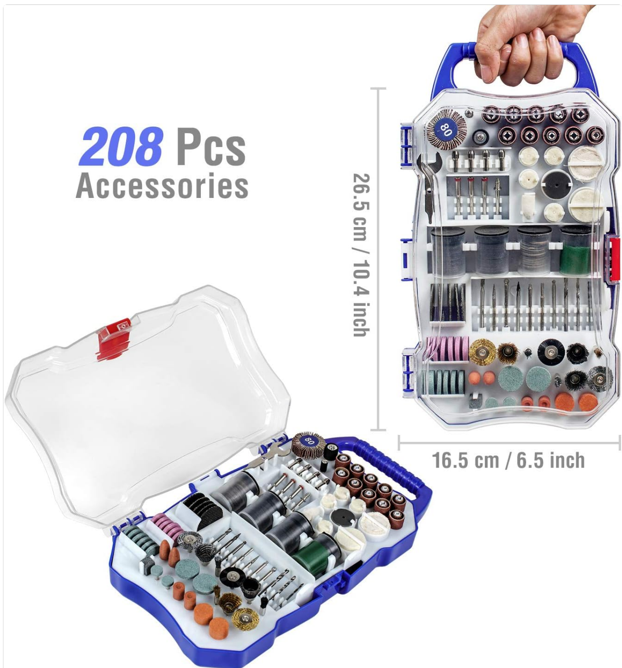
Image: Dimensions of the WORKPRO 208-Piece Rotary Tool Accessory Set storage case, measuring 26.5 cm (10.4 inches) in length and 16.5 cm (6.5 inches) in width.