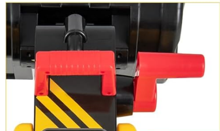
Flexible Control Levers