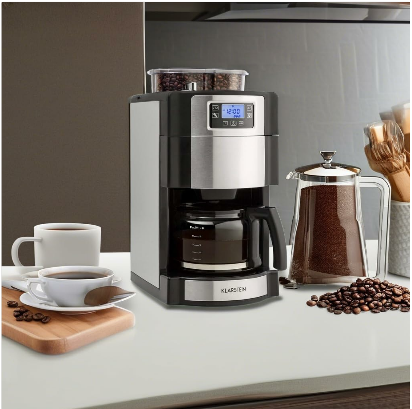
Image 5.2: The control panel displaying the digital clock and timer setting buttons.