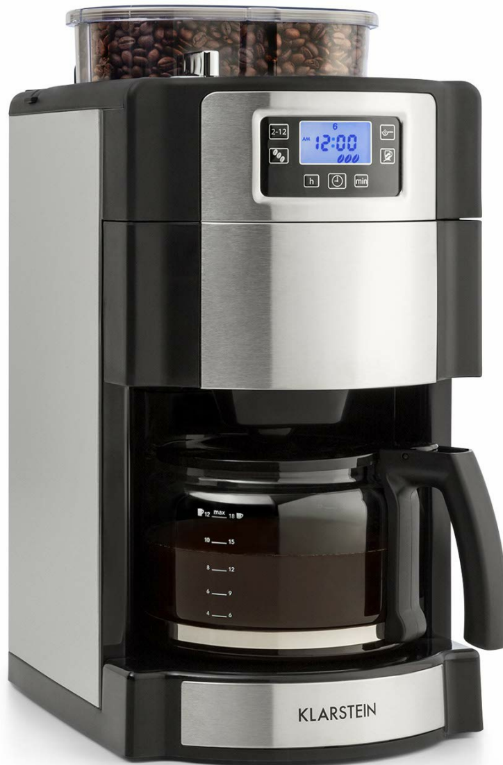
Image 1.1: Front view of the Klarstein Aromatica Nuovo Coffee Machine. The machine features a sleek black and silver design with a visible coffee bean hopper on top and a glass carafe below the brewing unit.