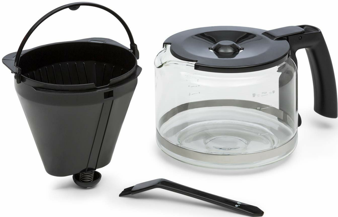
Image 3.1: The included glass jug, permanent filter holder, and cleaning brush.

Including glass jug, cleaning brush and removable filter holder