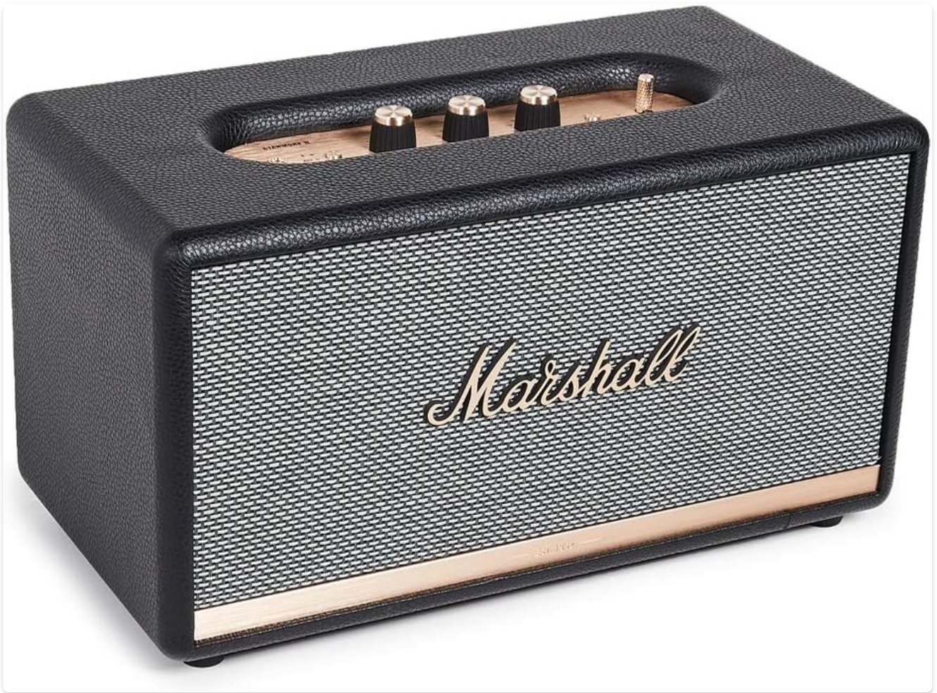
Figure 1: Front view of the Marshall Stanmore II Wireless Bluetooth Speaker.