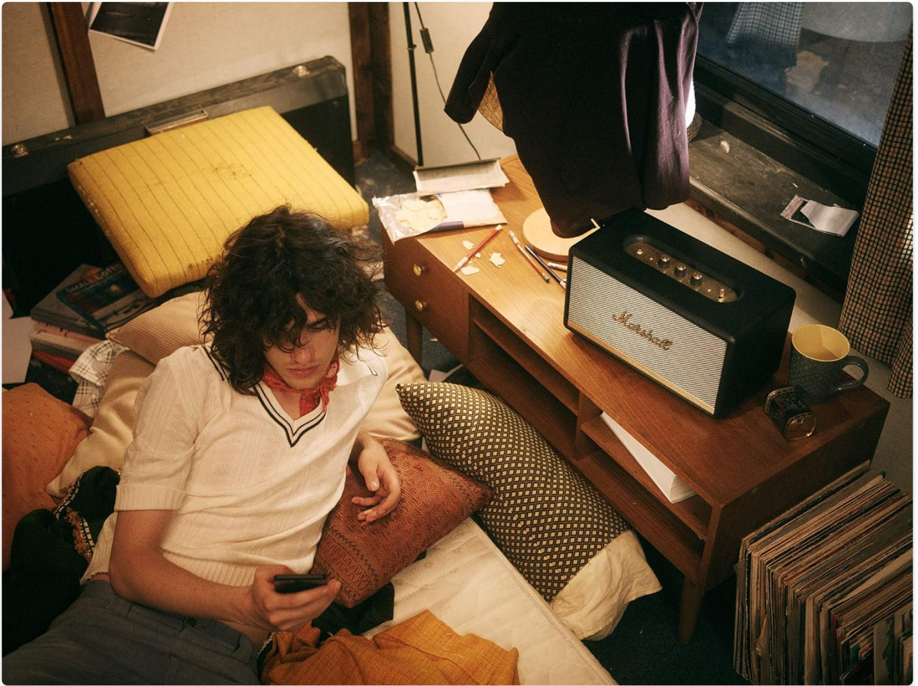
Figure 3: Example of speaker placement in a room.