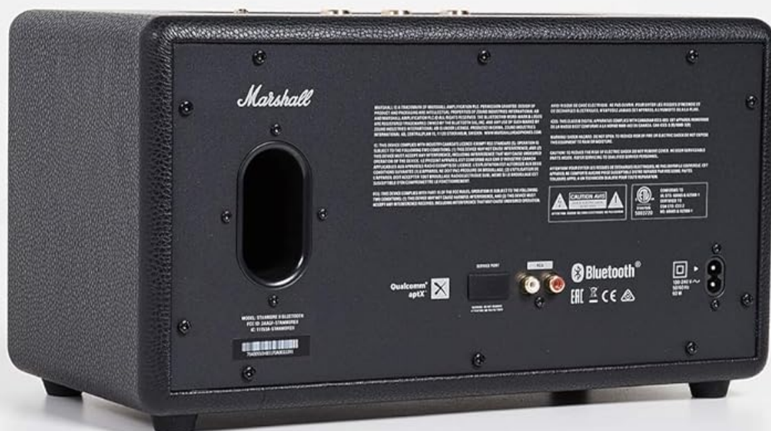
Figure 4: Rear panel of the speaker, illustrating power and audio input ports.