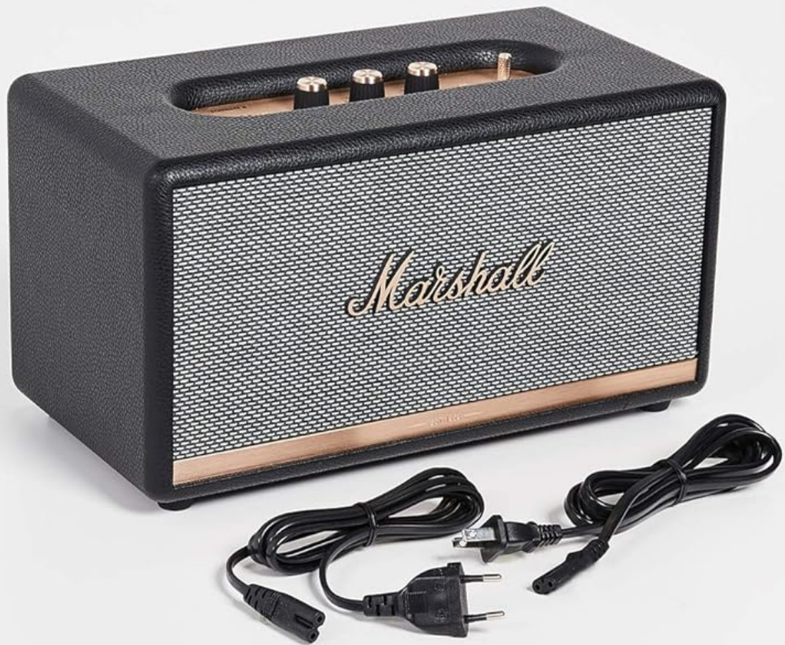
Figure 2: Marshall Stanmore II speaker shown with its accompanying power cables.