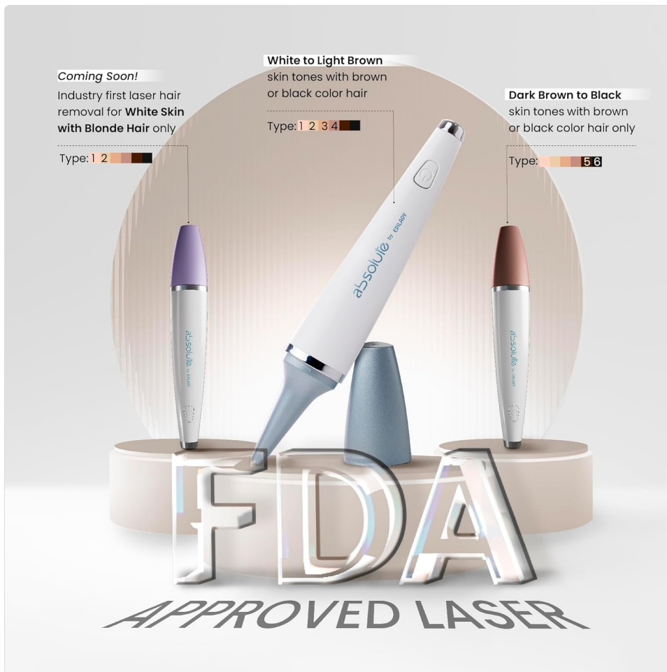
A visual guide illustrating the Epilady Epilaser Absolute's compatibility with different skin tones. It indicates suitability for White to Light Brown skin tones (Fitzpatrick Types 1-4) and Dark Brown to Black skin tones (Fitzpatrick Types 5-6). A note indicates future availability for White skin with Blonde hair.