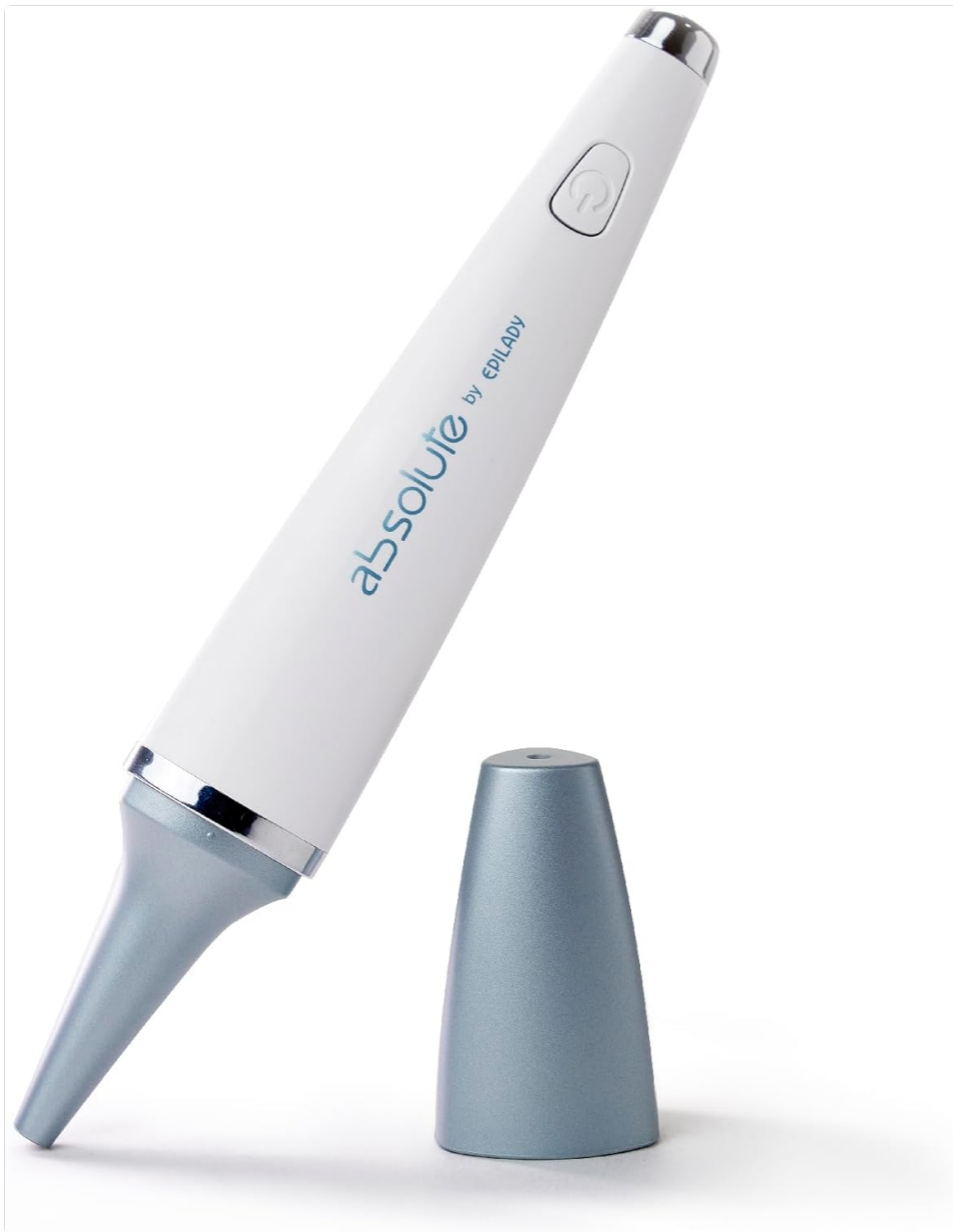
The Epilady Epilaser Absolute device, shown in white and silver, with its protective cap detached, highlighting its sleek design and compact size.