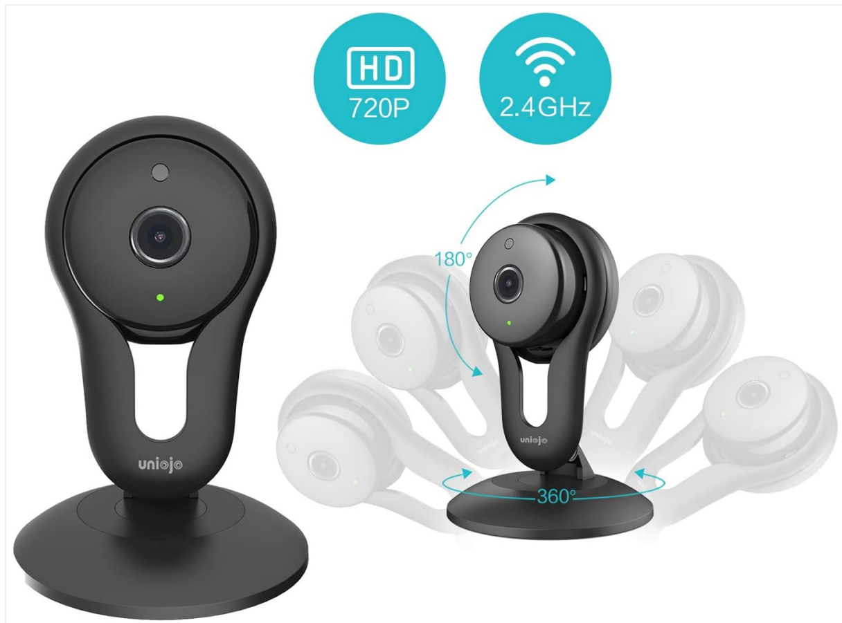
Figure 2: The UNIOJO WiFi Camera features a design that allows for 180-degree vertical adjustment and 360-degree horizontal rotation for flexible viewing angles.