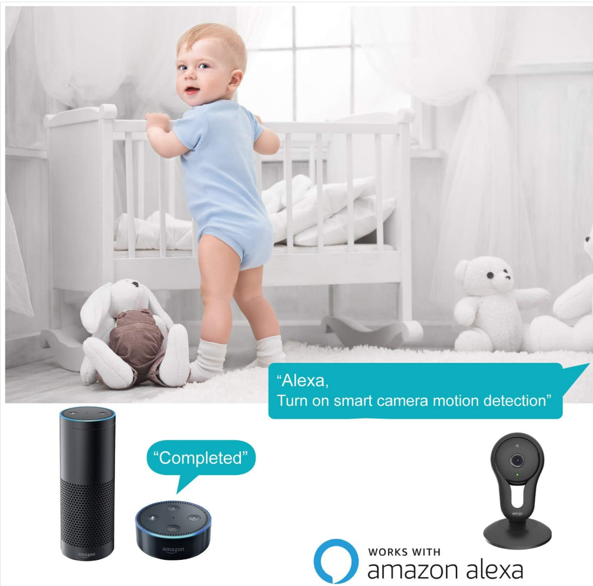
Figure 8: The camera integrates with Amazon Alexa, allowing voice commands for functions like activating motion detection, as demonstrated with an Echo device.