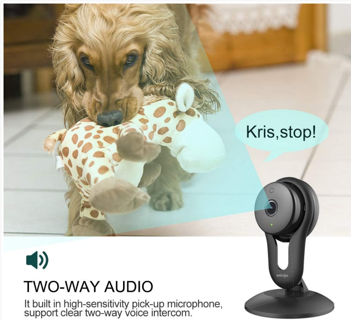
Figure 5: Illustration of the two-way audio feature, allowing users to communicate through the camera's built-in microphone and speaker.

The camera features a built-in microphone and speaker, enabling two-way communication. Use this feature through the app to speak to individuals near the camera or comfort pets.