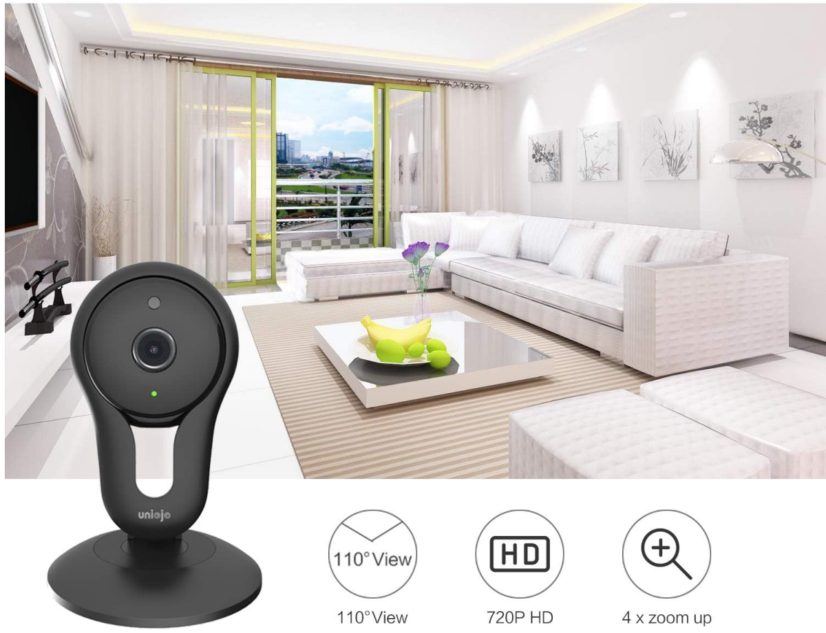
Figure 7: When motion detection is active, the camera sends automatic real-time alarm messages to your smartphone, alerting you to detected activity.

1280*720P HD resolution, 110° wide-angle lens, Digital zoom up to 4x