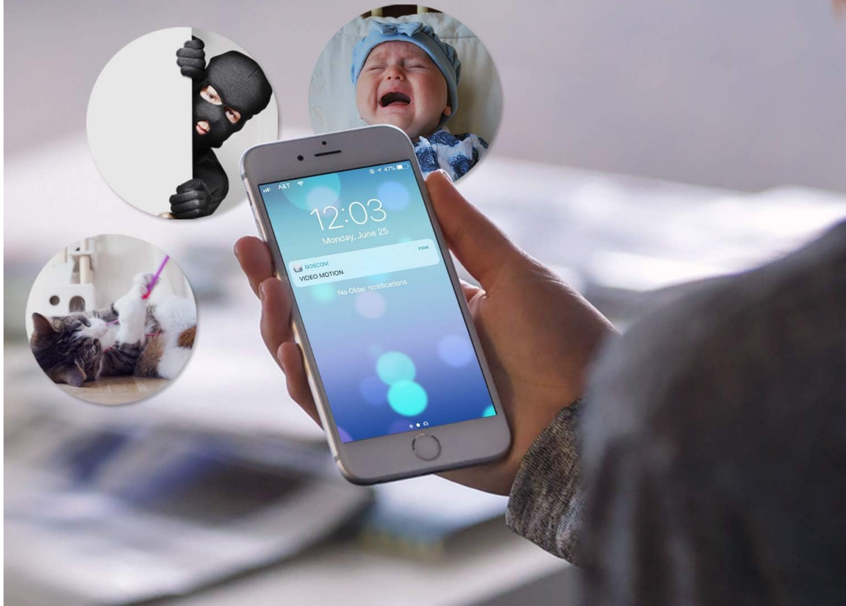
Figure 3: The camera provides a 110-degree wide-angle view with 1280x720P HD resolution, allowing for comprehensive monitoring of an entire room.

When motion detection is turned on, the real-time alarm message will automatically prompt you on your phone.