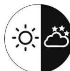
Day & Night