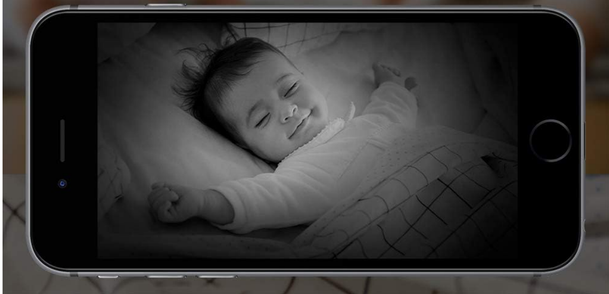
Figure 6: The camera's 720P FHD quality and clear IR night vision allow it to capture bright and clear images in dark environments, as shown with a sleeping baby.

With high-performance IR LED offers bright night vision, it can capture the clear night living image at dark night.