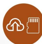
Multiple Storage Options