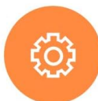
Quick & Easy setup