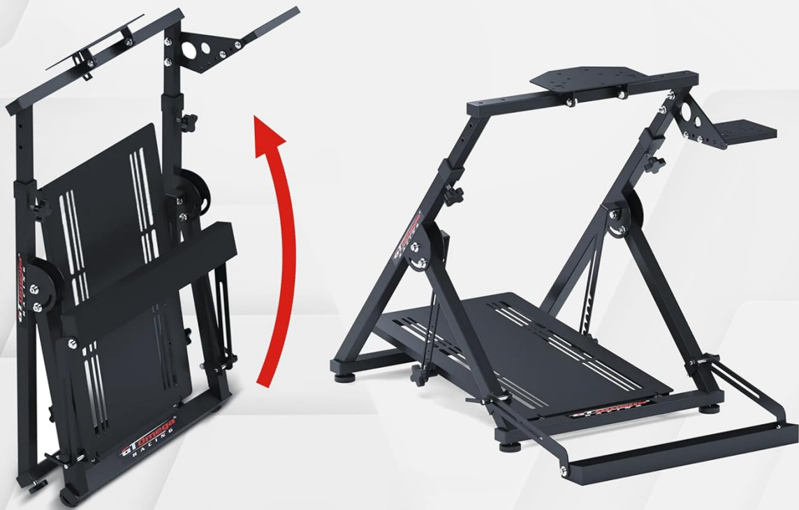
Image: The GT OMEGA APEX Wheel Stand shown in both its unfolded, ready-to-use state and its compact, folded state for easy storage.

Son cadre léger et sa fonction pliable font de ce support volant la solution idéale si tu manques de place mais que tu veux un stand fiable pour ton sim racing