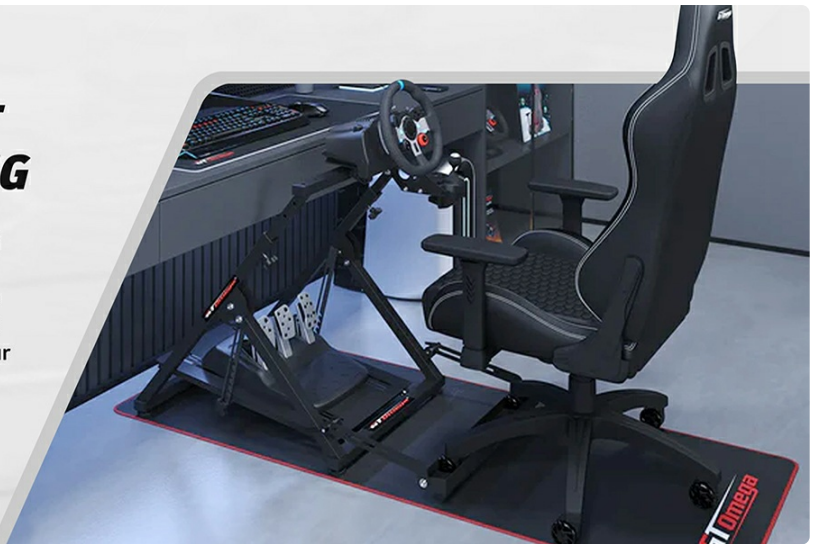
Image: The GT OMEGA APEX Wheel Stand demonstrating its fully adjustable configuration, including adjustable wheel plate, left/right shifter mount, and chair link.

Le Wheel Stand Apex est prêt à l'emploi pour te garantir une expérience de course fluide et immersive dès la sortie de la boîte. Le Wheel Stand Apex inclut une fixation Chair Link et un support pour levier de vitesse, pour encore plus de compatibilité et de stabilité.