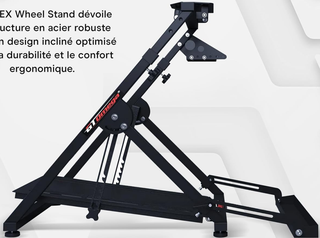
Image: A detailed view of the GT OMEGA APEX Wheel Stand's robust steel structure, highlighting its stability features and general assembly.

Le APEX Wheel Stand dévoile sa structure en acier robuste avec un design incliné optimisé pour la durabilité et le confort ergonomique.