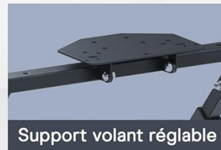
Support volant réglable