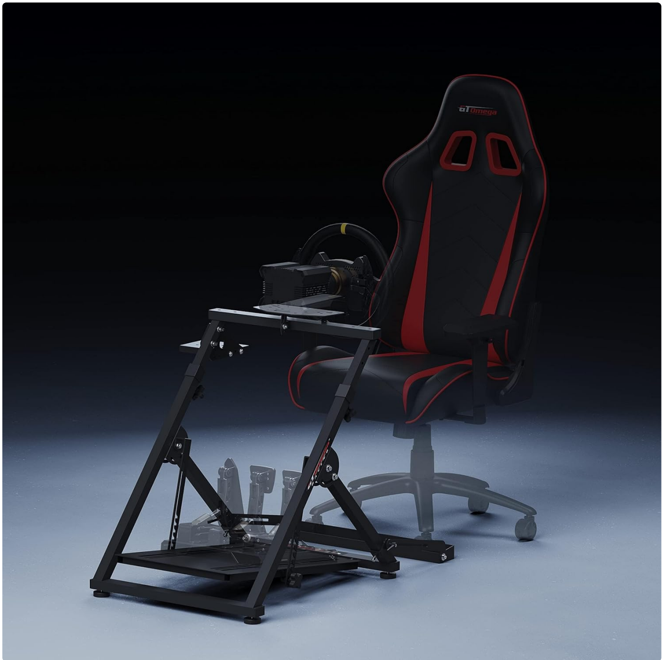
Image: The GT OMEGA APEX Wheel Stand set up with a gaming chair, showcasing its compact design and readiness for use.