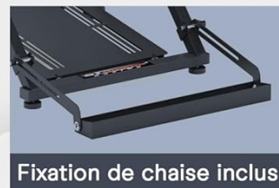
Fixation de chaise inclus

Image: Close-up of the adjustable wheel plate on the GT OMEGA APEX Wheel Stand, illustrating height and angle customization.