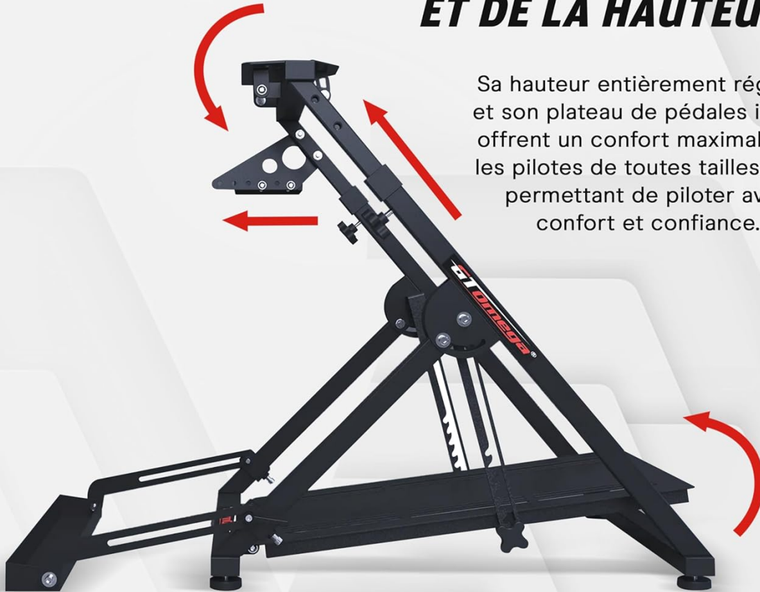
Image: The GT OMEGA APEX Wheel Stand highlighting the adjustable pedal plate, allowing users to customize the angle for ergonomic comfort.

Sa hauteur entièrement réglable et son plateau de pédales incliné offrent un confort maximal pour les pilotes de toutes tailles, vous permettant de piloter avec confort et confiance.