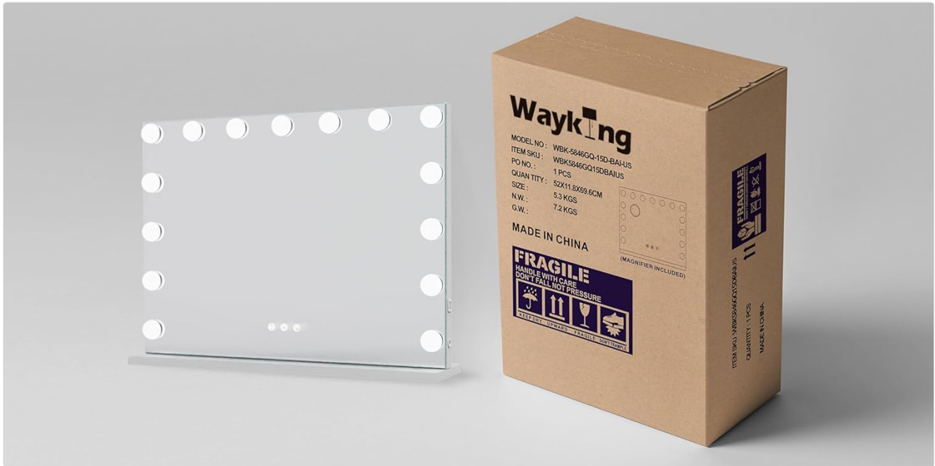
Figure 2: Product packaging and mirror, indicating careful handling is required.