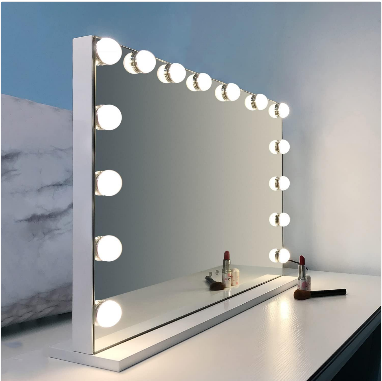
Figure 1: WAYKING Vanity Mirror with Lights, showcasing its sleek design and illuminated bulbs on a vanity table.