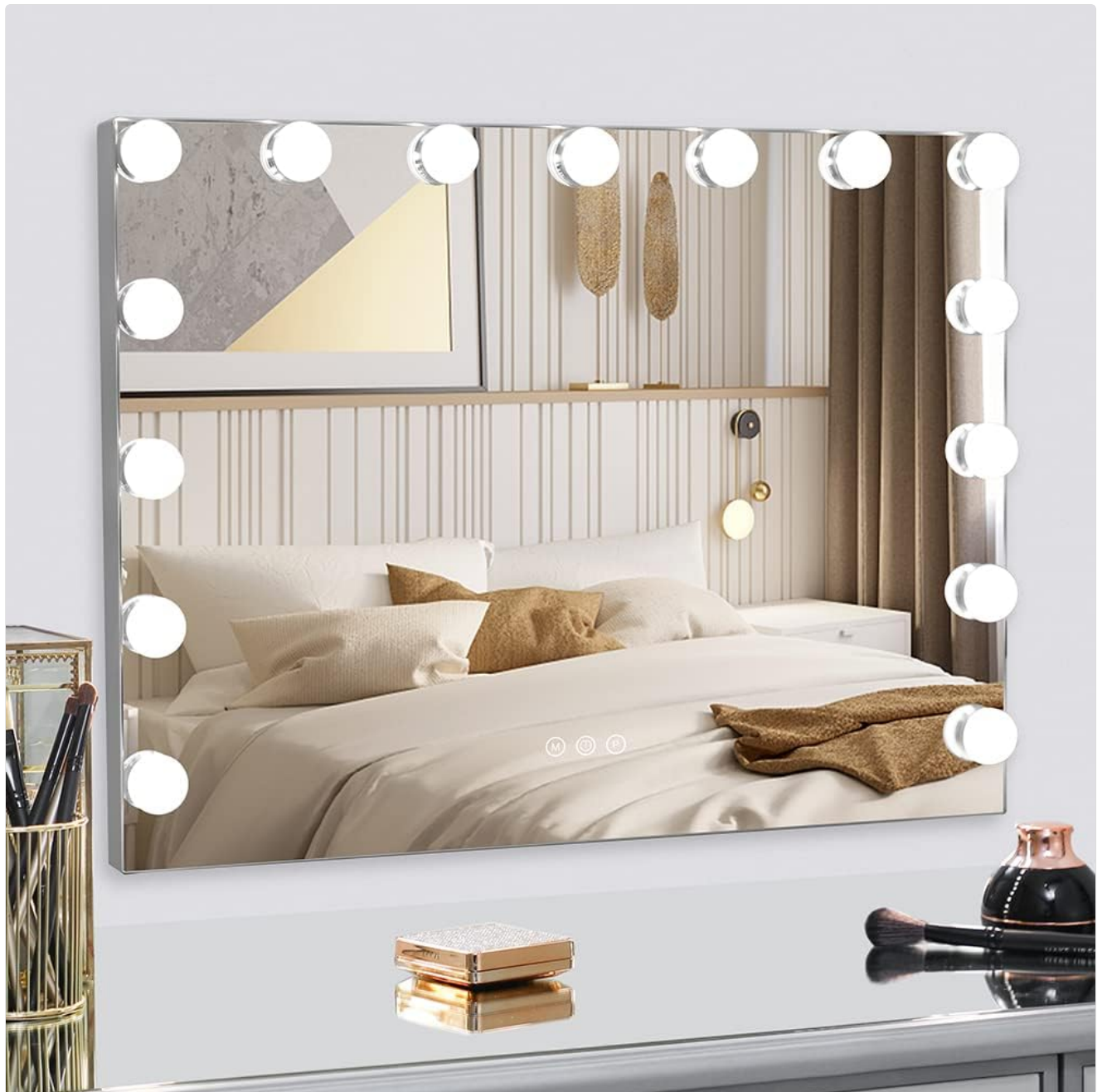
Figure 3: The vanity mirror shown in a wall-mounted configuration, demonstrating its versatility.