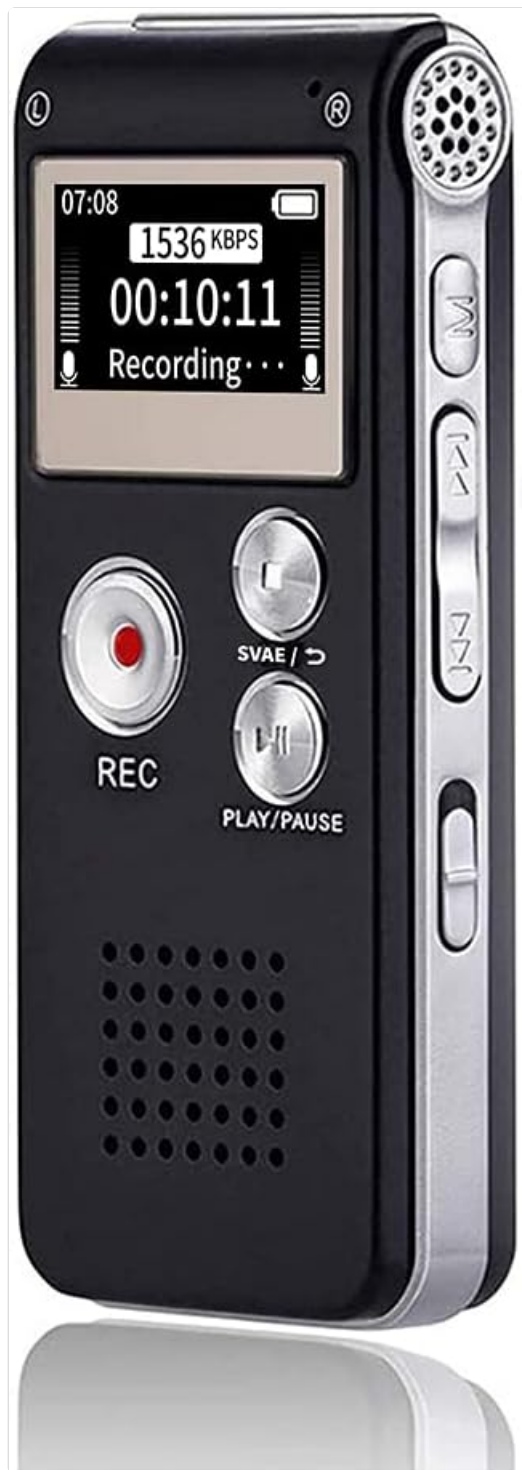
Main view of the Sunlan Digital Voice Recorder.