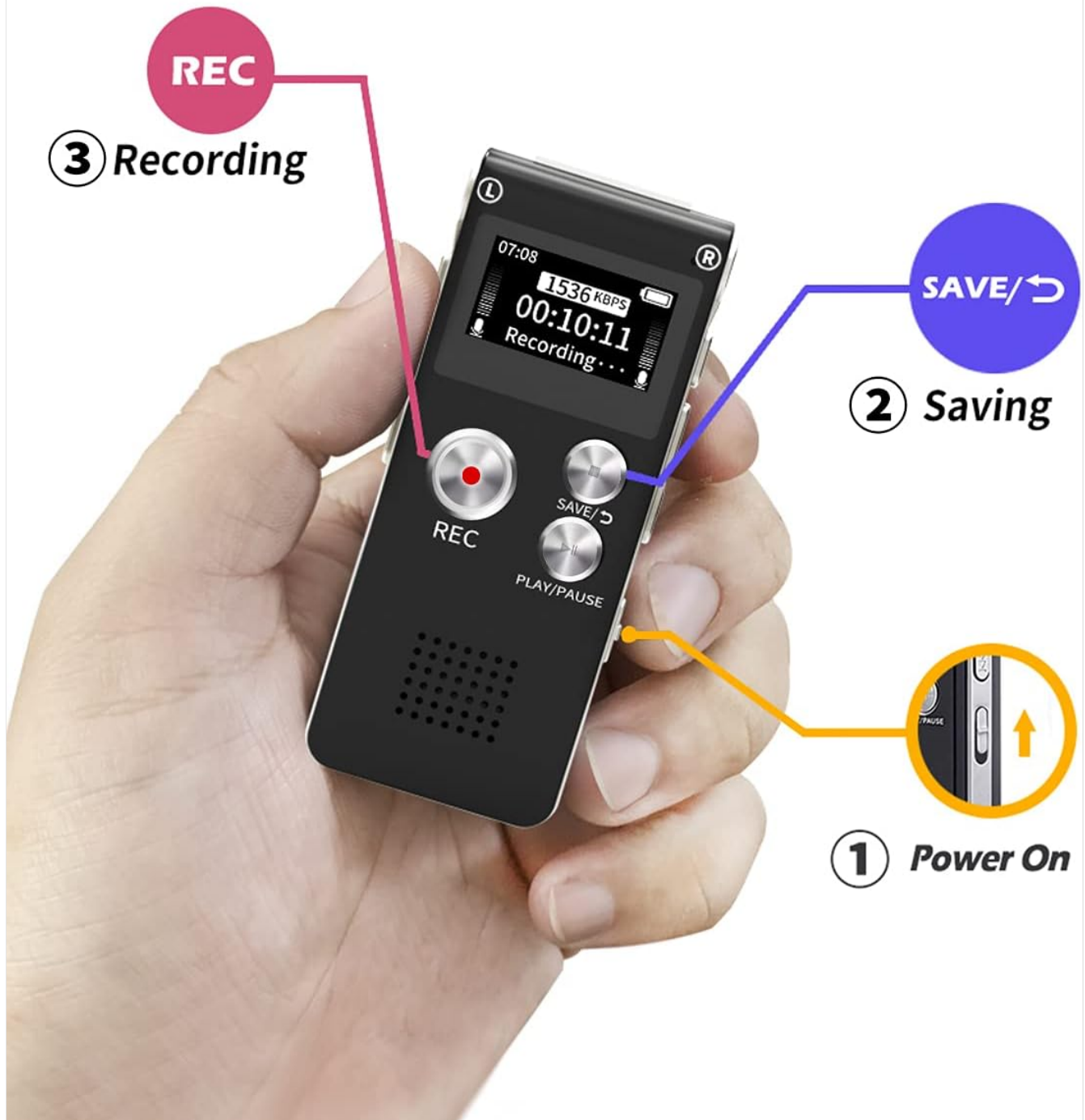
Simple operation: Power On, Saving, Recording.