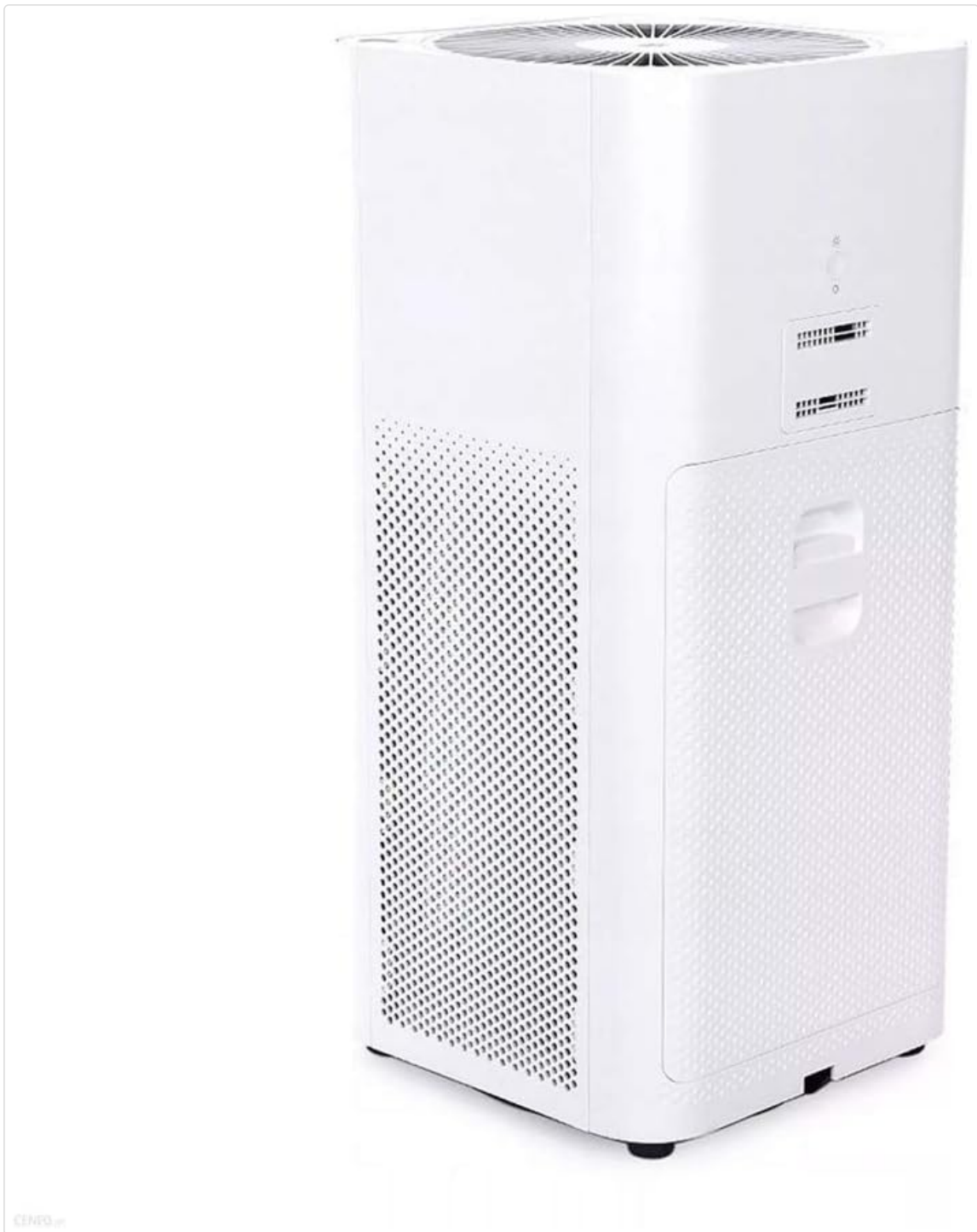
Image: Rear view of the Xiaomi Mi Air Purifier 2S, illustrating the location of the filter compartment cover for maintenance.