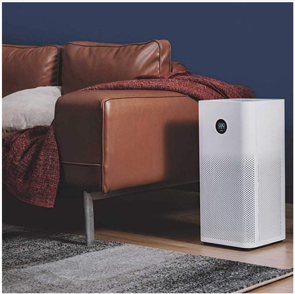
Image: The Xiaomi Mi Air Purifier 2S positioned in a modern living room, demonstrating its compact design and how it blends with home decor.