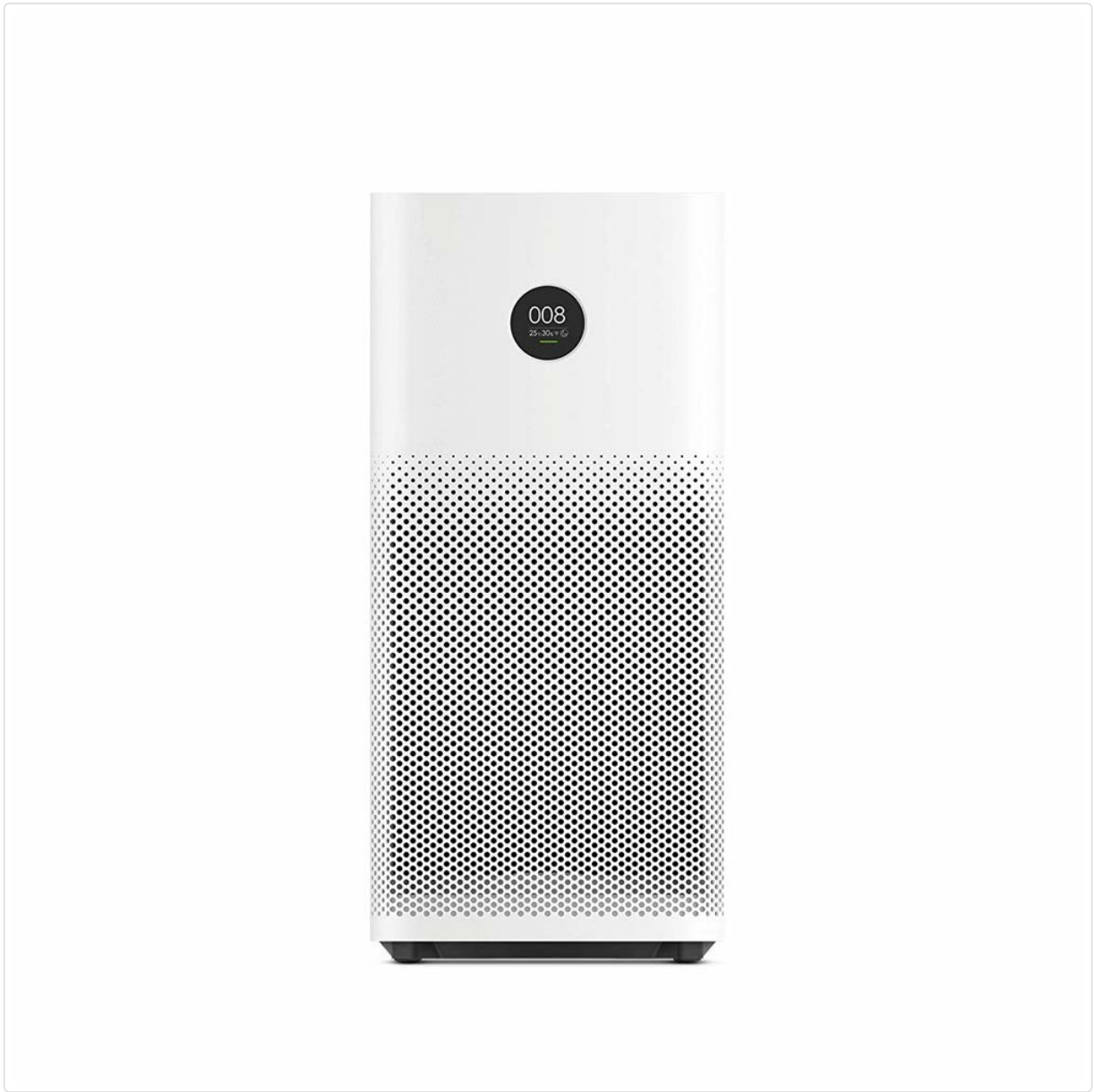
Image: Front view of the Xiaomi Mi Air Purifier 2S, showing the main body and the circular OLED display.