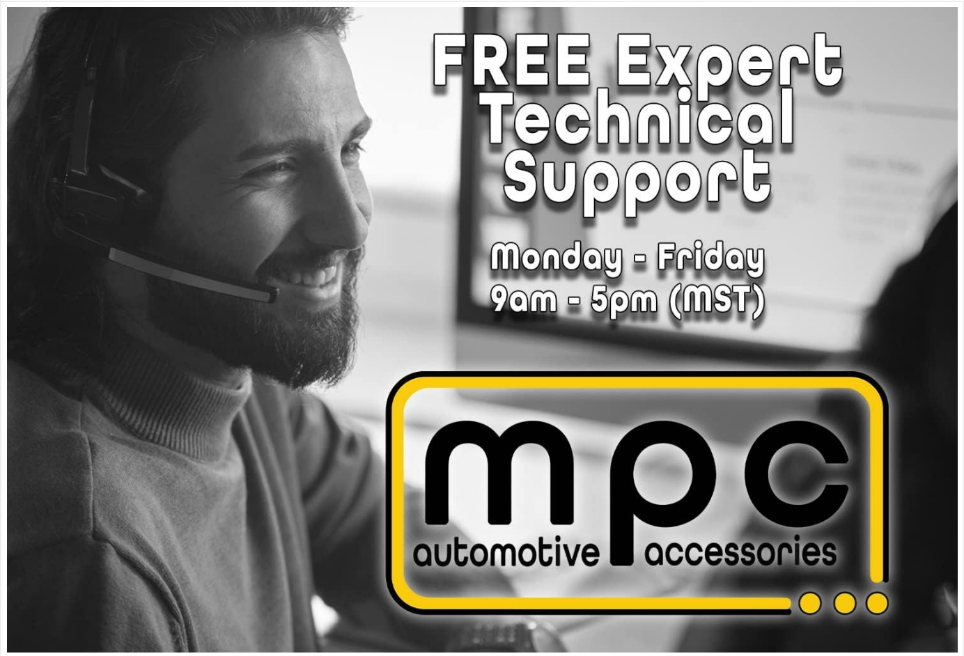
Figure 8: MPC provides expert technical support for installation and operational queries.