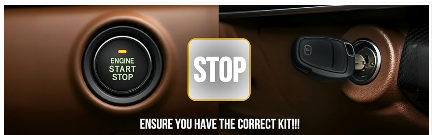
Figure 3: Important visual distinction between compatible key-start ignition and incompatible push-to-start ignition systems.