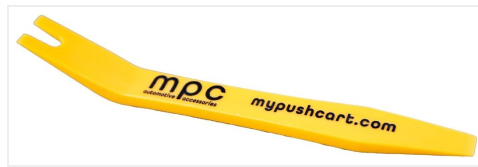
Figure 7: A typical pry tool, often useful for safely removing interior panels during installation.