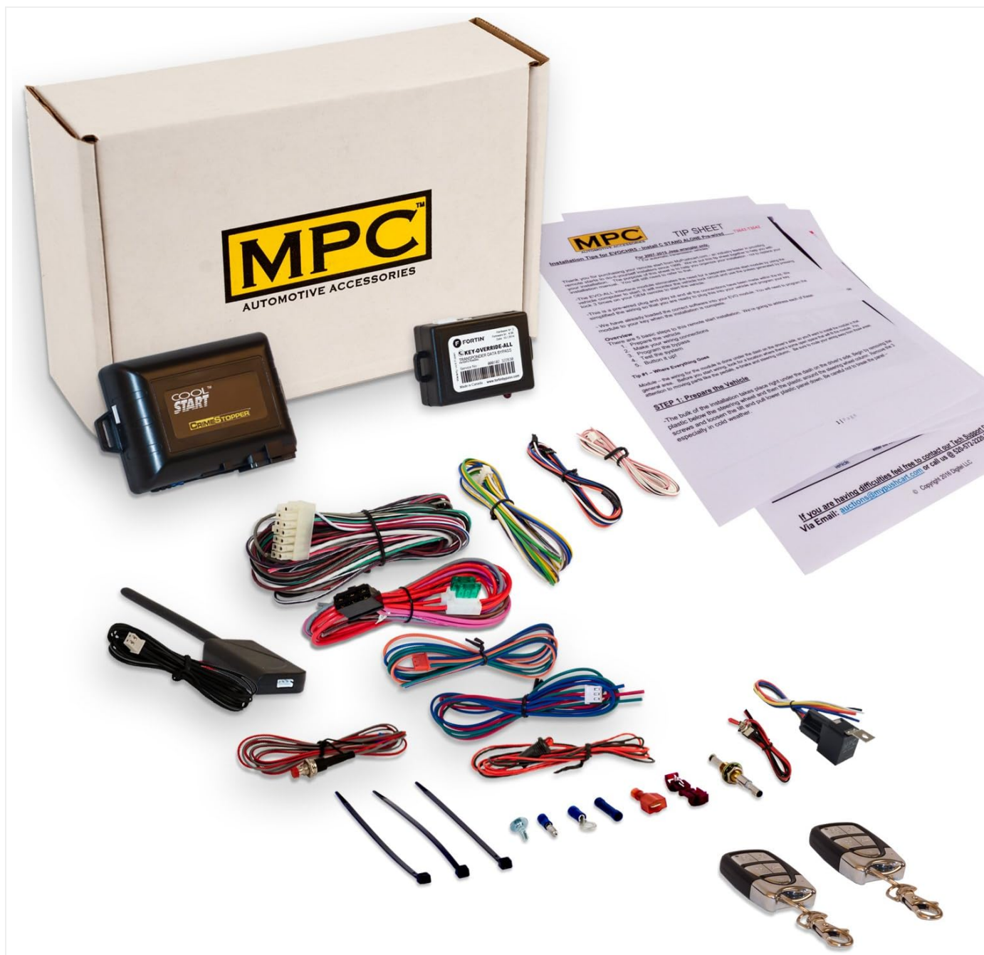
Figure 1: Complete MPC 5-Button Remote Start System kit, including the main module, wiring harnesses, and two 5-button remote controls.