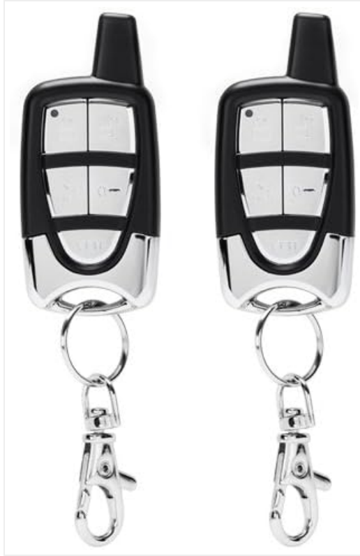
Figure 4: The two included 5-button 1-way remote controls for operating the system.