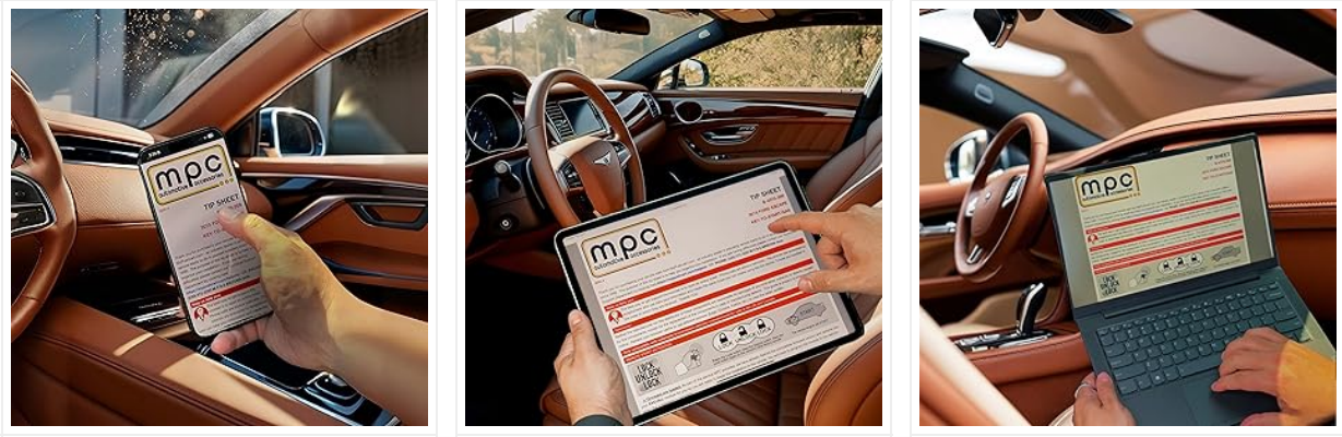
Figure 5: Examples of accessing the MPC installation tip sheet on various devices (smartphone, tablet, laptop).