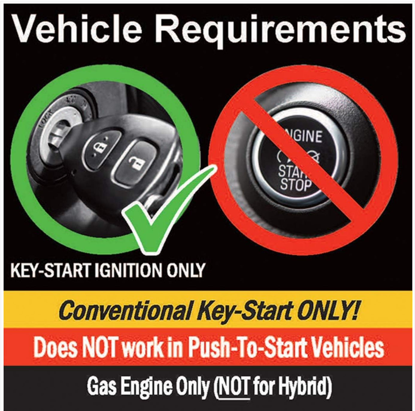
Figure 2: Visual guide indicating compatibility with key-start ignition systems and incompatibility with push-to-start systems.