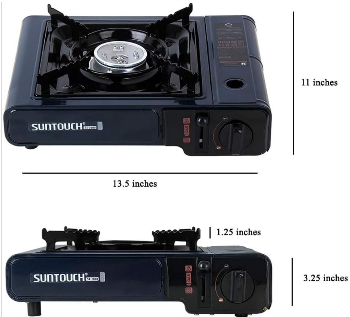
Figure 1: Top and side views of the Suntouch ST-7000 Portable Gas Stove, illustrating its approximate dimensions: 13.5 inches length, 11 inches width, and 3.25 inches height.