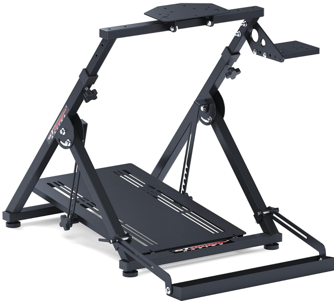
Figure 1.1: The GT OMEGA Apex Racing Wheel Stand in its assembled state, showcasing its robust design.