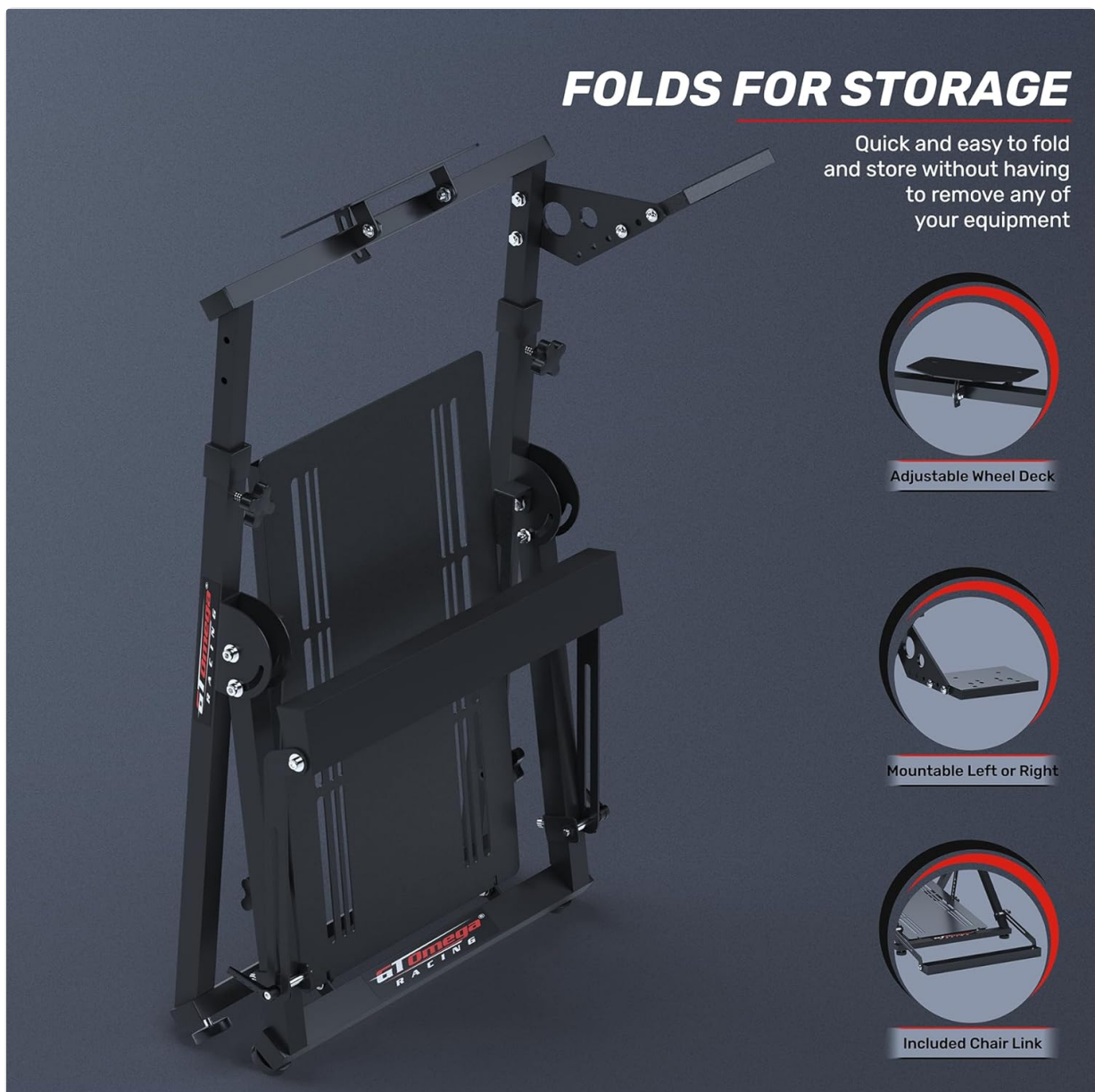
Figure 3.1: Visual guide demonstrating how the Apex Racing Wheel Stand folds for compact storage, highlighting the adjustable wheel deck, mountable shifter, and included ChairLink.