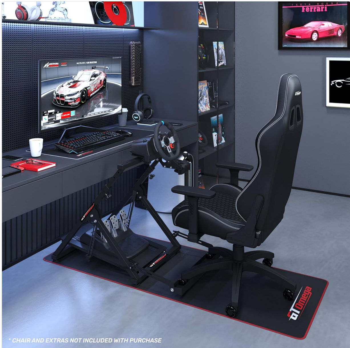
Figure 2.2: The Apex Racing Wheel Stand set up with a gaming chair, demonstrating the use of the ChairLink for enhanced stability. Chair and other accessories are not included.