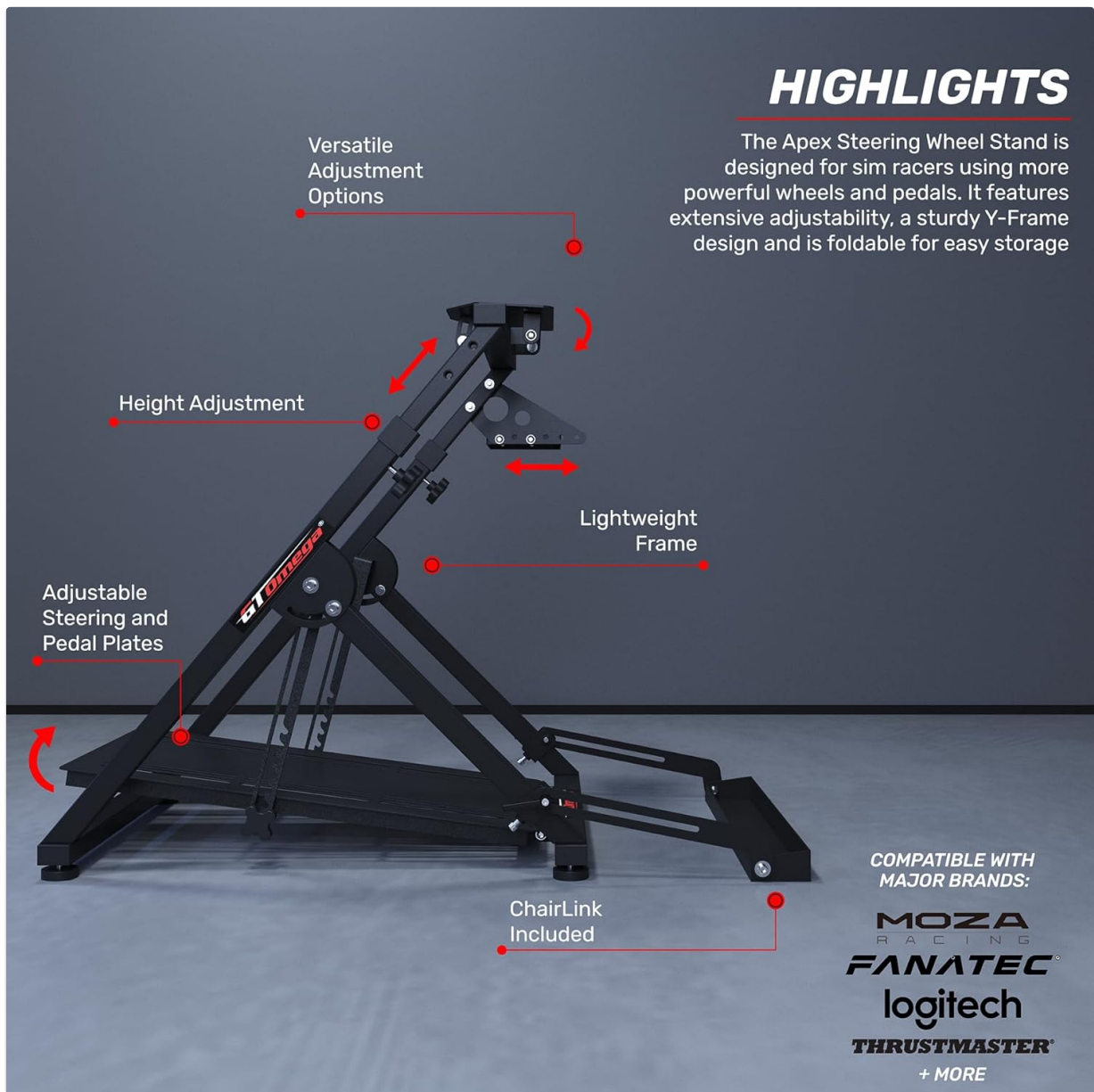
Figure 1.2: Diagram highlighting the versatile adjustment options, height adjustment, adjustable steering and pedal plates, and the included ChairLink feature of the Apex Wheel Stand.