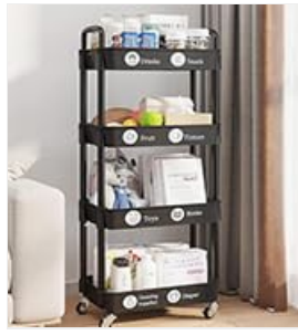
Image 5.1: The waterproof fabric helps protect contents from moisture.