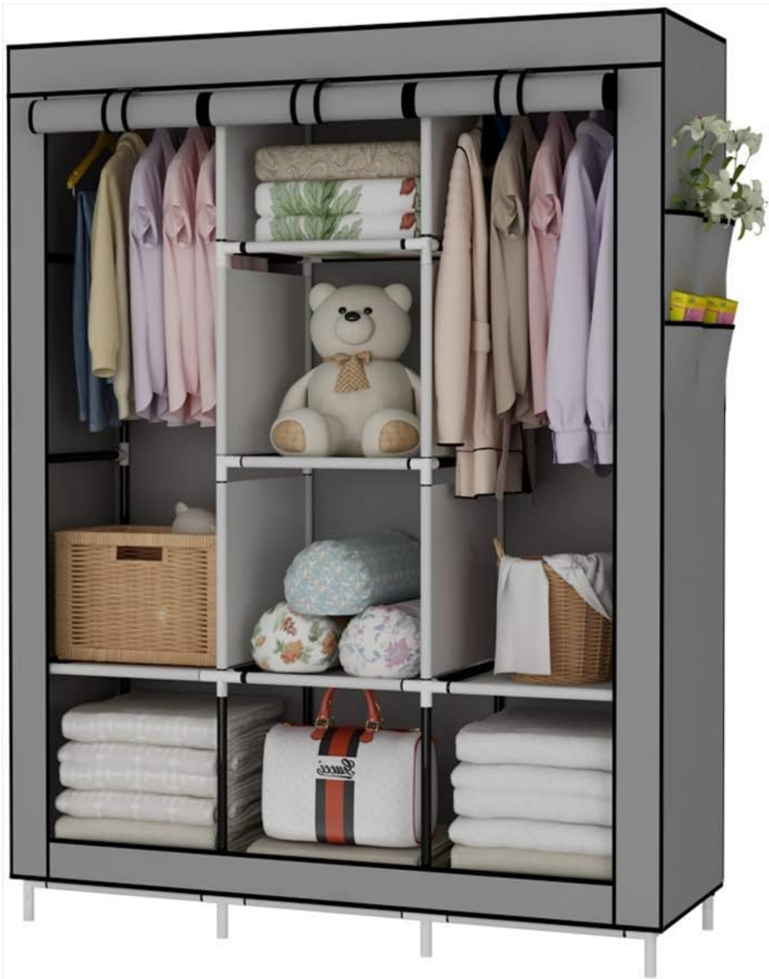
Image 1.1: Fully assembled UDEAR Portable Wardrobe Closet, showcasing its storage capacity with clothes on hangers, folded items on shelves, and items in side pockets.